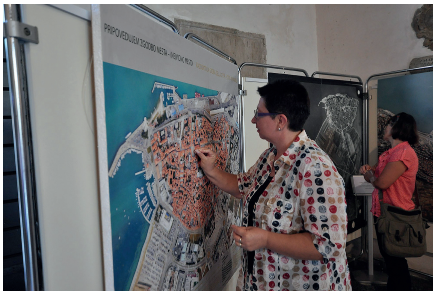
Image 1. '(In)Visible City' ( Nevidno mesto/Città invisibile ), cultural mapping. Photo: Zdenko Bombek 2012.

a decade ago, the concept of 'memory talk' is what actually happened among the members of the local population, but in a public and semi-formal setting. Below, I provide a brief overview of the topics and how locals responded to the events, followed by a more in-depth analysis of the key insights.