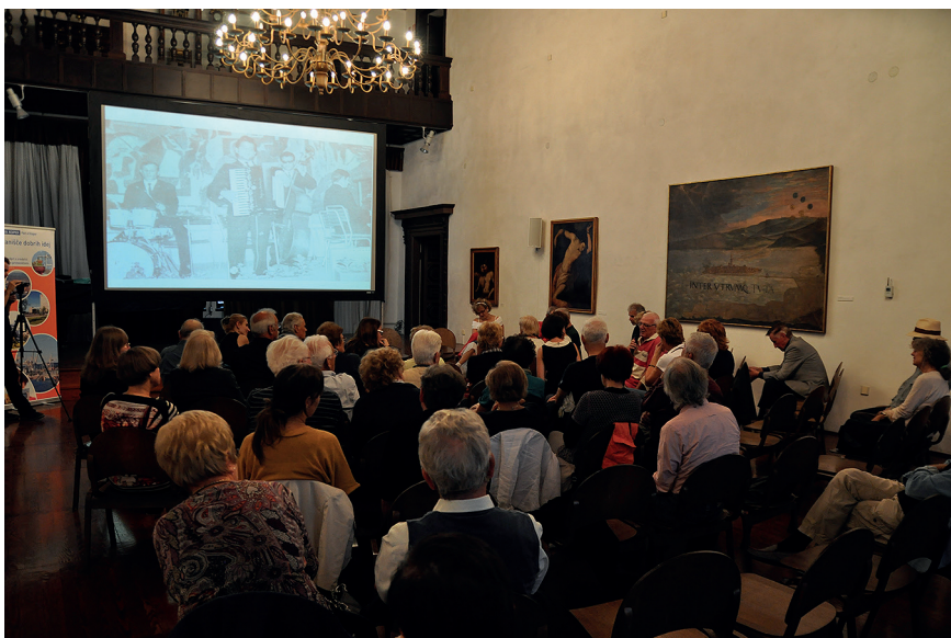
Image 4. Memory talk at the event titled "How we danced!", September 2013.

tors, while none of the workers, mainly Serbian/Croatian-speaking persons, participated. The last two 'memory evenings' addressed social activities in the past. One was dedicated to the dance pools in Koper (the event was entitled 'How we danced!' or Ma smo plesali! / Come ballavamo! ) and it took place in September 2013; this event also mainly attracted participants from the older generations, but of different backgrounds. Although not as popular as some of the previous events, it did provide valuable learning opportunities, namely documentary evidence of several sites in the historic core re-discovered as social lenses into the past.