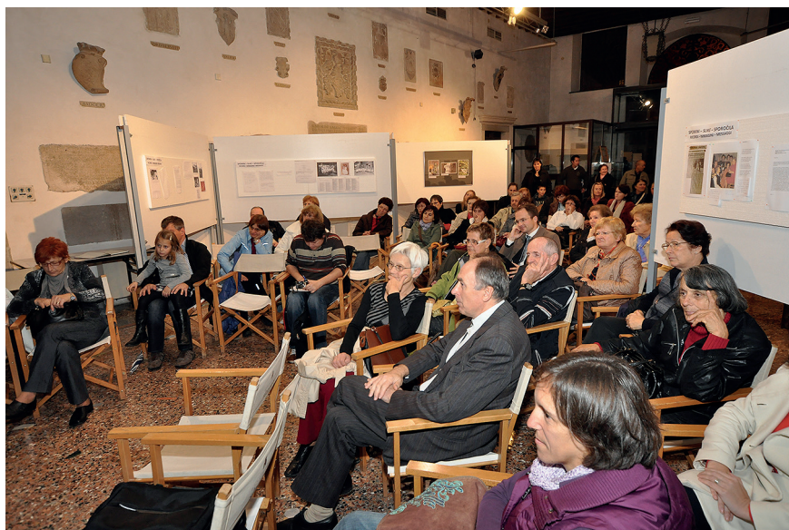
Image 2. Participatory exhibition accompanying the memory evening entitled 'Birthplace', November 2012.