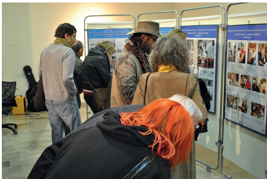
Image 5. Retrospective exhibition entitled 'We are telling the story of the town' ( Pripovedujemo zgodbo mesta/Raccontiamo la storia della città ), January 2014.

attention (Image 5), and the main reaction of many of the participants was 'We want more of these events; please do not stop!'