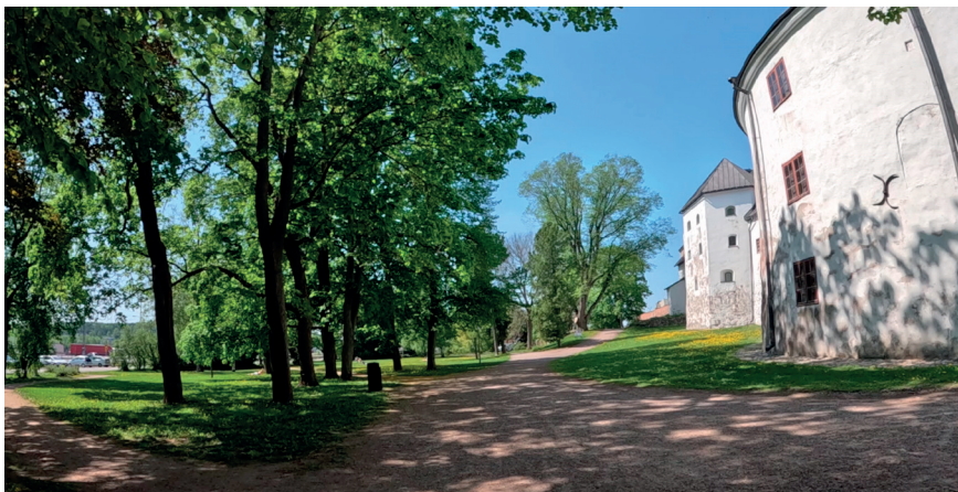
Photo 4: Linnanpuisto was a popular destination among the interviewees. They found the natural greenery and the historicity of the castle appealing. Screenshot from recording.

her water bottle. However, the interviewer is seen multiple times – sometimes checking the camera and more often just accidentally being in the camera’s field of view. In many interviews, it seems the interviewee quickly became almost unaware of the camera, acting like she would without it.