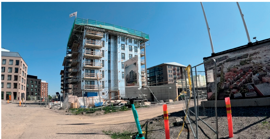
Photo 1. A significant portion of Herttuankulma was still under construction in 2023. Screenshot from recording.

more positive (TYKL/aud/1897) or at least optimistic towards completing the area (TYKL/aud/1889).