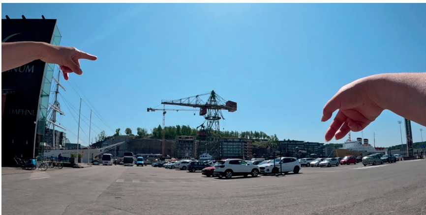
Photo 3. In the camera's wide-angle view, objects further away appear smaller than they are in reality, while the asphalt field in the foreground is emphasized. Screenshot from recording.