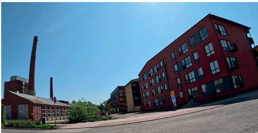
Photo 2. In general, the interviewees appreciated views that conveyed a sense of different time layers. Screenshot from recording.

When we stop at the street corner of Kalastajankatu 13 and Amiraalis-tonkatu 14 , Ines notes the old electricity plant, which she considers beautiful. “It’s a shame that nowadays industrial buildings are not made pretty”. Many other interviewees also admired the old red-brick chimney, which rises above the new buildings, and stop during their walks to acknowledge its presence and importance as a physical reminder of the district’s past. The interviews clearly show that sensing the past produces positive feelings and well-being. However, this only applies to elements of the past that are perceived as aesthetically pleasing.