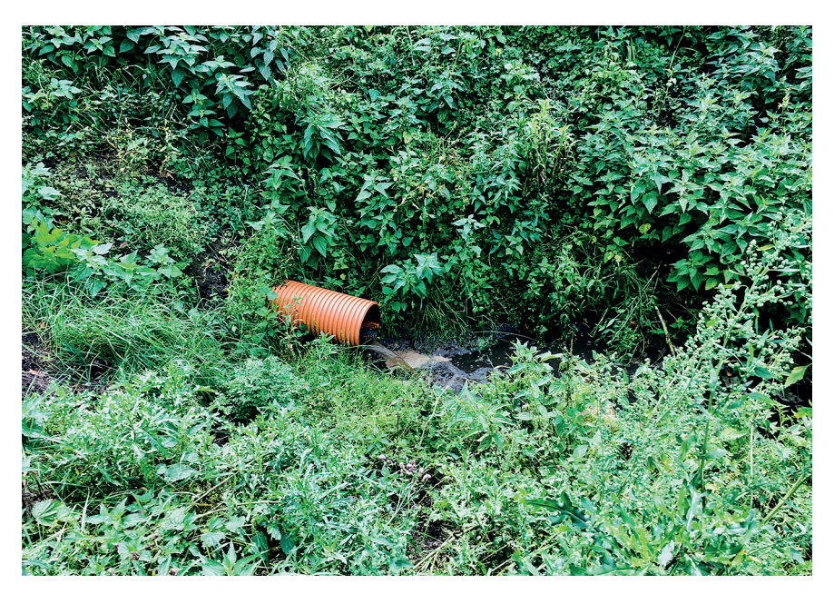
Figure 3. Author. September 2, 2019. Parowa in Southern Kashubia (Poland). Drain of the Sewage Plant at Parowa .

there are many kinds of truths, and consequently there is no "truth". However, the more mouths, different mouths that we can use to articulate a thing, the more complete will our "concept" of this thing, "our" objectivity, be (see Nietzsche 1967, 291; 2000, 555).