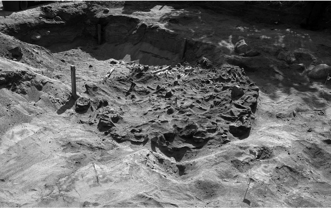
Fig. 2. The Bone pit contained well preserved human bones.

diameter of which was 1.9 meters (Fig. 2). More than 70 individual burials were documented and about 65 were archaeologically excavated (Fig. 3).