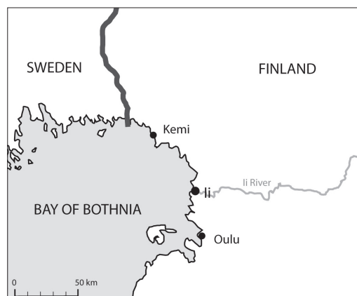
Fig. 1. The location of Ii Hamina in the Bay of Bothnia.

A six-week long archaeological excavation was carried out in the intersection of Yläkatu and Alakatu streets in the center of Ii Hamina. The excavations revealed a substantial amount of human remains consisting of in situ burials as well as disarticulated bones representing several comingled individuals from a “Bone pit”, the