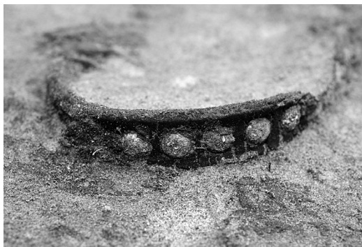
Fig. 3. Bronze studded leather belt in the grave H7.

southern edge of the mound were N-S -oriented (Tuderus 1886a), and this feature may well be one of those graves.