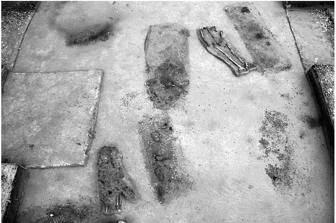
Fig. 2. Graves H8, H7, H2, H1, H3 and H9 seen from east.

Grave 4 (H4) was found quite near to the surface on the western side of graves 1 and 2. The rectangular feature measured ca. 200 x 80 cm with its longitudinal axis oriented from north to south. No bones or artefacts were found in the feature, which was full of small pits filled with dark mould. These indicate that the grave had been totally destroyed by shovelling. According to Major Tuderus (1886a), most graves on the