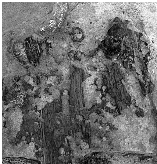
Fig. 6. The bronze jewellery in the grave H11 was covered by a layer of wood (a coffin lid?). Photo taken from east.

According to Major Tuderus, the top of the one-metre-high mound had already been cleared from grass and topsoil before the year 1886 (Tuderus 1886a). This may offer a partial explanation for the area void of graves in the general map of 1886. Furthermore, by paying attention to details in Major Tuderus's letter to professor J.R. Aspelin, the graves 34–42 (1886)