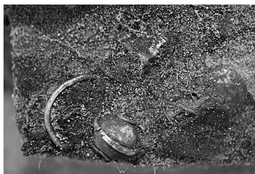
Fig. 4. Silver objects found adjacent to a child's skull in the grave H7.

The pebble had been placed on top of the child's right shoulder and the whetstone fragment between the legs. Both knives were on the right hand side: one placed next to the feet, but the other nearer to the waist with a fire steel placed next to it. The fragmented fire steel, on the other hand, was found together with a piece of flint in the south-western corner of the grave. The palmette pendants were both found between the legs. Normally palmette pendants hang from cruciform band-plaited chain holders, which are often considered as Eastern Finnish or Savo-Karelian feature (Lehtosalo 1966: 82; Uino 1997: 167). The pendants belong to the same type as the pendants found in grave 37 in 1886 (Heikel 1889: Fig. 65). No exact parallel for the belt has been found. A silver temple ring or ear ring consisting of a plain round ring and a silver bead, and two small silver objects were found next to the child's left ear (Fig. 4). Exact parallels for these objects are also unknown. Furthermore, a small piece of hack silver, possibly cut from a round silver brooch, was found in the child's left eye socket. It is worth remembering that in grave 3 of the Mikkeli Visulahti, an inhumation cemetery located a few kilometres northeast of Tuukkala, a silver bracteate (KM 13441: 17) was