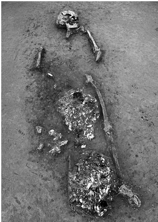
Fig. 5. Double burial with inhumation H3 and cremation H10 seen from east.

Grave 9 (H9) has been interpreted as a previously destroyed grave. Some remains of wood and few bones were detected in a feature