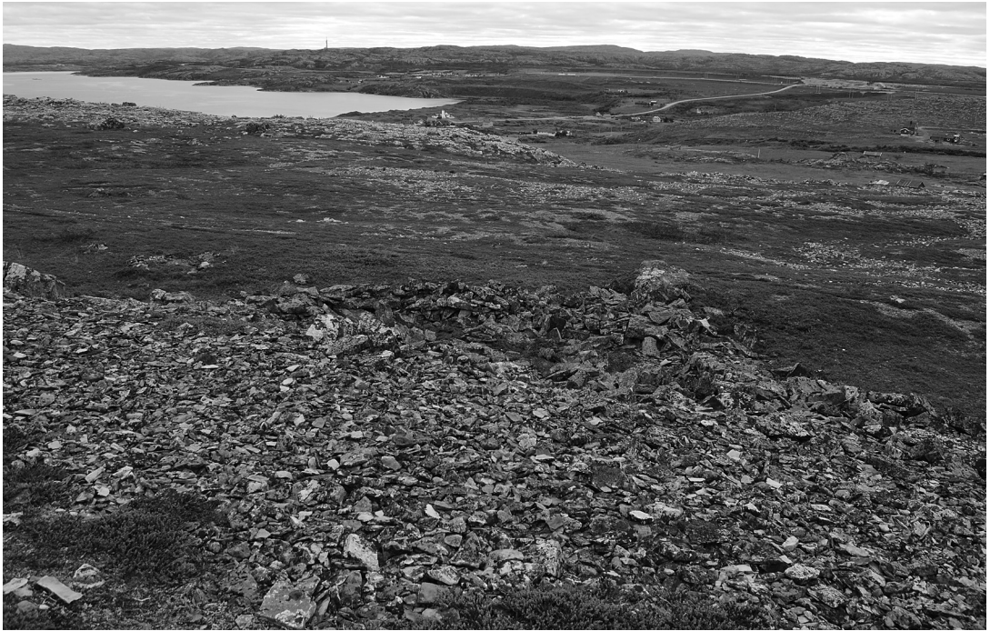
Fig. 5. Altered circular offering site in Karlebotn at the bottom of the scree, and the village in the background.

of Karlebotn (Fig. 5). It had, he says, been partly destroyed because stones had been taken from it to be used as building materials. Although it is not stated explicitly, it seems likely that the stones were taken by the local Sámi living in Karlebotn, as the area at large is quite rocky with many screes and there is no obvious reason for anyone else to go here to get building materials. Again, it seems to indicate a less respectful attitude than would have been expected had it been known as an old offering site among the locals.