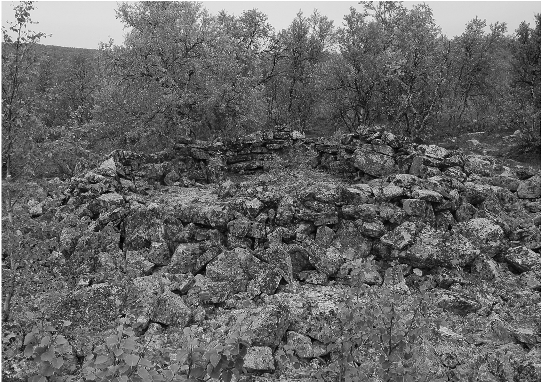
Fig. 1. Sámi circular offering site by Geaimmejávri, Karasjok, Finnmark.