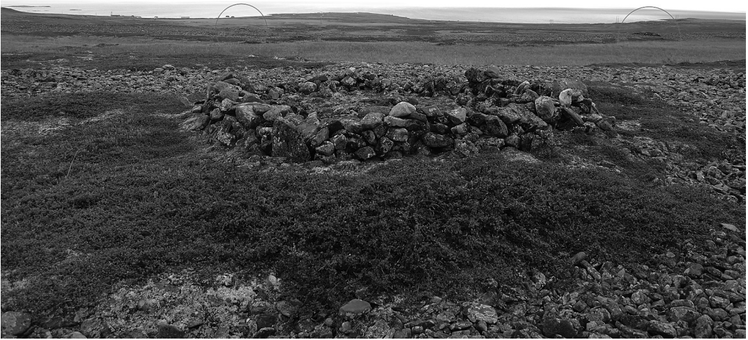
Fig. 4. View from one circular offering site to two others in Kramvik, Vardø, Finnmark.

about the Sámi's own destruction of offering sites, performed both by converted Christians and those maintaining the indigenous religion. The latter group could destroy and abandon offering stones and sites when unsatisfied with the effects of the sacrifices (cf. Rydving 1995: 66). Still, that this kind of destruction should have affected all of the circular offering sites in the vast geographical area where they are to be found would be a rather astounding coincidence.