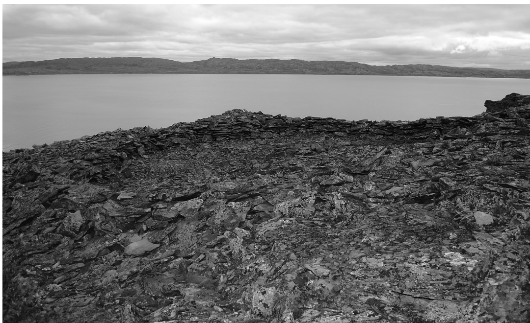
Fig. 3. Sámi circular offering site at Čiesti/Fugleberget, Nesseby, Finnmark.

There is a range of reasons for re-evaluating the interpretation of Sámi circular offering sites. Firstly, if these stone structures are to be understood as offering sites, they represent something quite