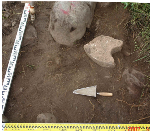
Fig. 4. Fragment of the Kylälahti limestone cross in situ.