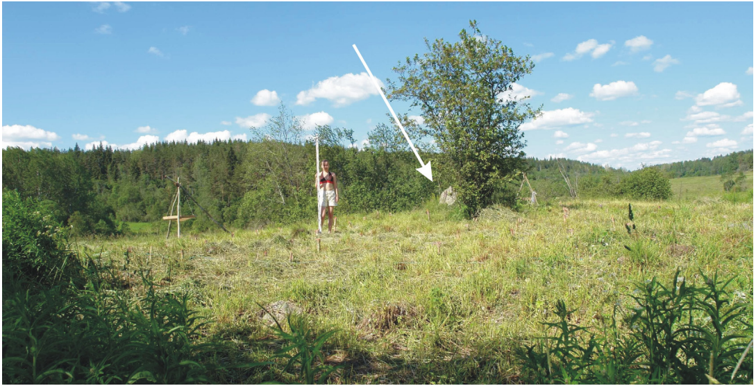
Fig. 2. Possible place where the Kylälahti limestone cross was installed (shown by arrow).

accompanying grave goods dating back to the 13 th –15 th centuries. It can be assumed that this place was the cemetery of the Kylälahti po-gost (parish) – the centre of the administrative district during the corresponding period. One of the most significant finds was the discovery of a fragmentary four-point stone cross carved from single limestone block and, undoubtedly, associated with the necropolis complex.