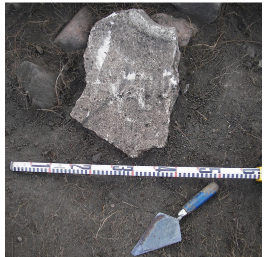
Fig. 3. Fragment of the Kylälahti limestone cross in situ.

The reconstructed height of the cross is 0.7 m, and the diameter of the circle is also 0.7 m (Fig. 5). The smallest width of the horizontal arm is 0.19 m, the smallest width of the upper arm is 0.21 m and the largest is 0.42 m. The thickness of the object decreases from the ends to the cen-