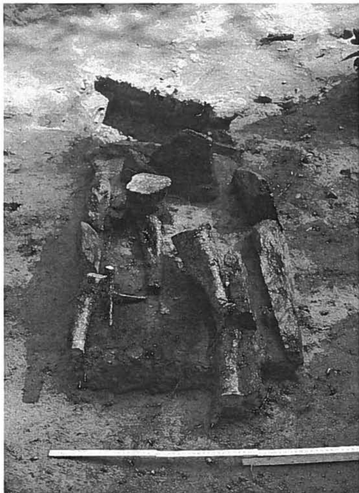
Fig. 2. The rectangular stone box-furnace after excavation.

the anomaly maps of a magnetic resistivity survey. Two of the most conspicuous anomalies proved to belong to the remains of a constructions built for iron smelting (Lavento 1996b).