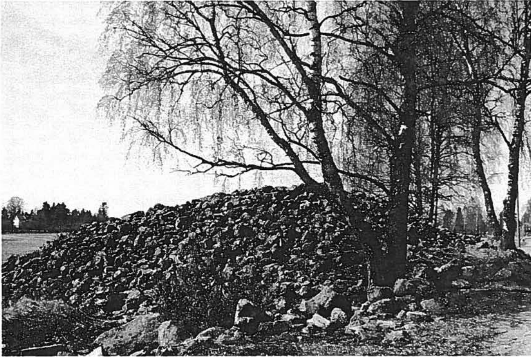
Fig. 2. Panelia, Kuninkaanhauta (the King's Grave).

survey and inspection reports began in the late 19 th century.