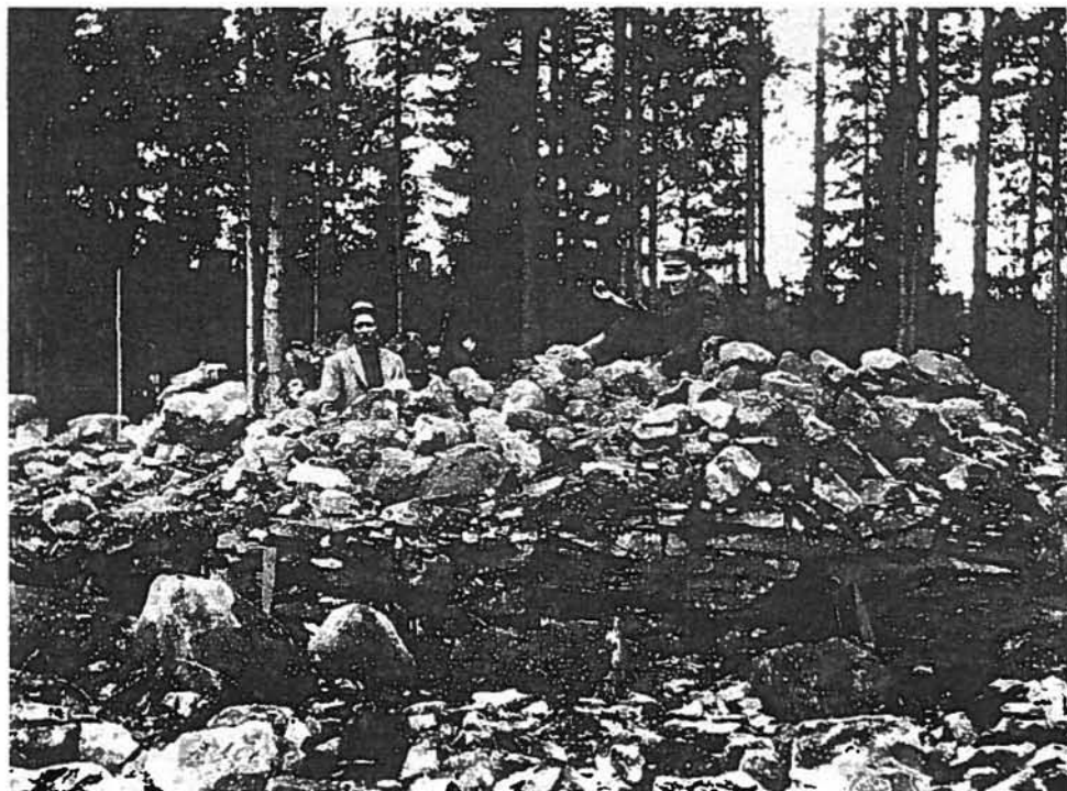
Fig. 3. The cairn of Panelia, Junnila, in course of excavation, 1924 (Roiha 1983: 48).