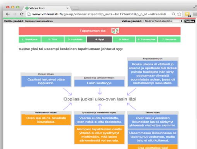
Figure 2. Screenshot for cause and risk analysis of the Green Cross tool.

When an incident has occurred and is reported, the units change color according to the classification of the incident. The color will turn red if the reported case is an actualized event such as an injury or accident, or alternatively yellow in a near miss case. This color-symbolized visual form provides a picture of the safety situation in one glimpse (Fig. 1).