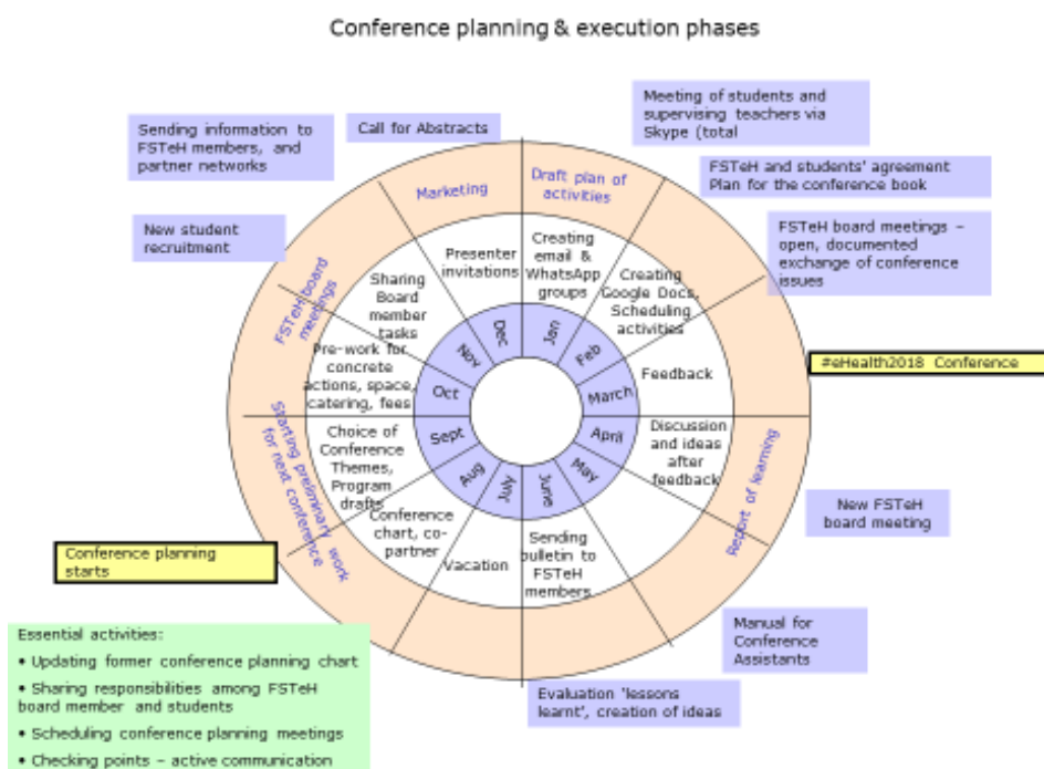
Figure 1. Conference planning and execution phases.

taken into account when planning conference programme. In order to organize well-working conference it is based on effective and active multimodal communication throughout the process of conference-project.