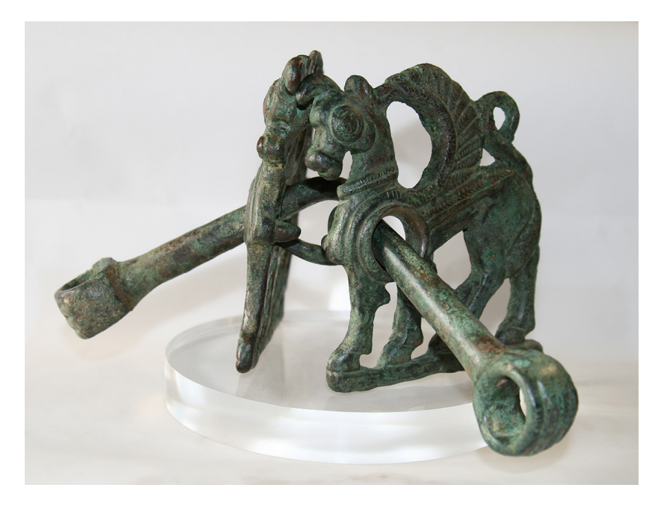
Figure 3. A Luristan bronze horse bit (539) in the National Museum of Iran.

In 1935 and 1936, Hungarian-British archaeologist Aurel Stein began searching for the bronzes. He surveyed Western Iran and the Lorestan region with a grant from the British Museum and Harvard University. Stein's accounts show that he realised how the investigations would further compound the looting of the sites. He even mentions that the sites should wait for systematic excavations, but it did not prevent him from executing hasty