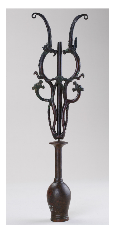
Figure 2. A Luristan bronze finial (538) in the National Museum of Iran.

The article gives an idea of the high value he attributed to these objects.