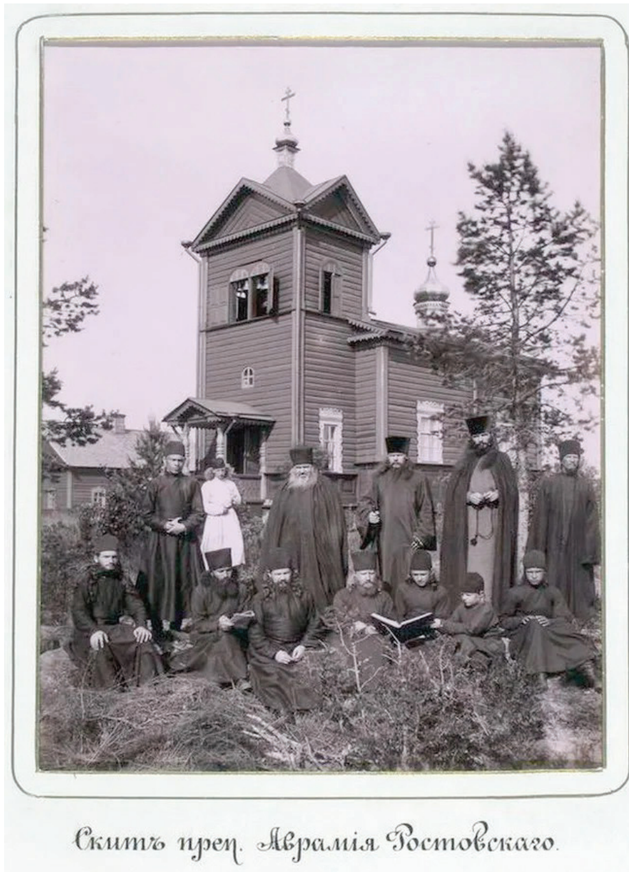
Illustration 2. The skete of St Abraham of Rostov, Valaam Monastery. 1900.

It is however very likely that the situation in the main church was different. Solovyov notes that as many as fifty singers would come together for services there 34 , a statistic that is confirmed by Metropolitan Benjamin (Fedchenkov) a decade and a half later. The composition of the choir into several voices/parts would have allowed monophony at the octave, in two or three octaves depending on the range of the singers, and also certain types of polyphony: both harmonized in the Western style, but also of a different nature. Here again we must turn to Solovyov who writes: