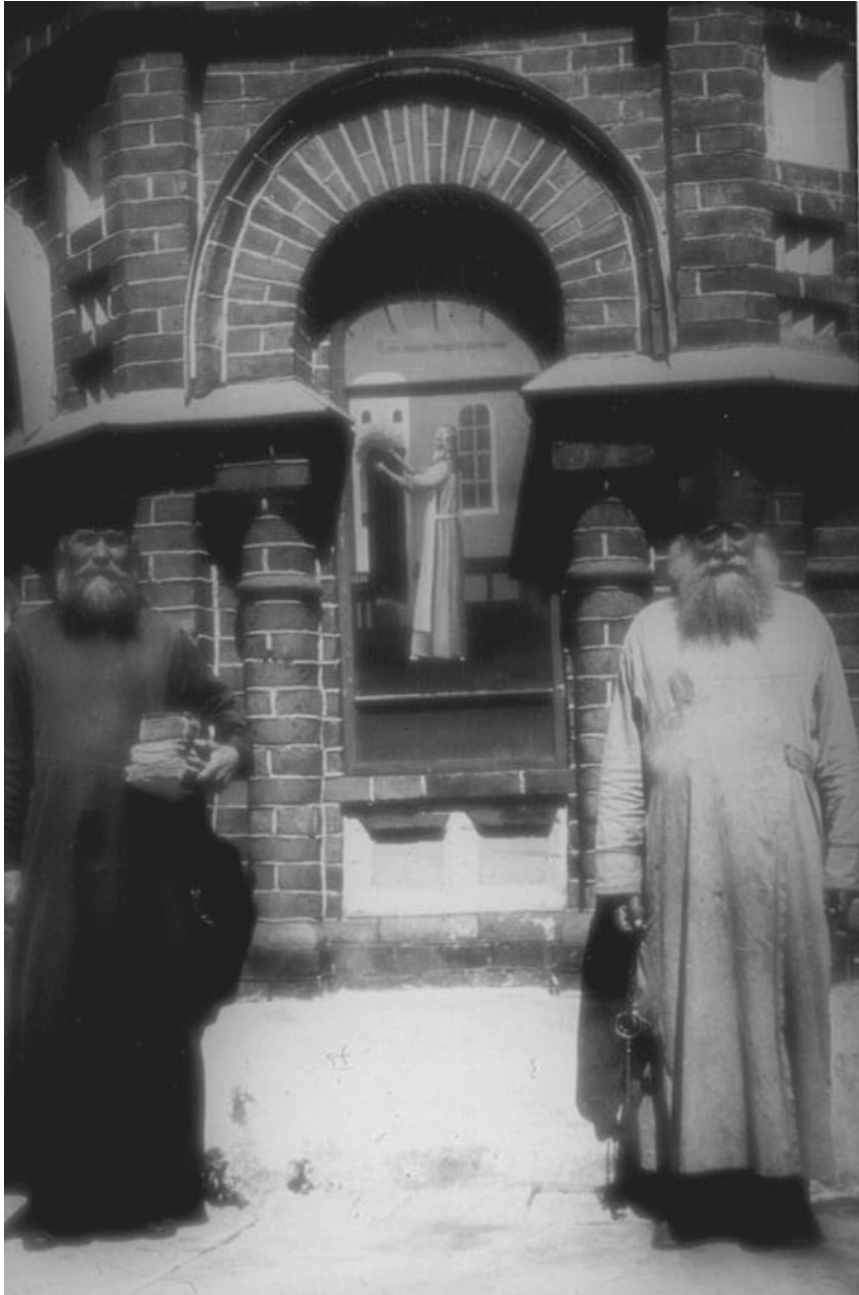
Illustration 3. Pskovo-Pechersky Monastery. 1936.

acquired a special spiritual meaning in the eyes of Russian emigrants. The singing of the monks of the Pskovo-Pechersky Monastery was not as famous as that of their counterparts of the Valaam Monastery. Nevertheless, old manuscripts, the study of which became the purpose of Swan's trip there, were kept in the monastery's archives.