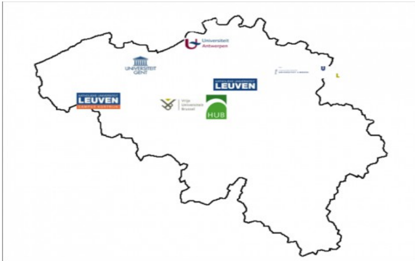
Kaavio 1: The location of the HUB, KU Leuven, KULAK, tUL, UA, UGent and VUB.

The student associations were in general very disappointed about the whole Bologna reform because of the strong dominance of the economic aspect. And according to them, also the debate about the rationalization was determined only by economic motives, without really taking into account possible scientific arguments. The diversity in the university landscape did not lead to fragmentation and useless competition, the Flemish Union of Students asserted, but on the contrary to an interesting confrontation of ideas which stimulated the creativity of mental processes and in that way advanced the quality of education and research (De Rocker).