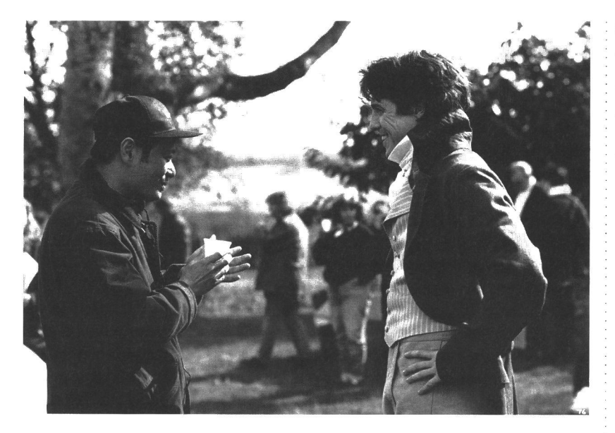
Sense and Sensibility: A canonical text of Englishness directed by the Taiwanese Ang Lee (left).