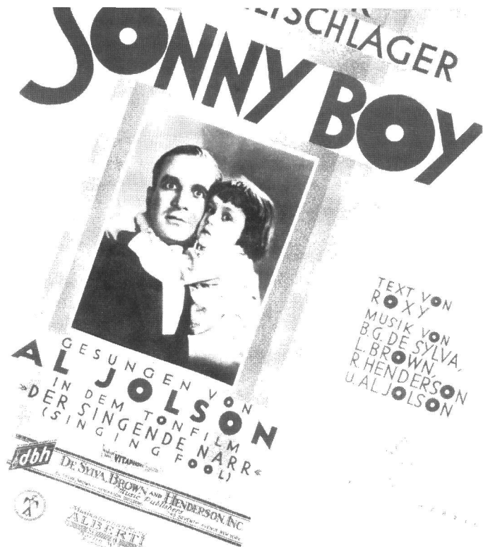
The first foreign sound films to be shown in Europe were American. A German advertisement for The Singing Fool

next!" (We get to read it in an intertitle but not hear him). Then we see a cut to the last intertitle "The end of the trail," a cut to a horse and the film ends.