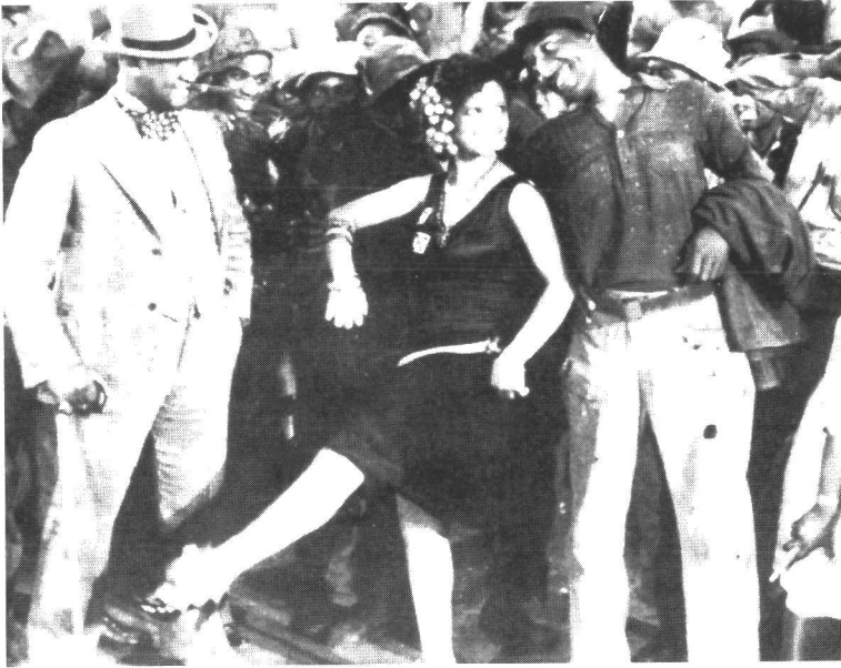
King Vidor, Hallelujah