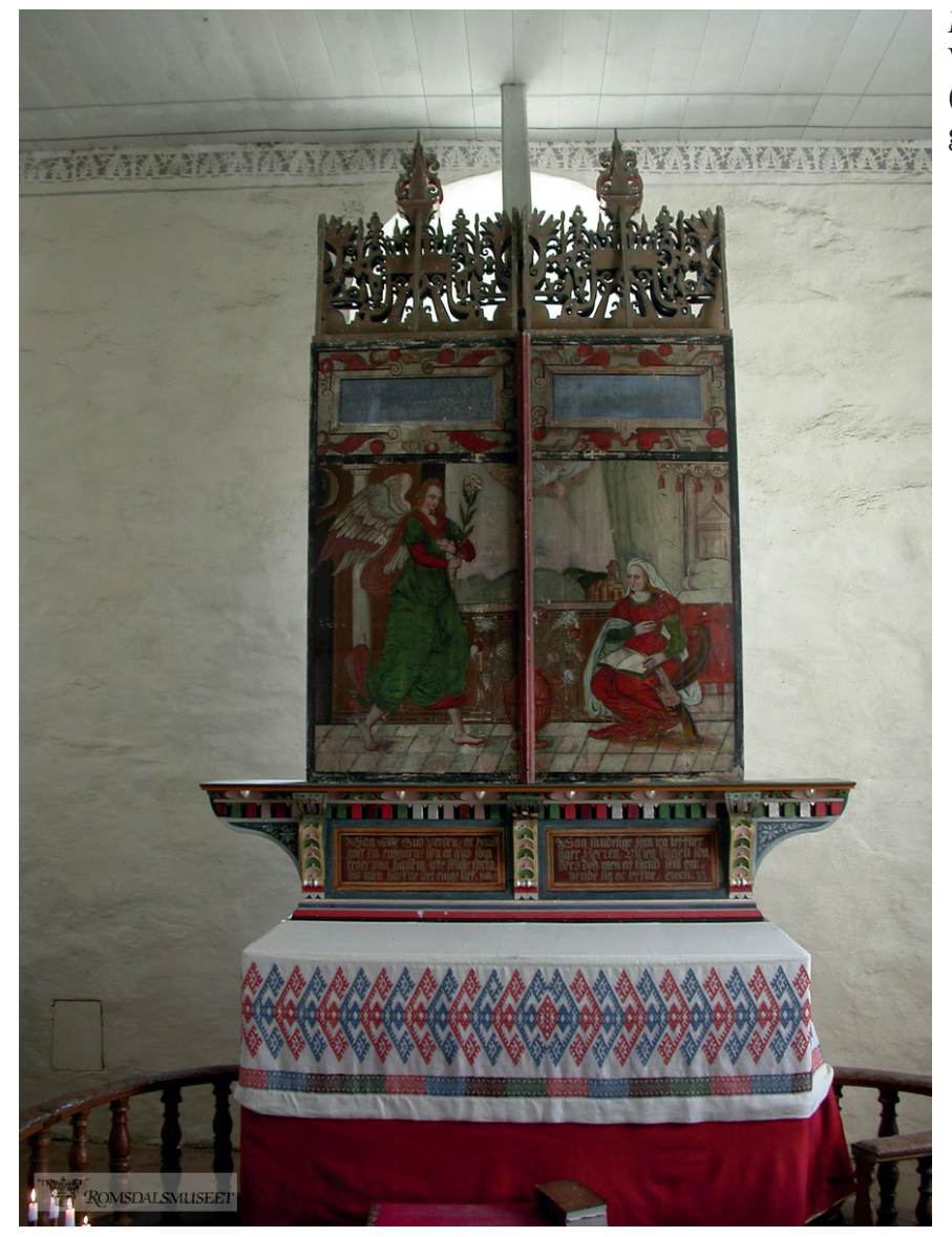
Figure 3: Altarpiece from Veøy church, Norway (1625).

found in a number of late medieval altarpieces. As the fest day of the Annunciation, 25 March, falls in Lent, having the story represented on the outer wings of the altarpiece meant that it would be accessible for display when the altarpiece itself was closed.<sup>44</sup> Having the story painted on the outer wings in Veøy almost a century after the Reformation was established testifies to a continuity of the visual culture of the past, a visual analogy. This can also be understood as a mode of propinquity, a mode in which