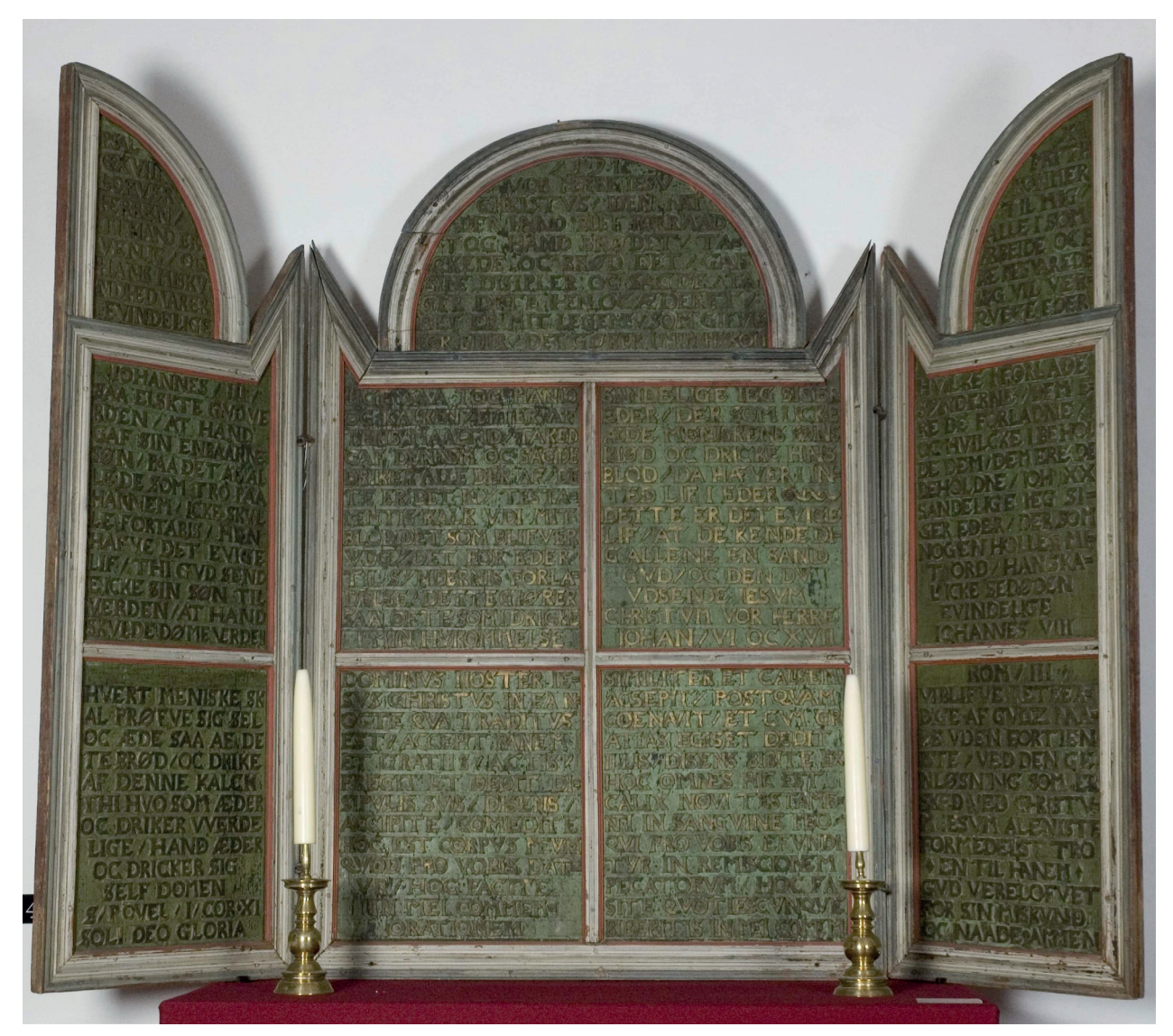
Figure 2: Altarpiece from Biskoprsrud/ Nykirke church, Norway (1591).

is a similar altarpiece in Heggen (1595), the two altarpieces suggest that churches with ties to the crown were more prone to new visualities than churches with a different jurisdiction.<sup>41</sup> Apart from the even earlier altarpiece in Gaupne (1589), similar altarpieces in churches with no direct ties to the crown date to the seventeenth century.<sup>42</sup> The altarpiece in Veøy church (1625) is puzzling. Veøy church is a medieval church, dated to the thirteenth century and the altarpiece probably substituted an older one. What the earlier showed is not known. The new altarpiece is formed of a corpus and movable wings. The corpus and the inside of the wings are composed of sentences from the Small Catechism , while the outer side of the wings contain a painted representation of the Annunciation [Fig. 3].<sup>43</sup> Depictions of the Annunciation feature in northern medieval churches at least from the thirteenth century as one of the scenes recounting the birth of Christ on altar frontals. It is also