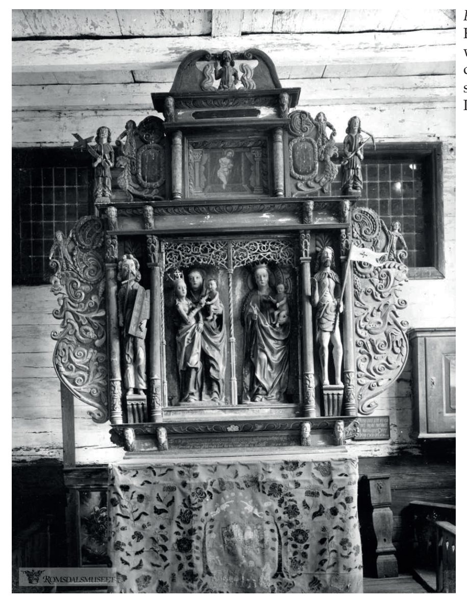
Figure 5: Altarpiece from Kvernes stavechurch, Norway (mid-17th century incorporating late medieval statues. Photo: O. Værnes, Romsdalsmuseet.

There are different endings for the ballad as well, but even if their wording is not exactly identical, the moral of the ballad is always that the Virgin Mary appears and that any young girl should conduct herself with humility, as Tora did.