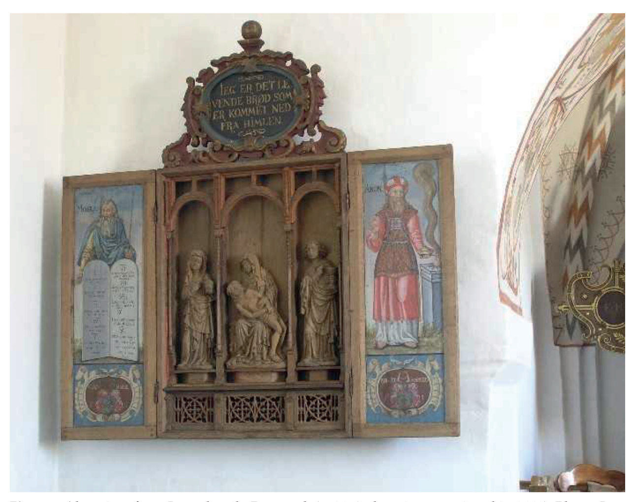
Figure 4 : Altarpiece from Lem church, Denmark (c. 1450, the wings repainted in 1661).

I would add 'narrative convention' to this list of visual optical qualities. Even if updated to a sixteenth-century interior, the motif of the Annunciation is structured as one where the Virgin Mary is seated in a domestic space or a studiolo and is reading while the archangel Gabriel appears. This narrative convention of the Annunciation was ever-present in the Middle Ages, and to that degree the Veøy altarpiece accentuates a kinship with earlier altarpieces even if the motif was not present on the former altarpiece in Veøy church itself. The haloes are gone, but the flowers symbolising the purity and love of the Virgin are preserved. The choice of motif also facilitates the bringing together of the apparently 'irreconcilable elements' of the Catholic Mass and the Lutheran service.