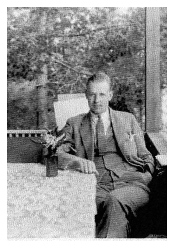
Fig. 2. Ilmari Hildén (1899–1963).

faunistic interest, but it did not lead, at least not immediately, to any notable discussion in the scientific literature either within or outside of Finland.