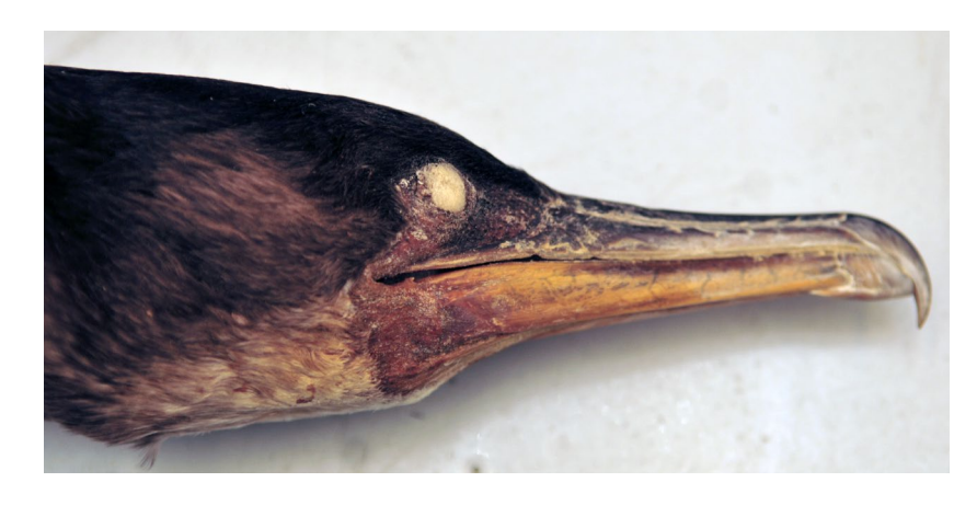
Fig. 4. Cormorant; avian specimen No. 9799 in the collections of the Finnish Museum of Natural History, Helsinki. This female, which most likely belongs to the subspecies sinensis , was collected at Lake Ladoga on October 23, 1928 (i.e., well after the cormorants' breeding season).

ences than has usually been presumed. In the UK, the carbo cormorants that nest in inland colonies together with sinensis cormorants have adapted the latters' breeding habits and frequently nest in trees (Sellers 1993, Ekins 1997, Sellers et al. 1997, Carss & Ekins 2002, Newson et al. 2006, 2007). On the other hand, in the Baltic Sea region, sinensis cormorants nowadays often nest on treeless rocky islands in a marine/brackish habitat (Lehikoinen 2006).