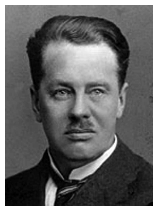
Fig. 1. Rolf Palmgren (1880–1944).