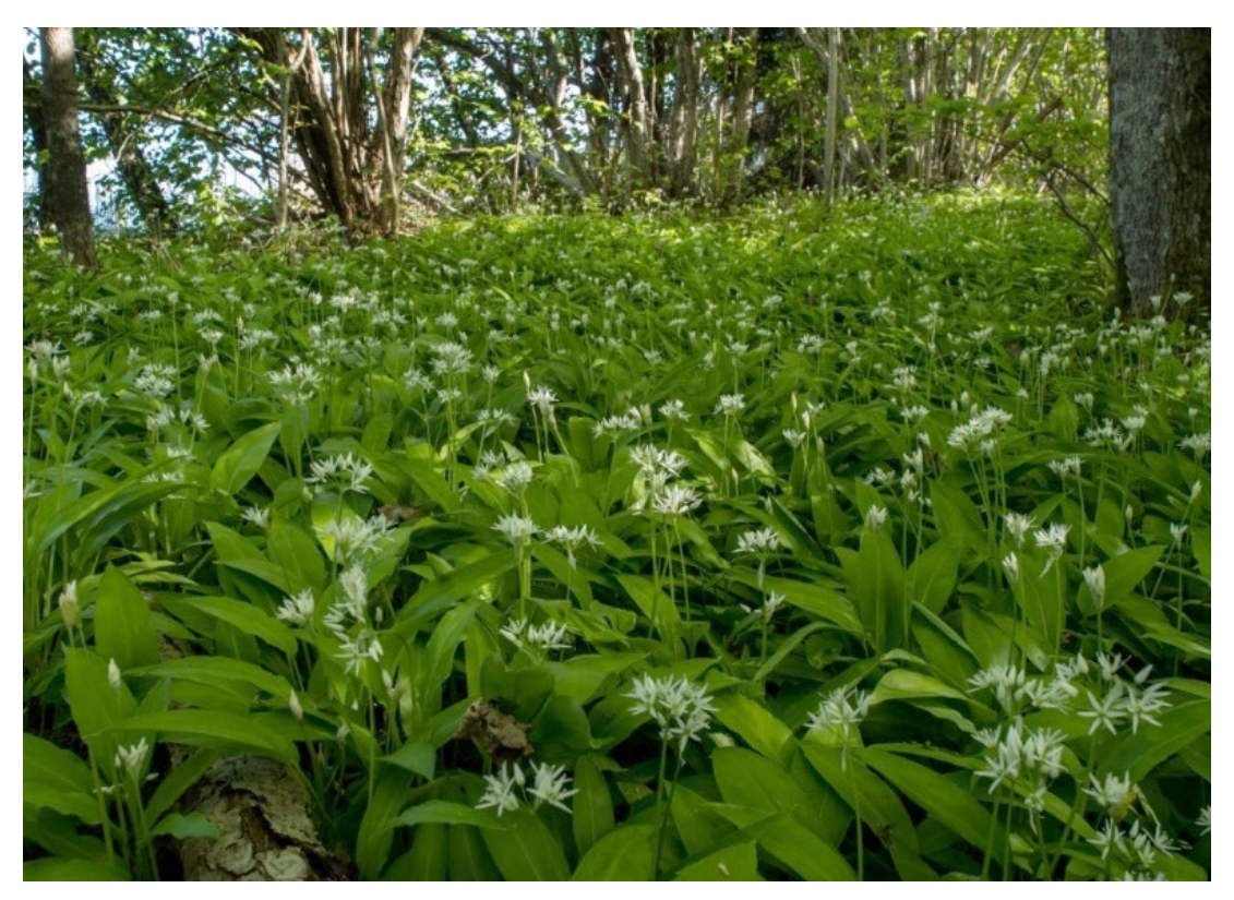
Fig. 8. A dense stand of Allium ursinum on Ab, Pargas (former municipality of Houtskär), Björkö, Sundholmen. Photo: Mikael von Numers, June 5, 2015.

er with Dactylorhiza sambucina and Dryopteris filix-mas (UCS 66964:31815), Pekka Rautiainen 98-031 & Kimmo Syrjänen, June 9, 1998 (TUR).