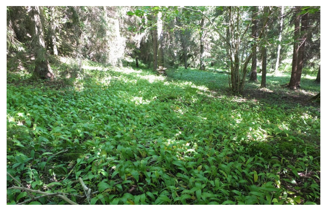
Fig. 5. The gentle slope towards the east in Hammarland Strömma, with the stand of Allium ursinum . Norway spruces ( Picea abies ) are abundant on the slope. A shrub of Corylus avellana is seen to the right. July 25, 2015.

Lake Lerviksfjärden. This could be the same locality where Högnäs found it a few years earlier. The author RC saw A. ursinum between the road to Skarpnåtö and the lake on June 11, 1983. The authors CAH and EH could not find it at the shores of Lake Lerviksfjärden in 2015 or 2016.