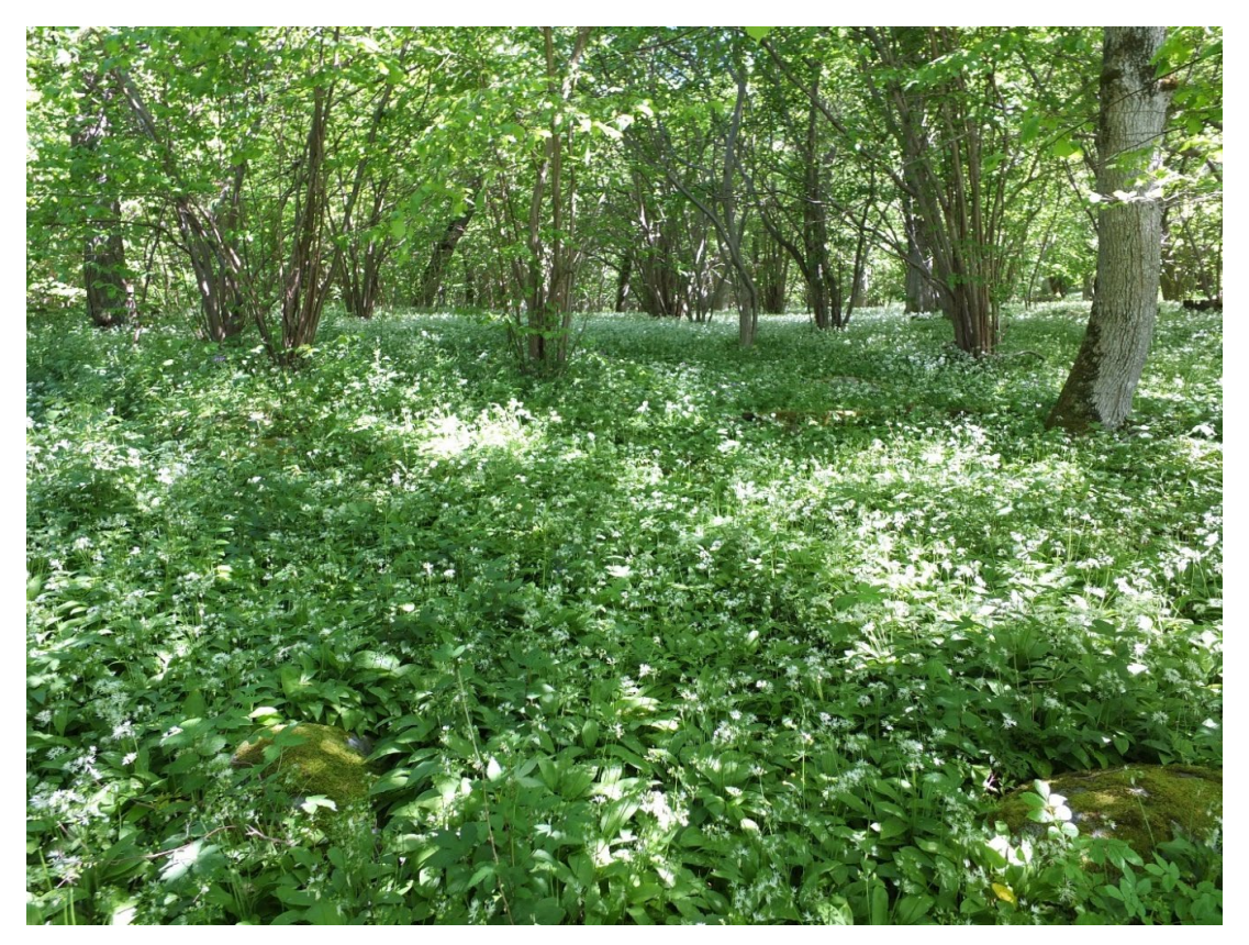
Fig. 2. Large and dense stands of Allium ursinum among hazel shrubs and deciduous trees, mainly Fraxinus excelsior and Ulmus glabra , in the Ramsholmen Nature Reserve, June 16, 2015.

ta and Orchis mascula. Two stands of Fritillaria meleagris originate from plantings in 1929–1941 (Palmgren 1943–44). Later in the summer many herbs, grasses and a few sedges typical of lush deciduous woods grow together with A. ursinum (Table 1).