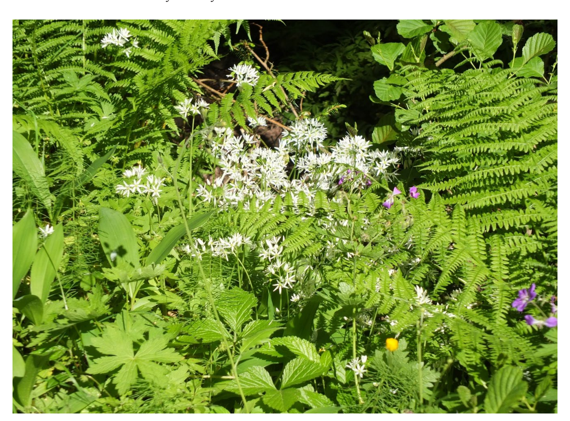
Fig. 6. A small stand of Allium ursinum at the road Söderdalsvägen in Saltvik Åsgårda. Accompanying species are, e.g. Convallaria majalis, Dryopteris filix-mas, Equisetum pratense, Geranium sylvaticum and Rubus saxatilis . June 15, 2015.

Allium ursinum occurs in Mariehamn as a cultivated plant. It was probably brought from Ramsholmen in the 1930s by Leo Björkman to the meadow area Tullarns äng where it initially occurred immediately north of the reconstructed stone labyrinth (Swedish: jungfrudansen) (Fig. 1, no. 14).