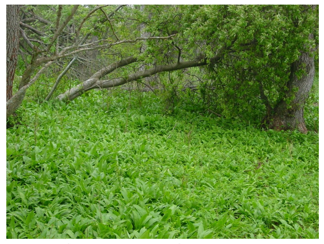
Fig. 4. A dense stand of Allium ursinum on the northern shore of Brunnskär in Kökar, Karlby. The trees are Alnus glutinosa, Fraxinus excelsior and Prunus padus . May 28, 2007.

The name Bergskär is probably mistaken for Brunnskär, because several collectors from Turku were in Brunnskär that day. There are two islands with the name of Bergskär in Kökar, one in Hellsö, which seems to be too barren for A. ursinum and the other in Österbygge. The UCS coordinates with one km accuracy were later added by somebody in the herbarium TUR. These coordinates suite for Tärnskär and Bässkär, two very barren rocky islands without any lush wood located about 3.5 km NNW of Idö.