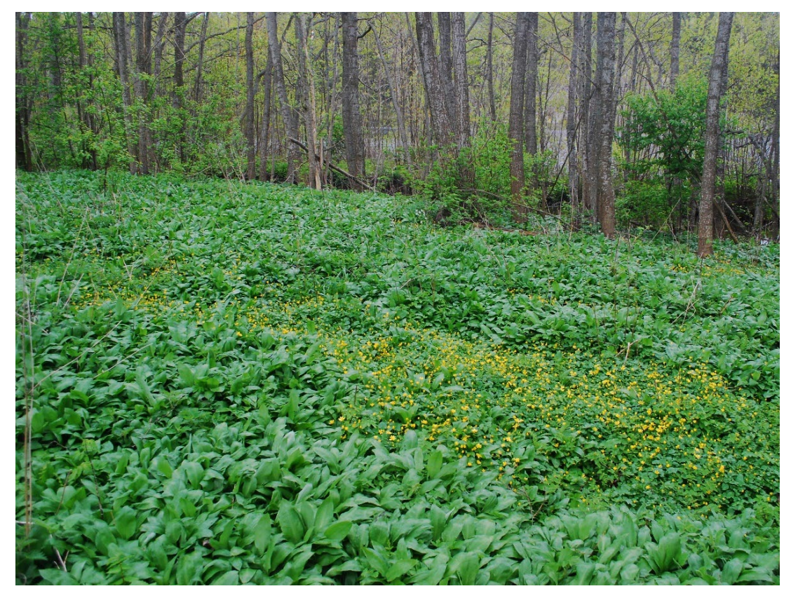
Fig. 3. A dense carpet of Allium ursinum with a flowering stand of Ranunculus ficaria in the mid part grows between the vicarage of Jomala and the small lake Prästträsket, dimly seen behind the dense stand of Alnus glutinosa . A few shrubby Prunus padus grow among the alders. May 17, 2015.

66943:31110) by the authors CAH and EH on October 16, 2014 (Fig. 1, no. 5). The owners of Bertilas told that A. ursinum had appeared spontaneously in the garden. However, an unintentional introduction with garden plants or soil is most probable.