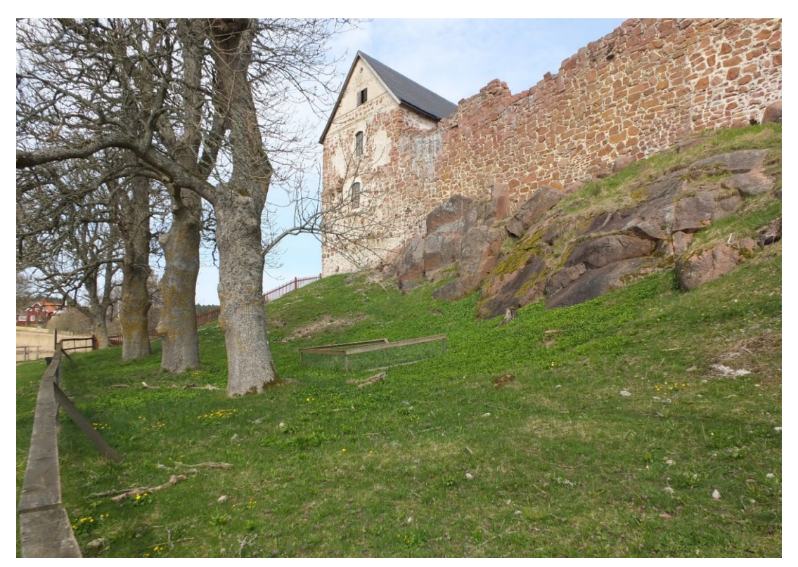
Fig. 7. The Allium ursinum stand located west of the mediaeval castle ruin of Kastelholm. The stand extends from the rock outcrop to the fence. The small enclosure is to the right of the nearest ash ( Fraxinus excelsior ) tree. The three large ashes are approx. 170–180 years old. June 2, 2015.

The authors CAH and EH found a stand of Allium ursinum on the W side of the mediaeval castle ruin of Kastelholm (UCS 670025–670028:311722–311724; cf. Hæggström & Hæggström 1980, Hæggström et al. 1982) (Fig. 1, no. 20). The most surprising about this find was that the castle ruin of Kastelholm has been frequently visited by botanists during the previous one hundred years. The stand of A. ursinum was about 10 m² large next to the rock outcrop upon which the castle was built.