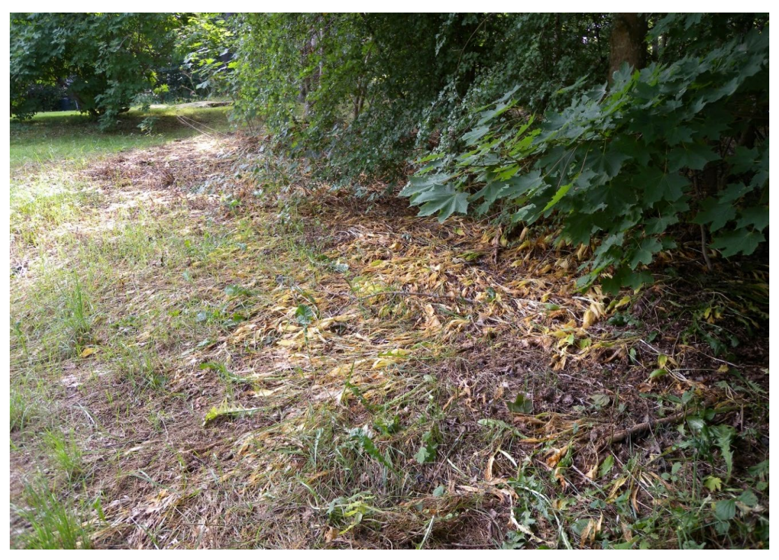
Fig. 9. A dense carpet of wilting leaves of Allium ursinum covers the ground in the so-called Vallgrensgården locality in Mariehamn. Such a mat can inhibit other species from growing, perhaps through allelochemical inhibition. Åland Islands, Mariehamn, July 24, 2016.

skär, Björkö, Nåtöholm: the pH was 6.2 in the lush species rich hazel stand (Eklund 1930).