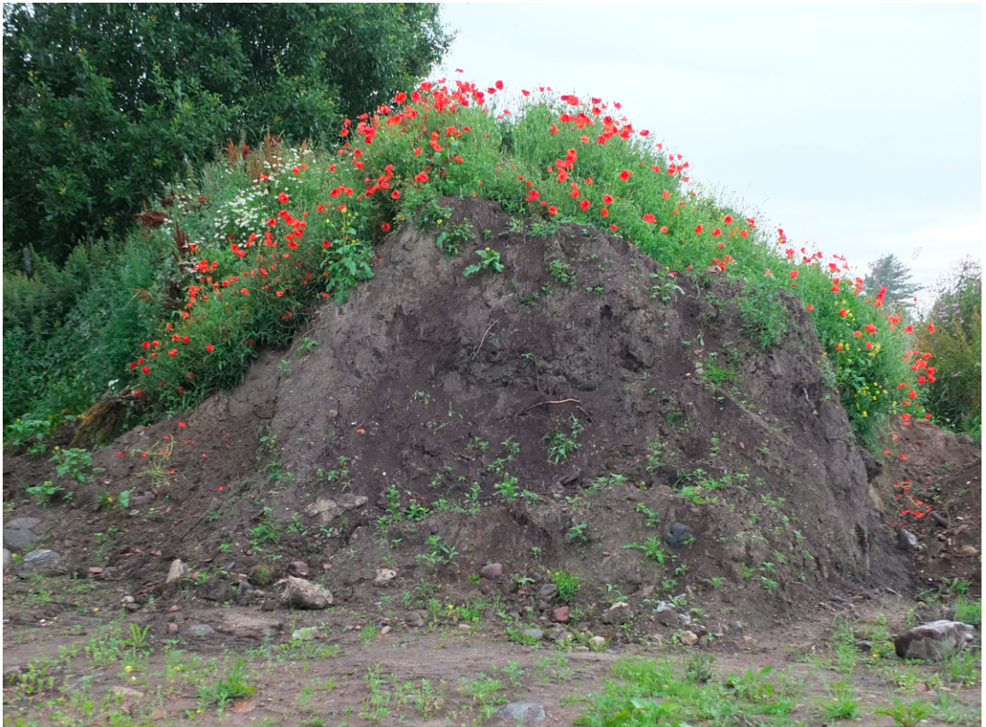
Fig. 5. Papaver rhoeas on a large soil mound and on the adjacent ruderal ground at the S edge of a cultivated field. Åland Islands, Jomala, Södersunda, July 23, 2015.

Quite a few of the observations of P. rhoeas are of garden origin, or introduced with ornamental plants. Grönholm (1991) observed it in a garden at Ytternäs in Mariehamn in 1988. Later, a few more garden finds were made: at a deserted fisherman's house in Baggholma in the municipality of Brändö in 1993; in a flowerbed at the street Kaptensgatan in Mariehamn in 2003; cultivated in a garden at Haga kungsgård in Saltvik in 2003; cultivated, together with P. somniferum and other ornamental plants on a soil bank at the main road in Granboda in Lemland in 2006–2007; in a former cultivated field, now a “flower field” with exotic plants in Norrboda in the municipality of Lumparland in 2006; cultivated in the island of Finnö in Sottunga in 2008; and together with two other garden plants, Echinops bannaticus Rochel ex. Schrad. and Helianthus annuus L., at a road bank in Sviby in Jomala in 2010.