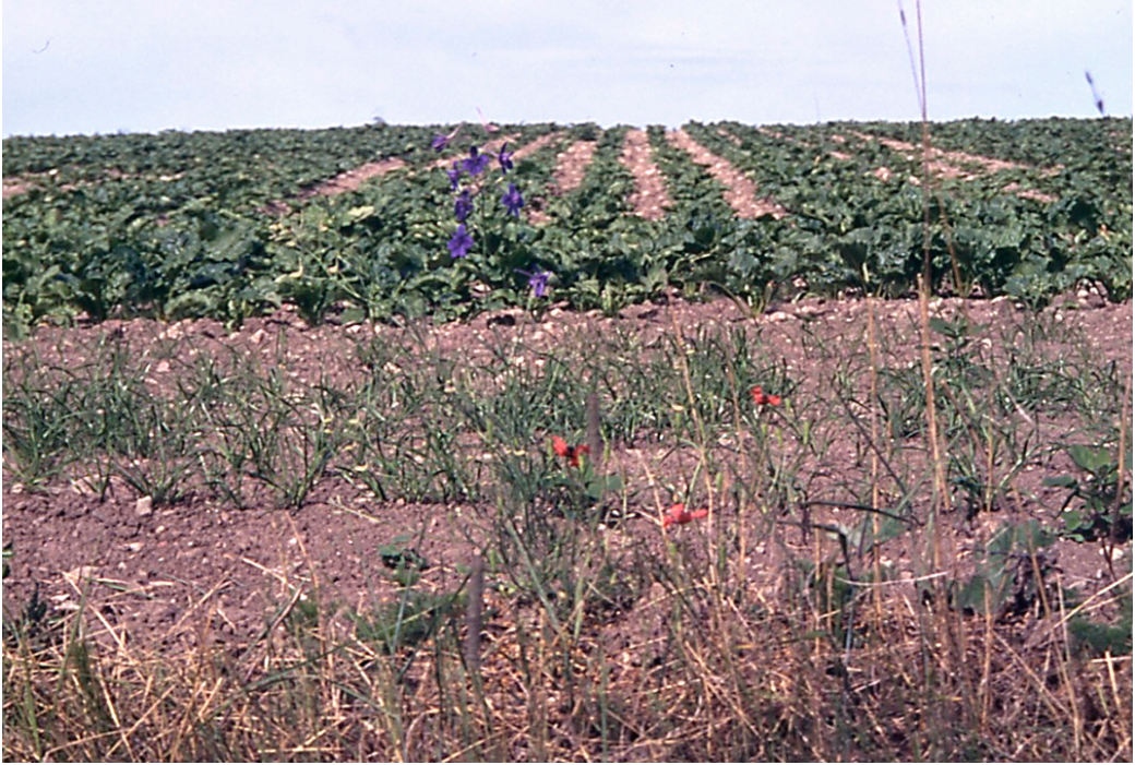
Fig. 1. Three flowerings specimens of Papaver argemone and one flowering specimen of Consolida regalis subsp. regalis f. glandulosa growing on the margin of a sugar beet field. Åland Islands, Jomala, Överby, June 24, 1992.

tiva (H, TUR). The next observation in the same field area was in 2002. P. argemone grew among wheat at the narrow field margin bordering a sugar beet field.