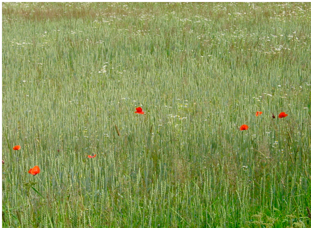
Fig. 4. Seven specimens of Papaver rhoeas in flower in a wheat field. Åland Islands, Saltvik, Haga by, July 18, 2004.

Several roadside finds of P. rhoeas are known from the 2000s. The first were in the main island of Storsottunga in the municipality of Sottunga and on the clayey road slope in Kroklund in Saltvik, both in 2002. The species grew along a road in the island of Äppelö in Hammarland in 2004.