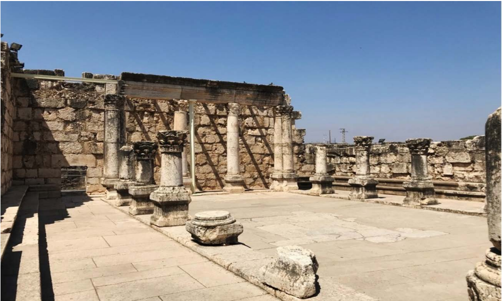
Fig. 1. Main hall of the limestone synagogue, looking NE.

Attribution 4.0 International (CC BY 4.0)