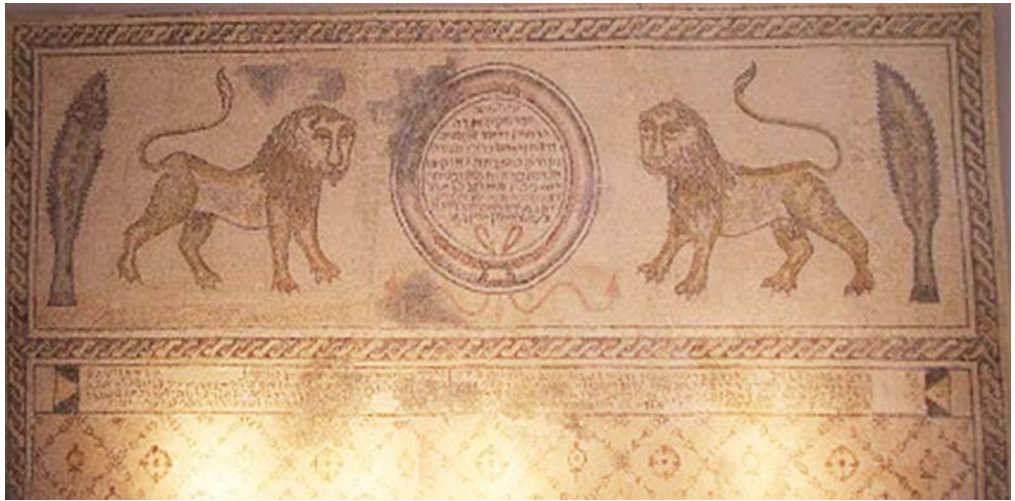
Fig. 5. Donor inscription (beneath the lion panel) on the mosaic floor of the Hamat Gader synagogue (6th century). Public use of this image is licensed under the CC BY-SA 3.0.

We are, therefore, on quite solid ground in claiming that Capernaum's Jewish population possessed a level – perhaps even a significant level – of internal wealth, which could have been directed towards the construction of the synagogue. The question, of course, is whether there was enough wealth to sustain a building project that, according to Loffreda, from start to finish lasted almost a century (Loffreda 1997: 232–3).