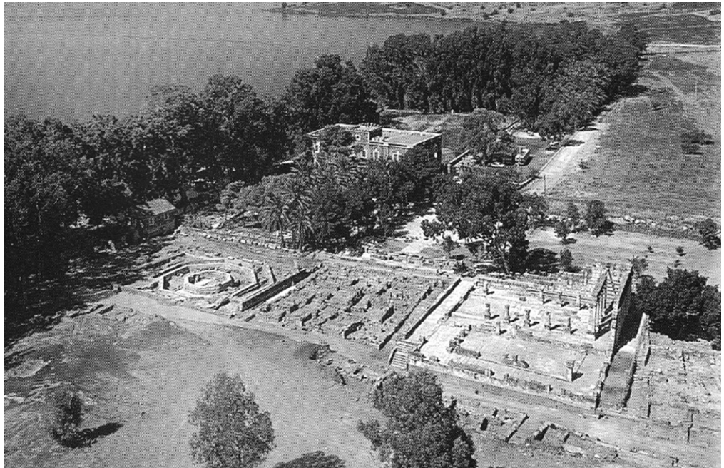
Fig. 2. Aerial photo taken in 1972 of Capernaum's octagonal church and limestone synagogue, with residential Area 2 separating them.

(361–3 CE). 9 This proposal, however, went nowhere, probably because it (oddly) conflicted with the late chronology of the building that Loffreda had published as early as 1973, which stated the excavators' combined belief that the synagogue was built in 'the last decade of the fourth to the middle of the fifth century' (Loffreda 1973: 37). In 1997, Loffreda dated the entire building to