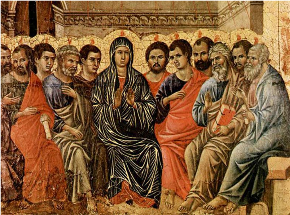
A typical Western image of the Pentecost. Duccio di Buoninsegna, 1308. Museo dell'Opera del Duomo.

identity marker for Jesus believers, uniting both Torah-observant Jews and gentiles. In a parallel of how the Torah, given at Sinai, is the primary identity marker for rabbinic Jews, the Holy Spirit, given on the day of Pentecost, becomes the identity marker, the symbol of the community of Jesus-believers in Acts.