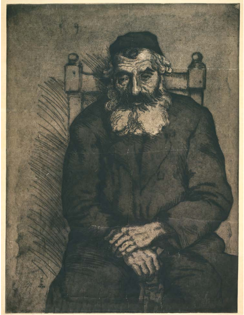
Fig. 1. Ahasver, etching by Hermann Struck (1876–1944), c.1915. Struck was a German Jewish artist famed for his etchings. This etching is very much a contrast to many of the stereotypical and antisemitic images that exist of the Wandering Jew. It is very similar to many of his other works, entitled 'Old Jew'. For more on Hermann Struck and this and similar works, see Rajner and Klein 2017.

The fact that many articles and notices are derived from the foreign press does not matter: they were still published in Swedish newspapers and read by a Swedish public, and were thus part of the Swedish cosmos. Hence, it is of value here to conceptualise the textual presence of these myths in Swedish society as sources which, in part, enabled discourses to form through the populace's engagements with the newspaper medium (cf. Frosh 2007). As such, their very presence facilitated a cosmising potential, which manifested through expressions of allosemitism. Furthermore, Sweden was not peripheral during this time when the world became more global. Neither do we focus on whether these articles reflect the opinions of single authors or