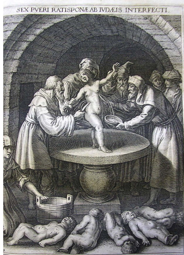
Fig. 2. Copper engraving depicting Blood Libel, Jewish ritual murder to obtain Christian sacrificial blood for religious rituals, by Raphael Sadeler II (1584–1632) in ‘Six Children Killed in Regensburg’ from Bavaria Sancta: The Life and Martyrdom of Holy Men and Women , vol. III, by Johann Matthias Kager (1575–1634) from 1627. Wikimedia Commons.

Publishing such accusations mediated an image of Jews as chaotic Others. As Bauman (1991: 15) states, modernity produces order, and thus Jews as Others were, in an allosemantic worldview, chaotic – maintaining ‘abominable’ superstitions. Kathryn McClymond suggests that Blood Libel accusations were not only justifications of antisemitism (and in some cases pogroms) but a way for the majority to define their own values (2016: 105). Blood Libel was thus used to define values that were unfit for the modern world – cosmising the