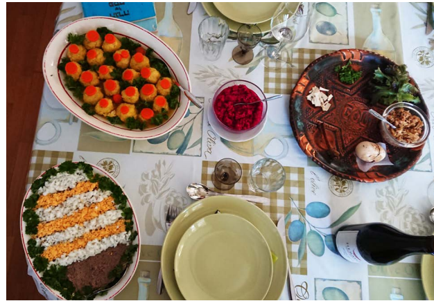
Pesach table of a Finnish Jewish family.

after all meals – if there are meat courses, then with vegetable milk. Quickly and easily preparable Finnish recipes are sought even for a Shabbat dinner and Ashkenazi meals are only consumed on holidays. Israeli meals too have made their ways to the festive table of Finnish Jews. Hummus, baba ganoush and couscous are often eaten on holidays.