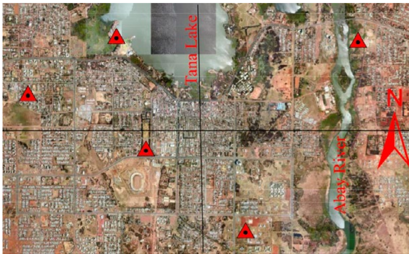
Figure 1. Checkpoint locations in Bahir Dar based on reconnaissance. The area depicted is about 4 \times 6 \text{ km}^2 in size.

Originally, we identified about sixteen points within the test area as suitable for use in this study. Eventually, of those, five points were chosen to be used with good GNSS visibility and recoverability, see Figures 1 and 2.