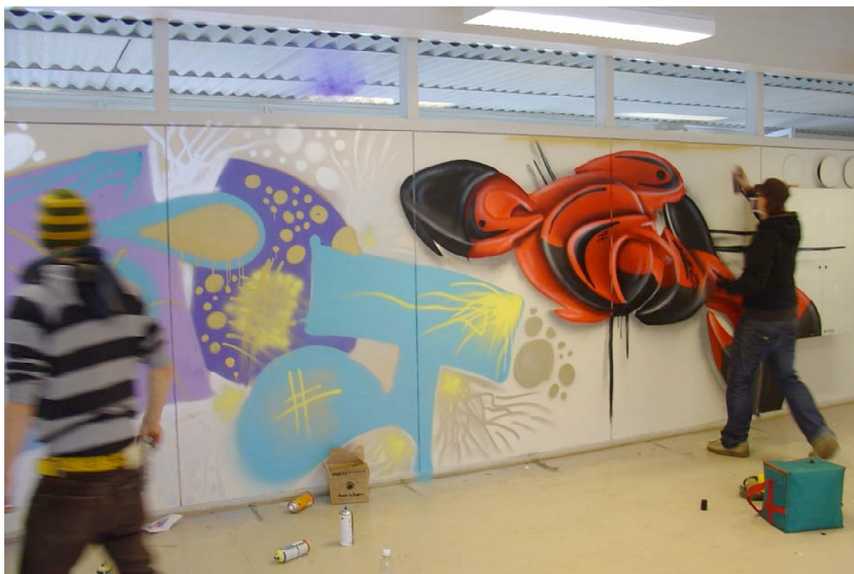
Hiphop-festival in Kaapelitehdas Spring 2008