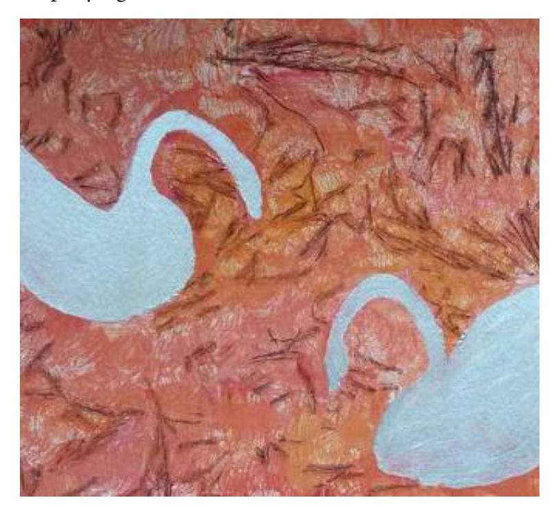
Figure 3. Swans in Flames.

for empathy. Here, in Swans in Flames (Weber, 2015), I am the second swan accompanying the first swan.