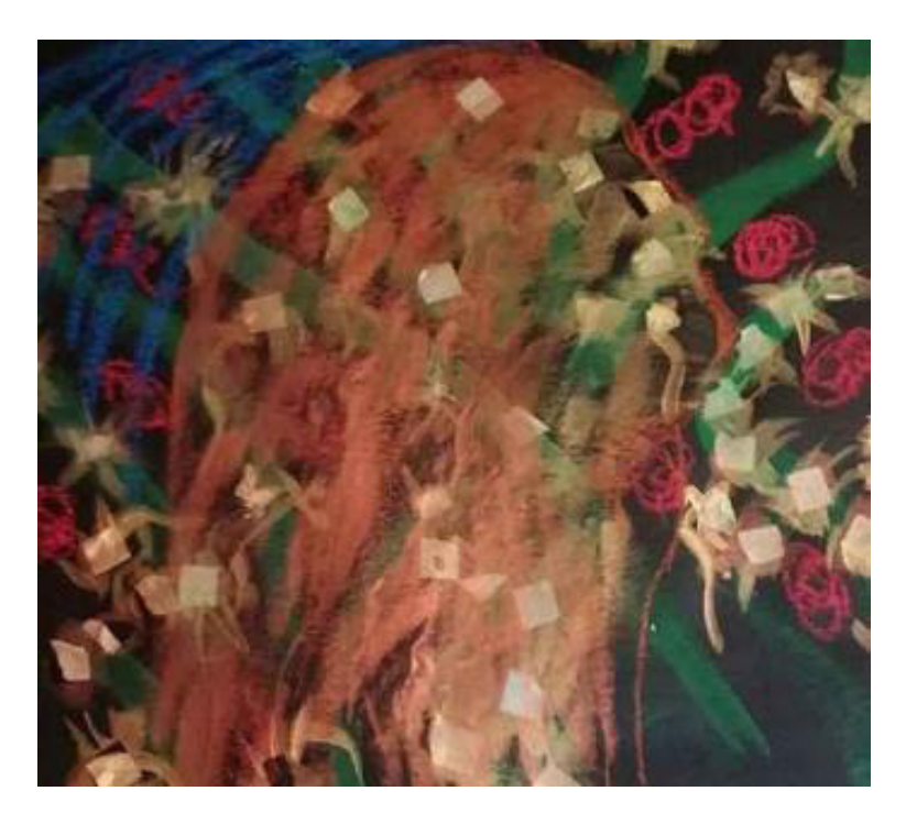
Figure 4. Bird Woman.

Here, the woman is becoming merged with animal as depicted by the blue bird feathers atop her head. The green stripes criss-crossing the woman's head suggest being encased inside a neural network (machine), while the yellow fragments and coils of red suggest a network of organic (earth) matter interspersed within the green technological matrix.