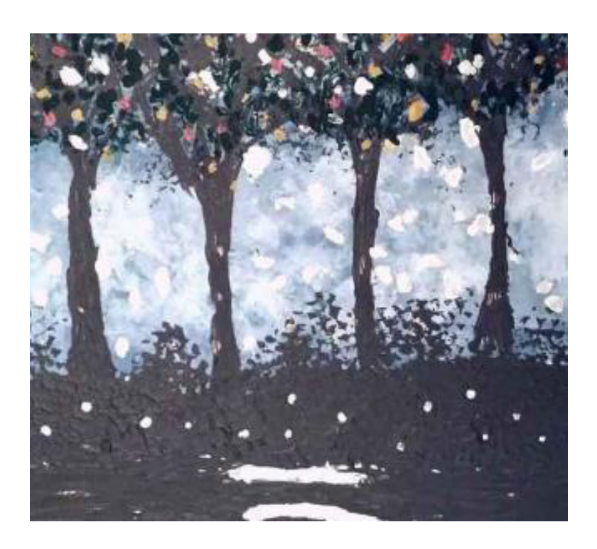
Figure 5. Black Pond.

Becoming earth. If matter is intelligent, self-organizing, and agentic (Barad, 2007; Braidotti, 2013), then matter is capable of intruding and facilitating key moments within material-discursive phenomena. Konturri (2013) proposed the notion of a "particle-sign" to describe an aspect of material-discursive relationships between matter, such as paint, paper, canvas, glue, and the artist (Barad, 2007; Konturri, 2013) that is unintentional on the part of the artist. In Black Pond (Weber, 2015), the particle sign emerges in the image below in the unintentionally overly thick application of black gesso on the banks of a fruit-tree orchard and the waters that run by it.