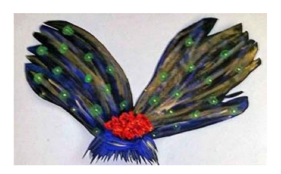
Figure 6. Bird Hat.

Becoming earth requires a nomadism (Braidotti, 2013), which refers to traversing between specific paths, nodes, decisions, units of meaning, and directions, without beginning or end or without finite boundaries producing subject and objects (Barad, 2007). The image below, Bird Hat (Weber, 2015), depicts me becoming animal, which entails nesting grounds and flight paths as well as subjection to seasonal demands.