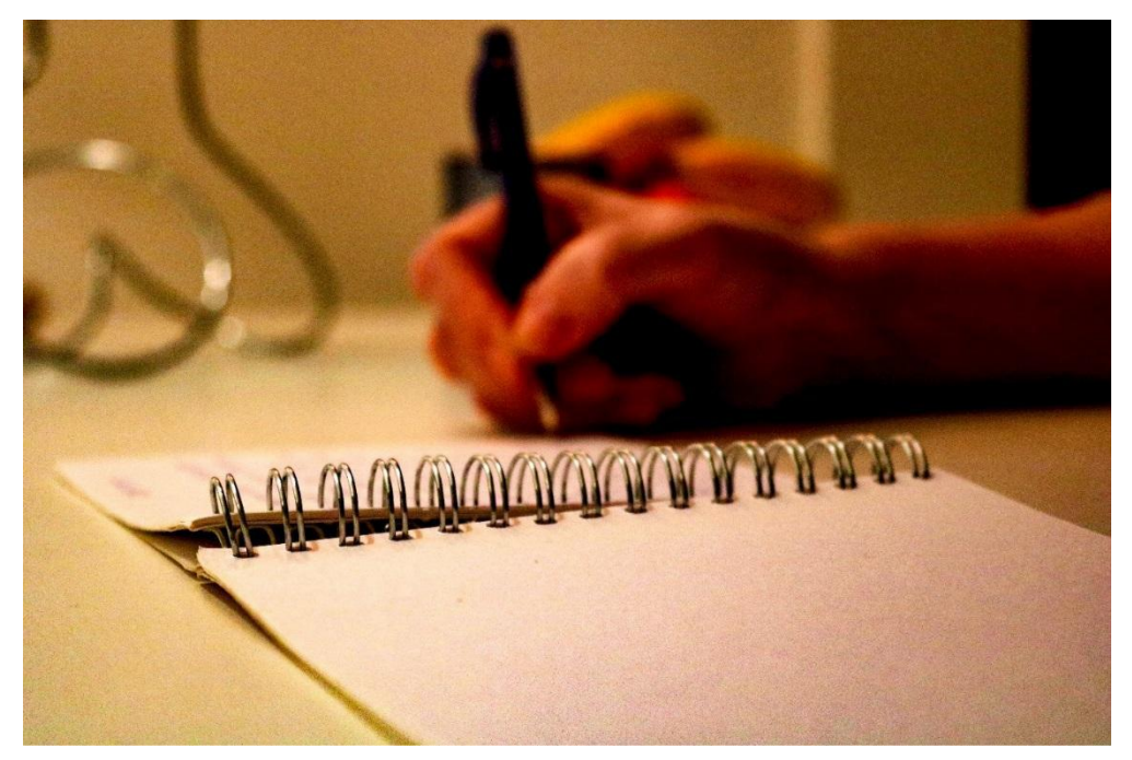
Figure 1. A single hand writes, 2017.

[...] a single hand writes, but the self who inscribes, who is, is herself enmeshed with other lives which give hers the meaning it has. And it is not just 'the author' who takes on an ontologically shaky character in these autobiographies, for so do 'selves' in general." (Stanley 1995: 14)