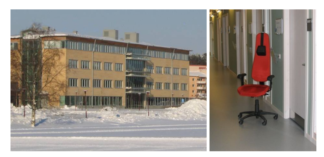
Figure 4. University building, 2005 and Figure 2. University furniture, 2005.

The crouching fearful character, who had its home within the white walls of the corridors, was ready to announce its existence as a thinking writing subject.