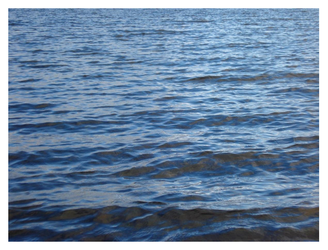
Figure 5. Water, 2012.

feeling. I hope that the open questions and concerns below can be useful to inspire your own untimely academic novella writing for those who would like to work in this direction. I also hope that this text together with the growing strand of inter- and transdisciplinary scholarship on writing within and across the arts, contributes to permission to create critical, creative, and reflexive spaces for writing. Take the risk, dare to be untimely.