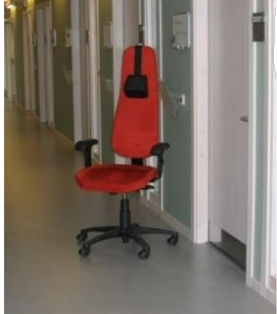
Figure 2. University furniture, 2005.