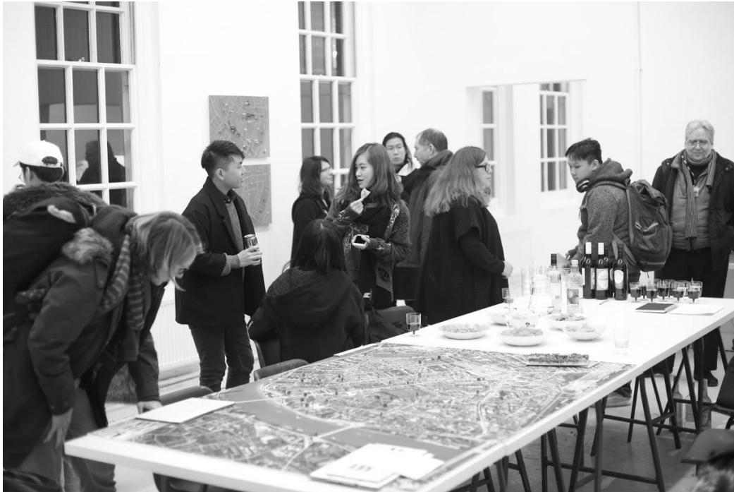
Fig. 1. Private view for The Millbank Atlas exhibition at the Cookhouse Gallery (2017)

The Millbank Atlas is a collaborative project that brings together researchers, students and local residents to trace the neighborhood of Chelsea College of Arts. The Atlas creates meaning through conceptualizing Millbank as comprised of reciprocal relations among the college and surrounding businesses, residential blocks, civil society groups, transportation links and other amenities, infrastructure and further aspects of this built and natural environment.