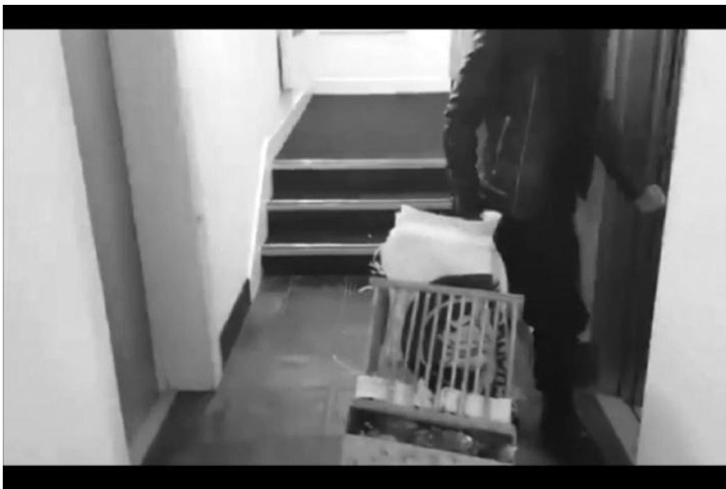
Fig. 2. Chelsea Local students testing a food trolley prototype, Millbank Estate (2017)