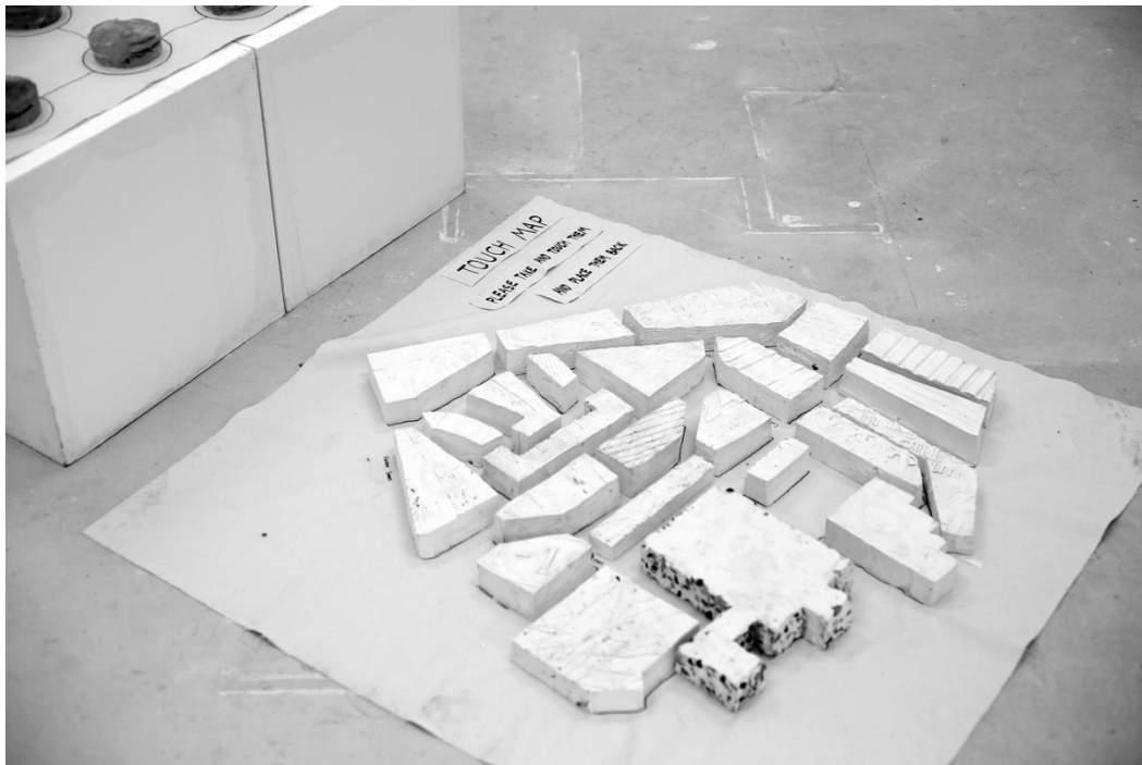
Fig. 3. Touch and Sense Map Part I , Evans Ye, The Millbank Atlas exhibition at the Cookhouse Gallery (2017)

Sturdy, convenient and adaptable, the trolley was built for the task at hand (Fig.2). In addition to being practical, it was designed to bridge disparate people and encourage community inclusiveness. As Rimensberger makes the point, a delivery requires people who might otherwise be isolated to open their doors and let the outside world in (Rimensberger, 2017). In this way, the trolley feeds into the Atlas' broader interest in crossing thresholds. These include moving between public and private space, shifting between the college and Millbank's other communities and working across teaching and research, with these activities understood as constituting each other in ways that cannot be anticipated in advance.