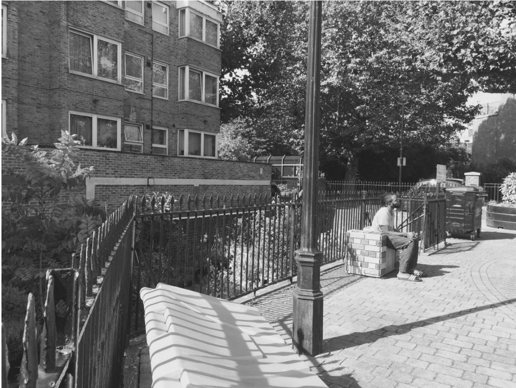
Fig. 5. Touch Bench , Evans Ye, Installation view, Millbank Estate (2017)

provided the student with an interesting and actual opportunity. In exchange, Ye created an artifact that instead of being skipped after the degree show, enjoys a vital afterlife, recalling the designer's presence and contribution further to his return to China.