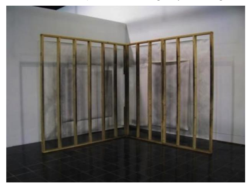
7. Laura Lisbon, Corner Setup (wall displacement) 2009, image retrieved from https://art.osu.edu/people/lisbon.1

comfortably within a post-modernist (I mean the kind of post-modern that is more like a return to modernism, but with a twist) model of contemporary artmaking.