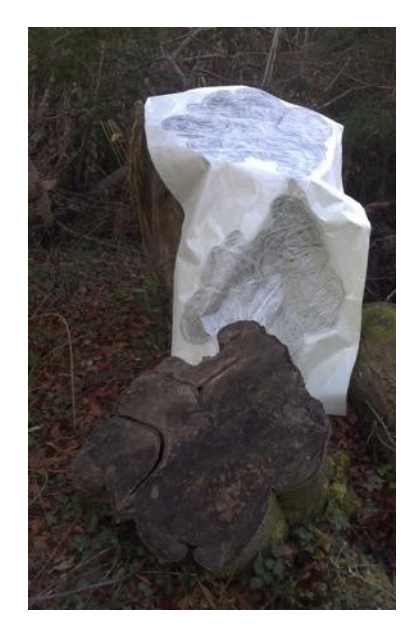
2. Rubbing Inner Wood 2013

A breakthrough came eventually with the drawing Rubbing Inner Wood . It was made by rubbing graphite over Japanese washi paper, which was positioned on the mirrored cut surfaces of a fallen beech tree. I had admired the distinctive shape of this cut beech as I walked the nearby path. Here was a making process that required intimacy, touch; literally rubbing up against my subject. As I made the drawings I learned the tree, or met the tree, to use a Haraway-infused term, in a more intimate way. This was much more satisfying—I had the smell of the tree in my nose and we exchanged cells via mutual abrasion. It wasn't scientific knowledge, but it was a knowing. It was a meeting of bodies - our bodies that were both vulnerable.