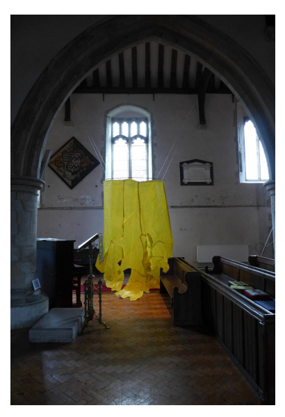
4. Work in progress, R: installed at St Mary's Lydd, as part of Art in Romney Marsh .

These Rubbings in a Wood emerged as a series that will, if completed, include one individual from each species of tree in Shoreham Woods, and in the wider project they combine with sculptures, video installation, performed sound pieces and various diverse co-productions with other beings, to become multi-disciplinary gallery installations, which in their overlap of forms, and their diversity of scale and media, aim to mirror the sense of discovery and detail in wooded space, and the way that multiple disparate but interlocking large and small things build towards a unique "ecology".