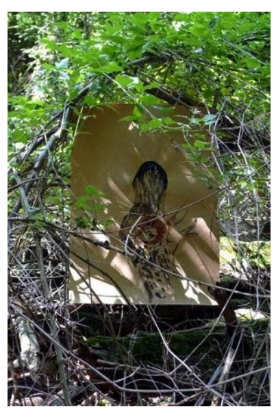
1. Mile a Minute installation 2013