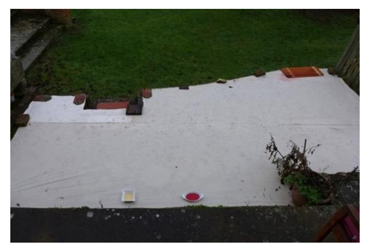
5. Foxing: The Patio Project, 2017

pheasant bones, fish skins, honey sandwiches, raw eggs. With the trail camera primed, I awaited the magic of interspecies art.