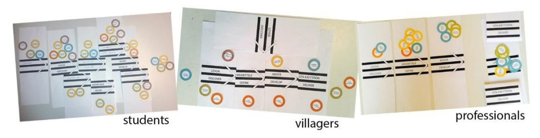
Figure 4. different process visualizations done by stakeholders of Autti village case. Author: Essi Kuure.

The four villages are considered to be 'a set of individual case studies' (Robson, 2002, p. 181), where common features were studied and reflected upon. Every interviewed group reflected on their own experience of the competition. During the interview, every group also demonstrated the process from their point of view by using process phase and thematic paper pieces prepared in advance (Figure 4). First, the group visualized the process from their perspective by stating what happened, in which order and how they would describe the happenings. After that, themes of social engagement, empowerment, co-design and positive change were discussed in connection to the competition. Interviewees marked specific moments in the process with the thematic tags and described at the same time how they felt that these themes were present or non-present during their collaboration.