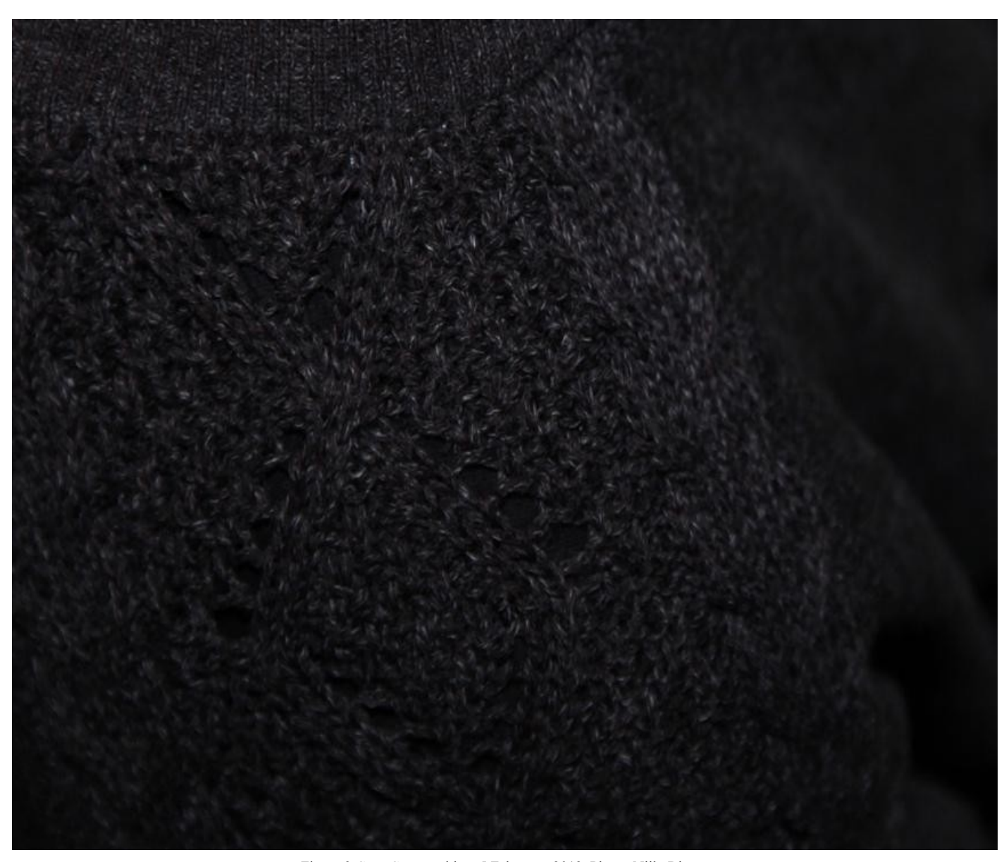
Figure 3 Grey Garment blog, 5 February, 2012.