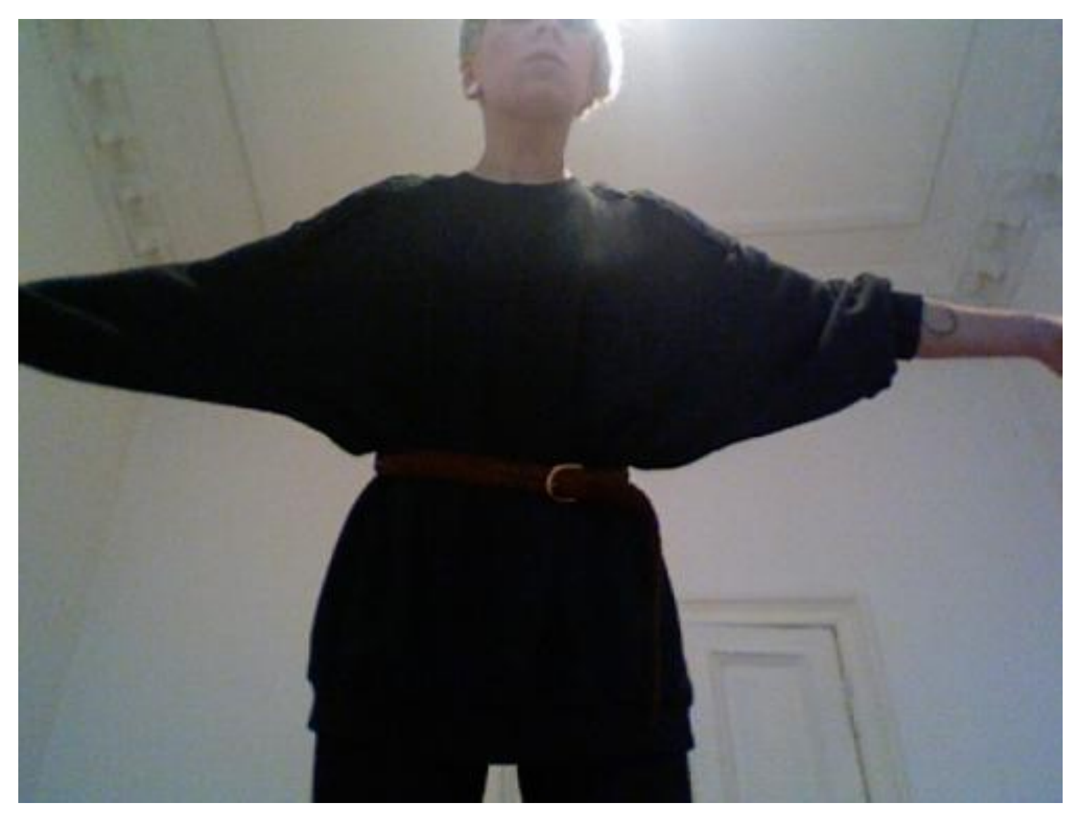
Figure 4 Grey Garment blog, 11 December, 2011.