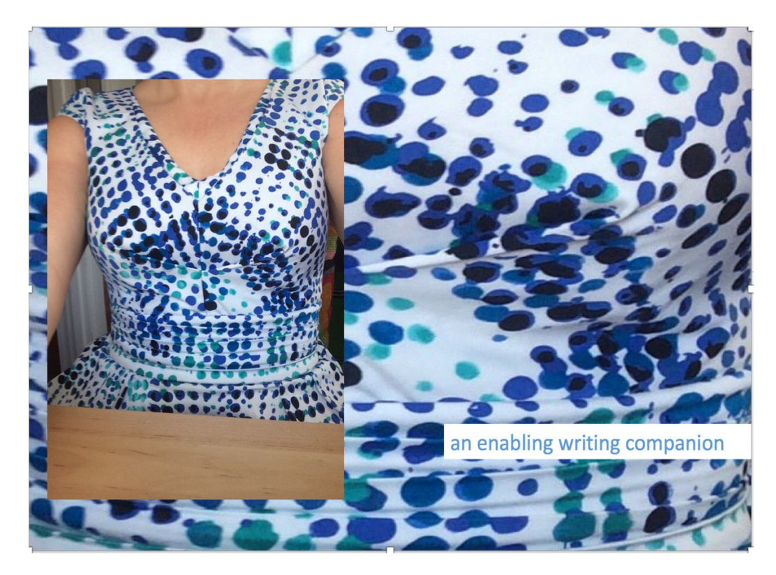
Figure 1 A writing cloth-body, 28 November 2016.

Sometimes my favourite purple bodycon type of bamboo dress with a large drape crossing the body I made for long-haul flights is the best option. But today is too hot for that. And maybe my writing, and the timetable it must follow, will need more structure, too. Today I'm wearing a sleeveless dress with a knee-length, A- line skirt, the top tightly cut, supporting my core. The armholes come pretty high up. It's a hot and humid day and I don't want my armpits to glue to my skin. I need my arms to be able to move freely, without traction.