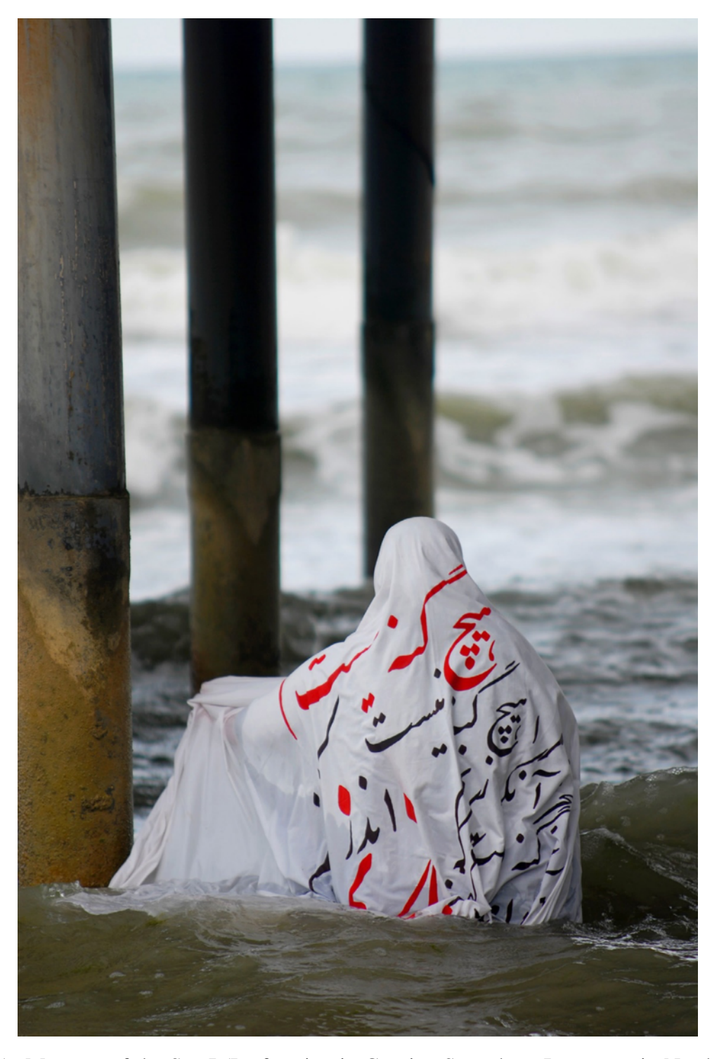
Figure 1. Memory of the Sea I (Performing in Caspian Sea where I grow up in Norther Iran, 2013) Diasec print, Exhibited at Current state, Cable Factory, Helsinki, 2015