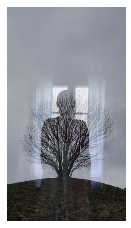
Figure 5. In Transition, Eending part of the video, Merging figure of the woman with Finnish rowan tree in the Suomenlinna island, 2017-18, Sepideh Rahaa

[in] urgent times, many of us are tempted to address trouble in terms of making an imagined future safe.... staying with trouble does not require such a relationship to times called the future; it requires learning to be truly present ... as mortal critters entwined in myriad unfinished configurations of places, times, matters and