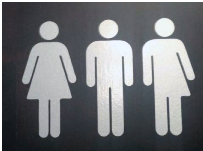
Figure 6: Authors' personal photograph of alternative bathroom symbols for the Swedish.

Regarding sexual identity, teacher and researcher Addison (2005) draws attention to a de-