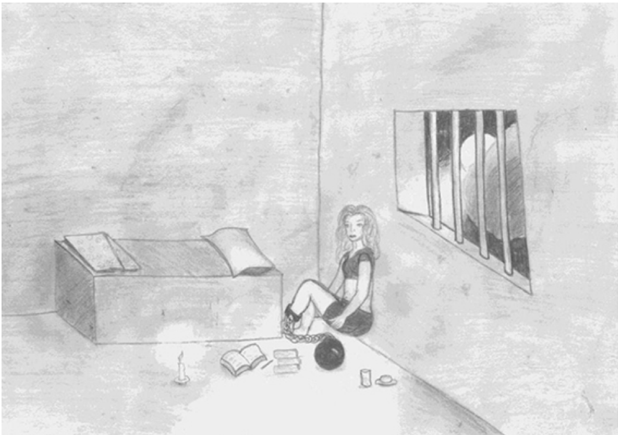
Figure 2: Girl kept prisoner

The students' images of school create visual representations of gendered norms and the self-discipline required in different school contexts, as well as the complexity of navigating gendered youth cultures. Many of the images depict the corporeal and intellectual discipline needed to 'live up to' gendered norms and the requirements of being female or male. The images made by female students often include themes of not being or doing enough, of feeling unattractive or being unhappy with oneself. An image in which a girl is kept prisoner, for example, draws