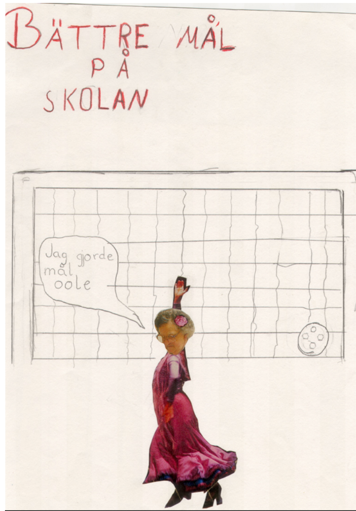
Figure 1: Better goals at school: 'I scored the goal—ole.'

visual elements that do not belong together creates a radical humour: an older woman with the head of a man, wearing a pink flamenco dress and acting like a matador on a football field. This image uses visual arguments to challenge gendered and other norms, such as age. These visualisations challenge the norms by breaking or re-negotiating them as assemblages that are not seamless totalities, but collections of heterogeneous components. The double meaning of 'goals'—learning goals in school and football goals—is well-actualised and transfigured in an assemblage of becoming , producing multi-layered effects (Deleuze & Guattari, 1994). By