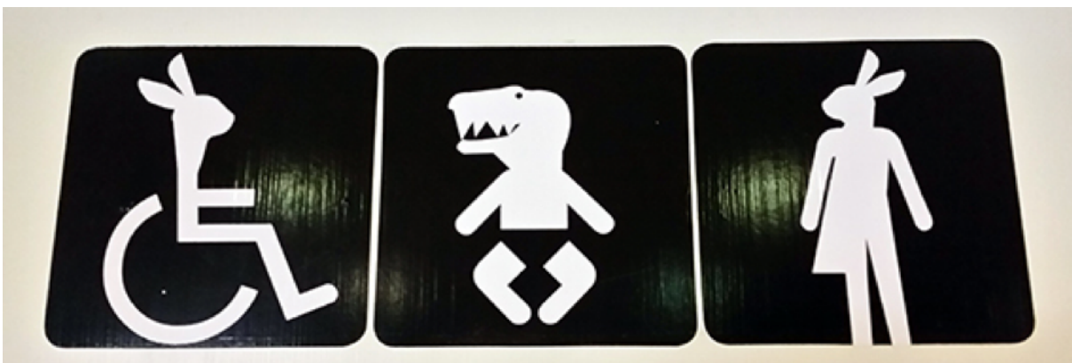
Figure 7: Authors' personal photograph of alternative bathroom symbols for the Swedish Museum of Natural History.