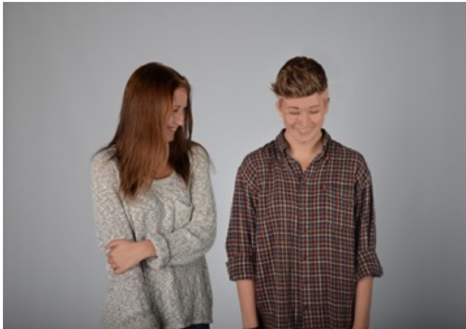
Figure 5: Student’s photograph on the theme ‘If I were my brother . . .’

The student in the photograph in Figure 5 appears as both female and male, or as herself and a ‘brother’. She explained that she ‘wanted to experiment with what my twin brother might have looked like, because I always wanted a twin brother . . . I wanted to describe the love between siblings’. The girl also described experiencing a feeling of ‘gender dizziness’ when looking at the photograph. It is a courageous commitment to transform yourself into the opposite gender and confront yourself with that picture. Even if it is a project in school,