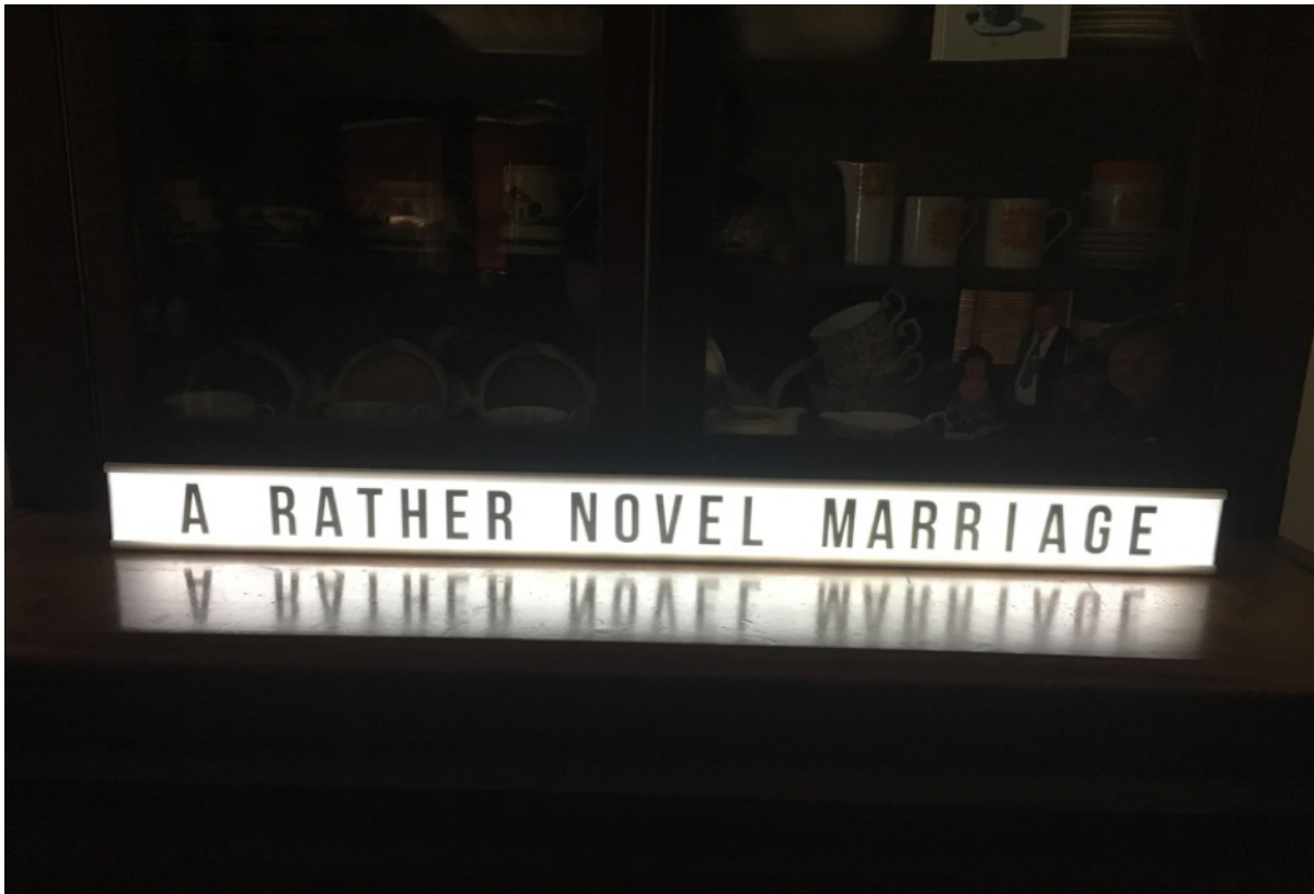
Figure 4: Marriage of an Aboriginal 2018 - Sample sentence and lightbox on brown antique chiffonier