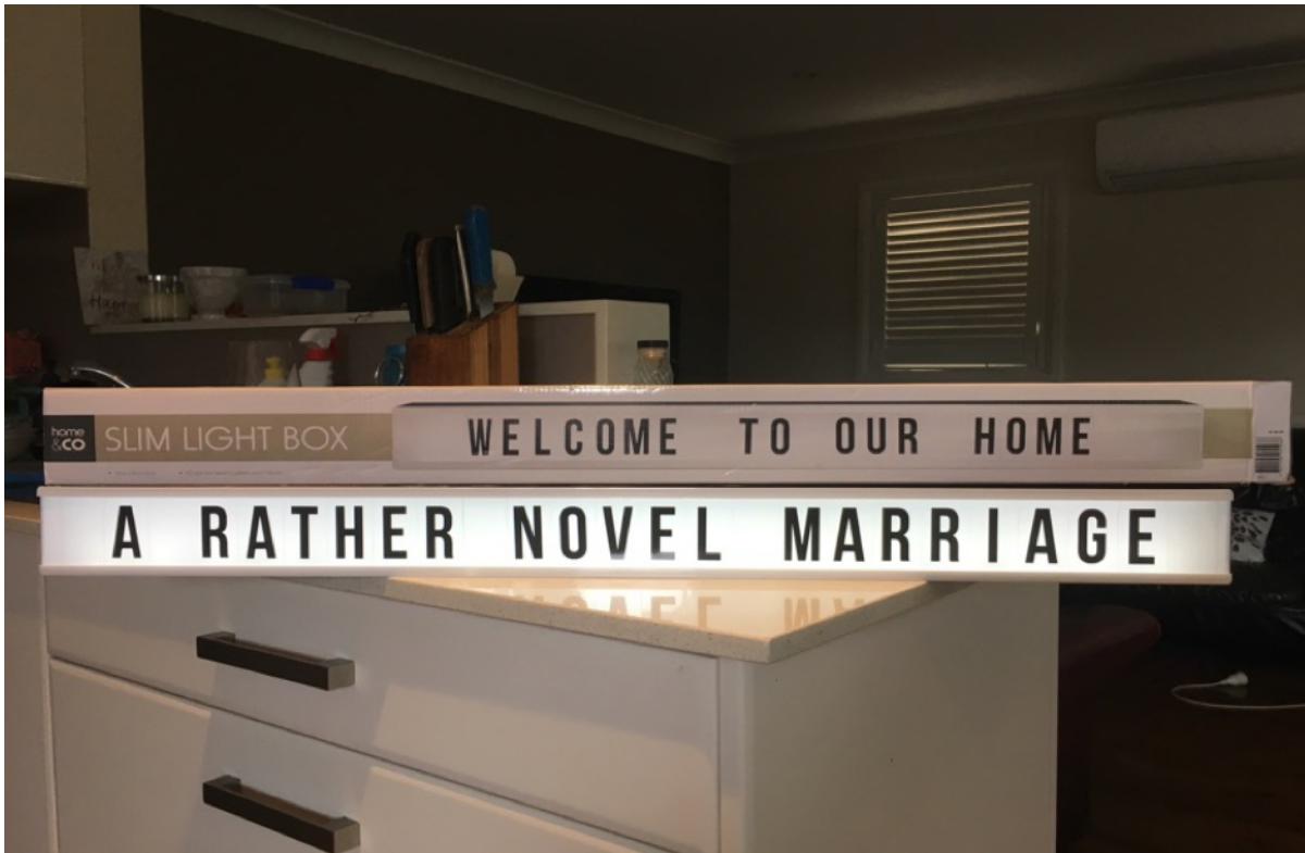
Figure 3: Marriage of an Aboriginal 2018 – Sample sentence and slim lightbox on white background – Photograph by Kim Snepvangers, 2018

Preparation for an exhibition of my artwork as a “visual encounter”, involved testing the lightboxes for their capacity to illuminate and bring key micronarratives into the light. Both Images 3 and 4 use the one first line from the selected text in two different background environments. I wanted to have a sense of the wordly sensibility that best portrayed deep contrast between the whiteness of a contemporary kitchen (Image 3) juxtaposed with an historical brown antique chiffoier (Image 4). Whilst the two images work well as photographs, these prototypes needed to be extended further, beyond the domestic context of singular artworks. This involved thinking through the staging of a kind of diorama, to anticipate “visual encounters” as an event, using the four lines of selected text within an exhibition environment.