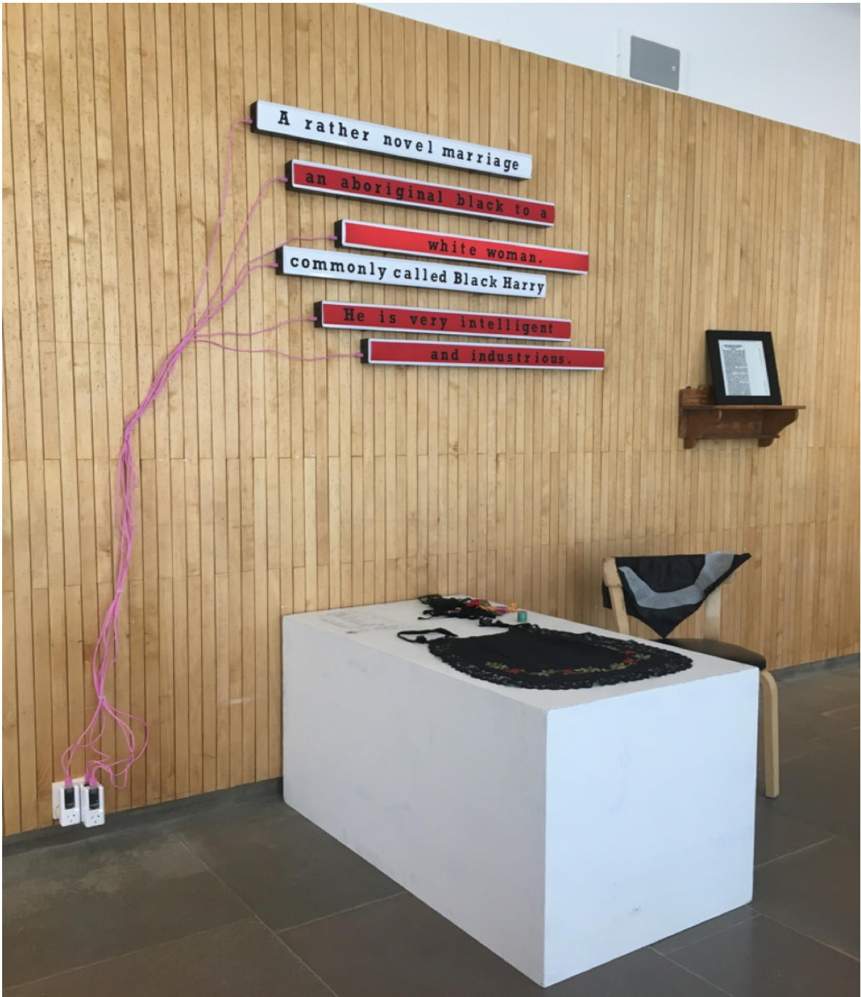
Figure 6: Snepvangers, K. (2018). Marriage of an Aboriginal in Dark Days//White Nights . betaspace, Aalto University, Finland. Photograph by Kim Snepvangers, 2018