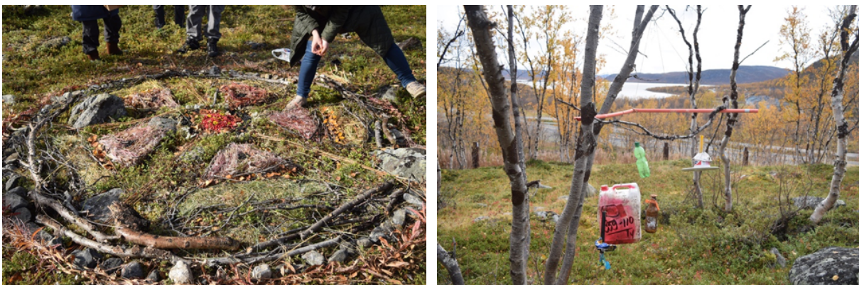
Figure 7: In Kilpisjärvi the theme was wind and temporary artworks were made from natural materials.

natural materials and playing with the wind. Tourists and other passers-by also participated. The workshop stirred up conversations about the environmental responsibility when piles of garbage were found in nature.