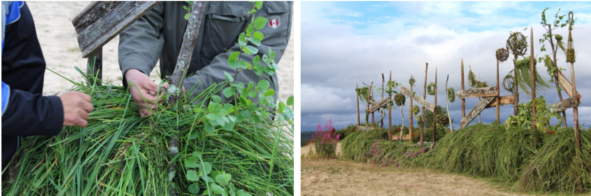
Figure 3: Locals teach us how to tie hay correctly into the Haasio. In the final artwork, Haasio of Memories, every participant left their mark on it.

After Vuontisjärvi, the first student group finished their project and a new group of students started theirs. To pass the torch and become familiar with the municipality, we attended the local full moon celebration arranged in Hetta. The first group of students shared the outcomes of the two workshops with their audience through a series of videos, and the new group organized a small Jwibunori —a Korean play workshop with fire lanterns based on one student’s own cultural background. This play is traditionally performed during the full moon for good luck and is designed to eradicate the pests from the surrounding fields—a performance which connected