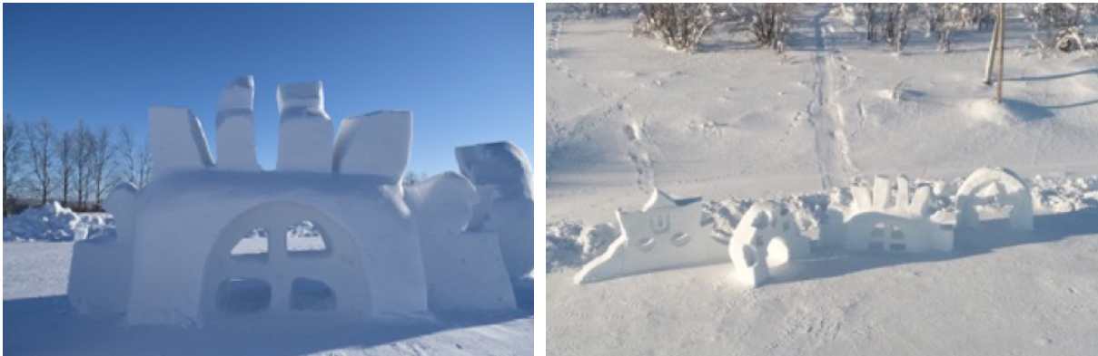
Figure 5: Sun symbols from India, Russian Yakutia, Sámi and South Korea.

The fourth workshop was organized in the small village of Palojärvi. February of 2018 was very cold and the temperature during the workshop days averaged -33\text{ C}^{\circ} . The timing overall was unfortunate as the Olympic Games, combined with such cold weather, kept people inside and we had very few participants. The sun had recently returned to the northern sky after the polar nights and, because of the time of year, the chosen material was snow and the theme was about sun symbols of different cultures.