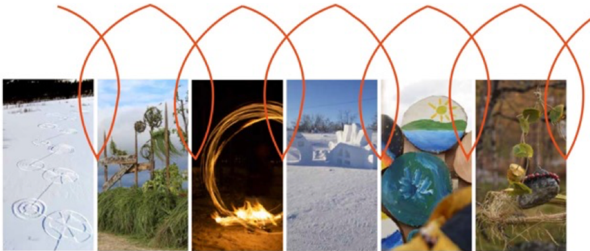
Figure 8: Continuity Cycle A. Putting learning into action. Represents the reflexive process that took place after each workshop. The workability and development points of the action were determined.

Cycle A represents the actions and development points that happened between each work-