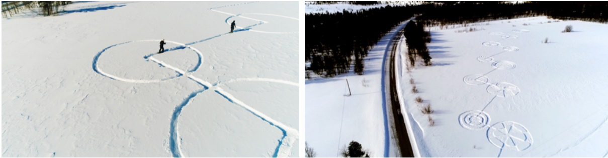
Figure 1: The artwork “Fox was here” is based on an old Finnish folk tale about a fox creating the Northern Lights with a swift flick of its tail. The circles on the ground represented the fox’s footprints before jumping up to the sky. With the help of our contact people, we organized the first workshop in Hetta, the central village of Enontekiö. We had six local participants around Enontekiö and the student group was comprised of students from Finland, China, France and Canada. Symbolically, the first artwork started to also look like the points on a map, like the entire Art Path collaboration.

ideas started to flow. It was one of the participants who summarized the common wish that later formed the guiding idea of the whole Art Path. She pointed out that the public events were usually always arranged in the center of the municipality and the more remote villages were rarely the places of action. She stressed that the villages had each their own unique cultural and natural materials that could this time determine where and how the workshops would take place. It was her point of view that concretized the working modes and the Art Path took its form moving from one village to another, sparking collaborative discussions that lead to personalized themes that were unique to each community.