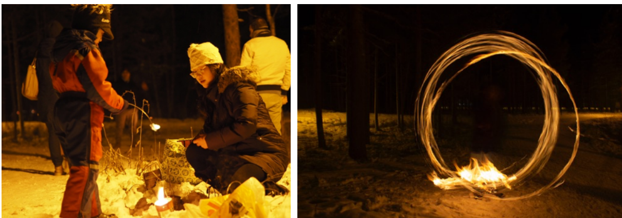
Figure 4: Jwibunori in Hetta. The fire lanterns were built in old tin cans with small fires. When rolling them, fire circles started to form. Image 1 Juho Hiilivirta, Image 2 Huang Liu.

After Vuontisjärvi, the first student group finished their project and a new group of students started theirs. To pass the torch and become familiar with the municipality, we attended the local full moon celebration arranged in Hetta. The first group of students shared the outcomes of the two workshops with their audience through a series of videos, and the new group organized a small Jwibunori —a Korean play workshop with fire lanterns based on one student’s own cultural background. This play is traditionally performed during the full moon for good luck and is designed to eradicate the pests from the surrounding fields—a performance which connected