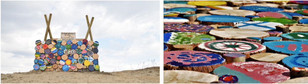
Figure 6: 'Meän kylä / Min gilli / Our village' was a collage of children's individual paintings of their villages.

natural materials and playing with the wind. Tourists and other passers-by also participated. The workshop stirred up conversations about the environmental responsibility when piles of garbage were found in nature.