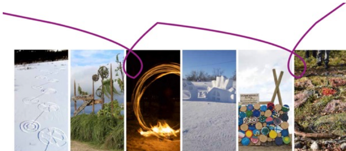
Figure 9: Continuity Cycle B. Passing the torch. The historical continuity and next steps form a core of this figure. Student teams change and my role also gradually changes.

Cycle B is mainly about my role and the local community members’ roles. Due to the intervention type of work, and frequent changing locations and groups of participants, we were the only permanent actors in the process who understood the historical continuity of the collaboration. It also made us responsible for the continuation of the project. The location contacts worked actively in art and other cultural activities for years in the municipality. My understanding of the entity of the Art Path was more related to my student groups. This cycle also includes the roles of the two student groups in relations to each other. Cycle B also represents the follow-up points, where the results of this process were later presented at a public event.