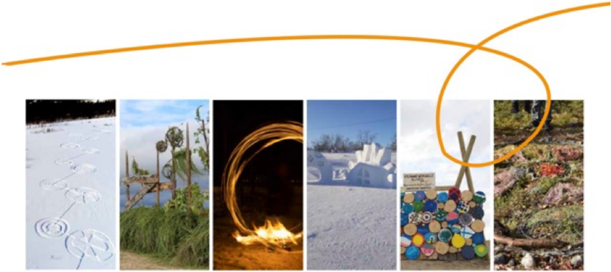
Figure 10: Continuity Cycle C. The pilot phase is now completed, should we continue? How? The figure represents an evaluative stage of the whole pilot phase of the Art Path collaboration.