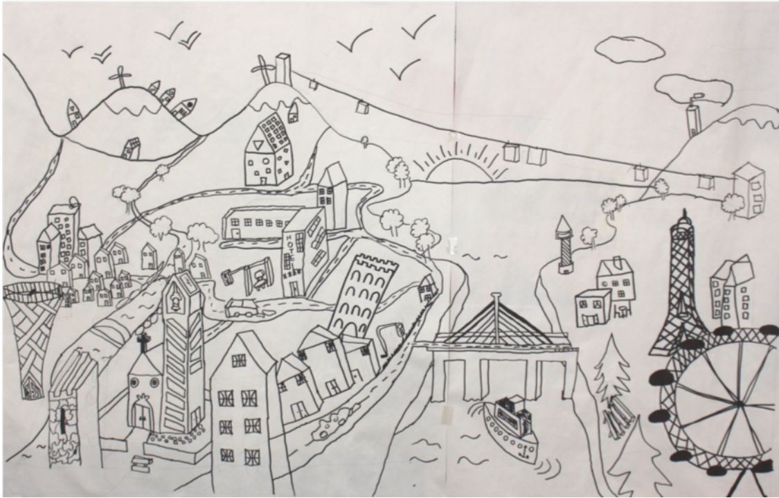
Figure 3: Final collaborative drawing example. Workshop "Uma Cidade Para os Teus Olhos" archive data

administration, 15 Security and 14 Tourism. A chart representing these categories per quantity is Figure 3. The number of exceptional buildings in the children's cities exceeds all other types of urban facilities. Surprisingly, the most numerous facilities (exceptional buildings) have no survival value like all others, but a communitarian symbolic value.