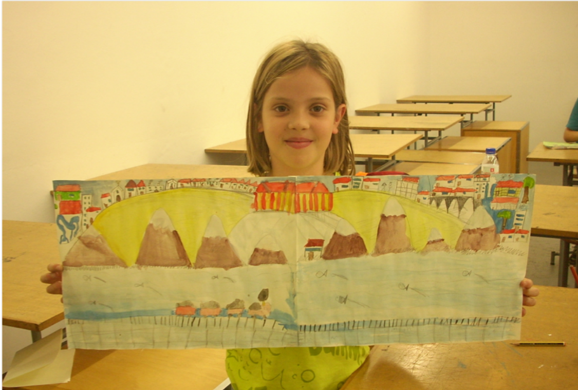
Figure 1: First drafts example. Workshop "Uma Cidade Para os Teus Olhos" archive data

The one-day workshop begins with a guided visit to the buildings of the faculty of architecture, so that children can understand what the practice of architecture is about. During the visit, the phenomena of the city and the fields of architecture and urbanism are approached. Children interact with the various buildings and connect with the outside spaces. This interplay with a high-quality space allows them to naturally integrate the architecture lesson on the school building complex, by awarded architect Álvaro Siza, which is itself a lesson in architecture, place and beauty.