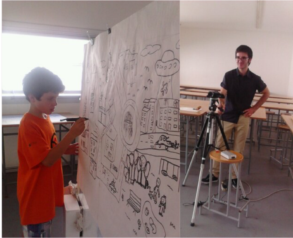
Figure 2: The filming room. Workshop "Uma Cidade Para os Teus Olhos" archive data

criteria to meet the workshop challenge i.e. drawing "the best city ever".