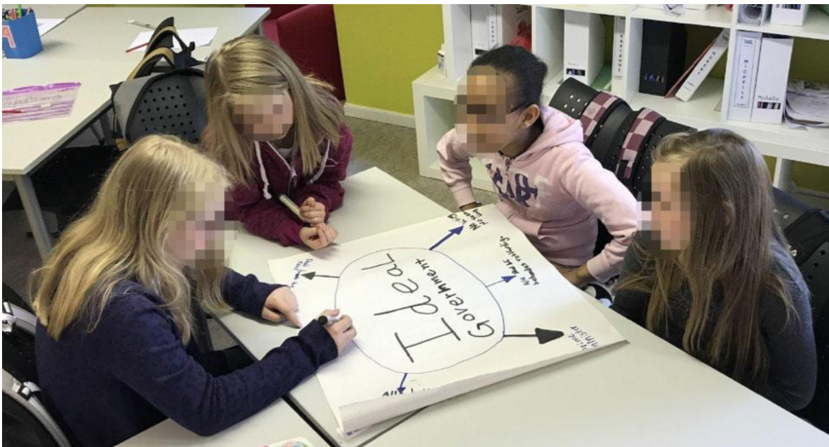
Figure 7: Students collaborative brainstorming

During this lesson, twelve students from sixth grade, inquire into the interconnectedness of human-made systems and communities; the structure and function of organizations; societal decision-making; economic activities and their impact on humankind and the environment (IB program of inquiry). During art class, students analyzed posters and flyers from different socio-political contexts and times including propaganda from regimes, democratic and communist parties. Students then designed an ideal government in groups, see Figure 7. After that, in Figure 8 and 9, students designed their own political campaign poster applying the technique of poster design, basic advertising strategies, such as, creating a slogan, taking a photograph that communicates an attitude, and selecting a font to emphasize their slogan. Students also wrote a statement that was used as a speech on election day. By doing this, the students developed confidence in seeing themselves not just as students in art class, but also, as politicians. In other