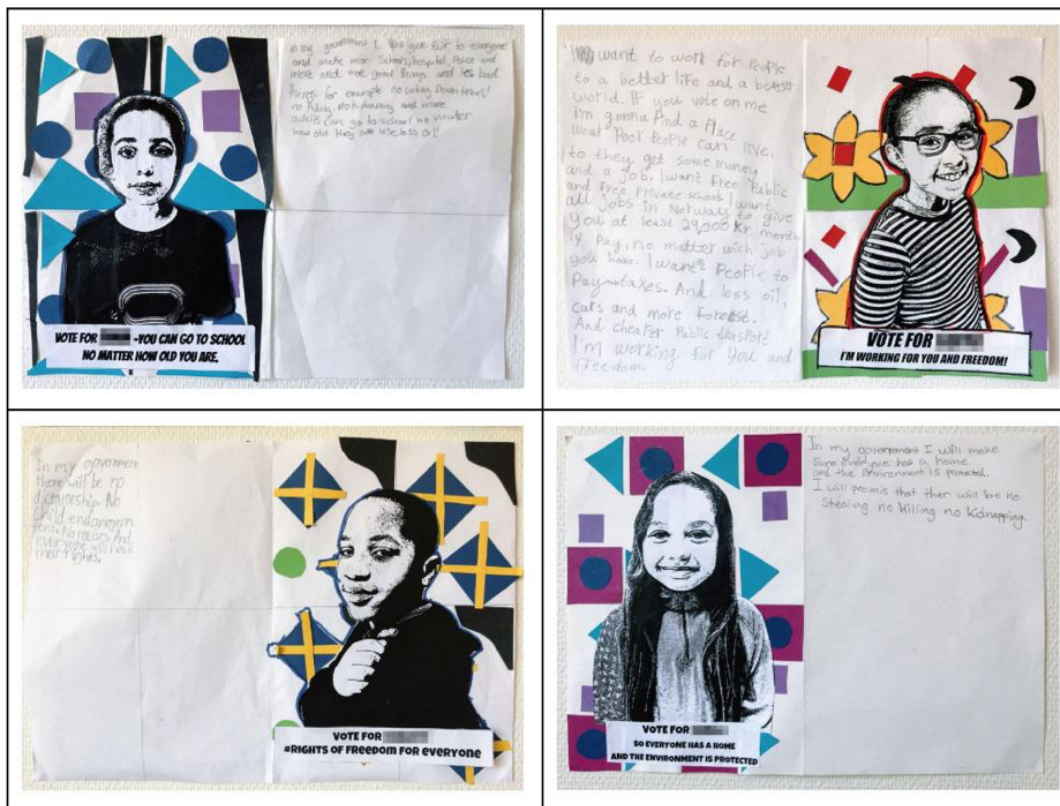
Figure 9: Students' posters and statements selection