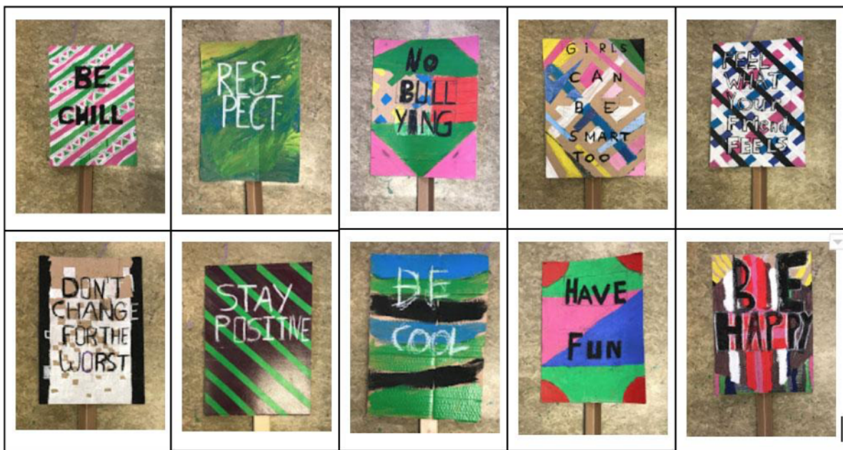
Figure 4: Positive attitude signs made by students

real world obstacles, such as bullying (pp. 9-24). Similarly, author Gude (2012, p. 78) argues that the art made at schools is what students experience and shows the knowledge elaborated through a set of “collaborative activities” . On the one hand, the curriculum frames and restricts the art activity reducing the chances of an organic and quirky process. On the other hand, the collection of information coming from the students emotions in order to create messages with their own voices allowing the students to use the space of art to deal with the problems of bullying that often times occur outside of the teacher’s view. While it is true that bullying situations cannot be solved with art, we have used art to create awareness and empower students’ voices. The outcome has been positive according to students post action interviews.