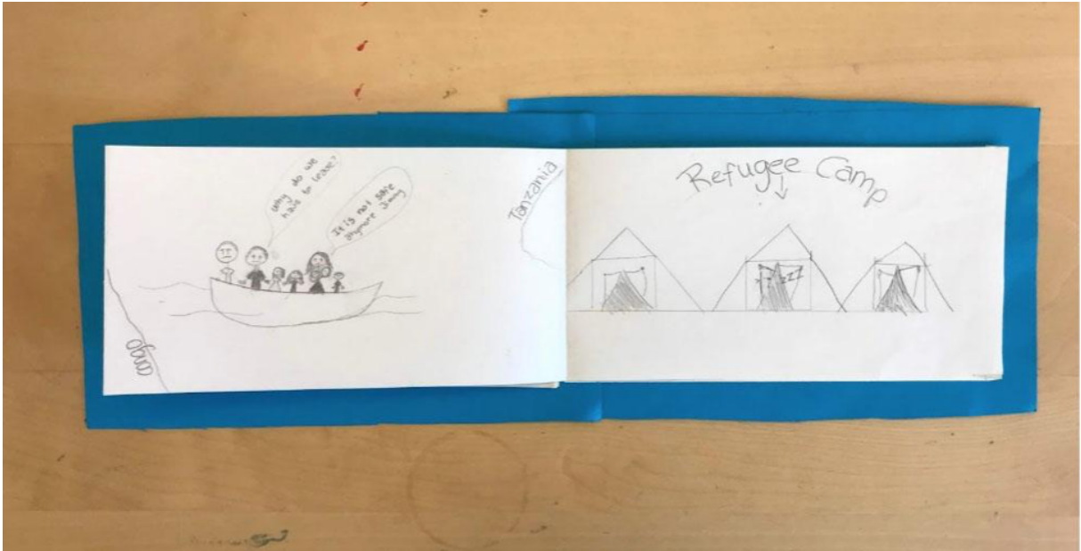
Figure 3: Student artwork immigration story. This student narrated the story of her father who came as a Congolese refugee to Norway