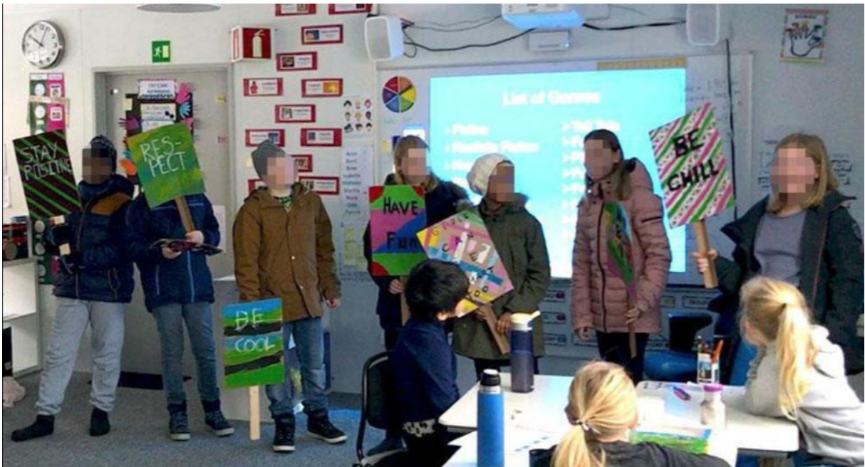
Figure 6: Students as role models for the lower PYP grades