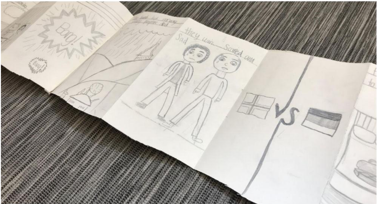
Figure 2: Student artwork migration story. This student used his grandfather's story who experienced the Nazi occupation in Norway and temporarily migrated to Sweden