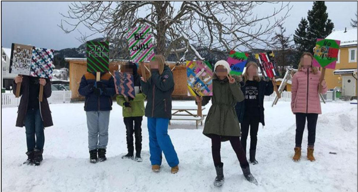
Figure 5: Students march in the school area