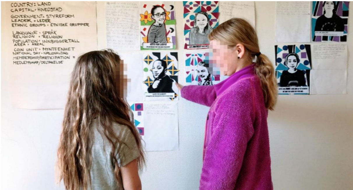
Figure 8: Students discussing potential candidates and their statements before the election day