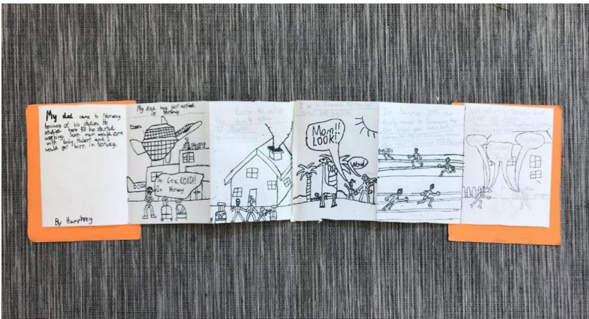
Figure 1: Student artwork migration story. This student utilized his own story when the family migrated from Tanzania to Norway, and vice-versa

served that one student stated during a class discussion, that migration is a synonym to diversity but also of being poor. In the same vein, when the activity of making their own comics about migration was introduced, five Norwegian students from fourth grade and two from fifth grade, whose families are composed only of Norwegian members, asked what they should do as they did not know anyone who had migrated. Another student asked if it would be possible to use a great-great-grandparent who escaped Norway during the Nazi occupation. As a result, students researched and collected data from their own contexts about migration and culture using interviews as a method. In addition, a drawing workshop was designed for students to learn how to structure a figure and create scenery elements. The comic format was done as an accordion book so students could add pages as needed and understand the story as a timeline. Examples provided in Figure 1, Figure 2, expose cross-cultural identity examples. In Figure 2 and 3 details of political persecution can be observed.