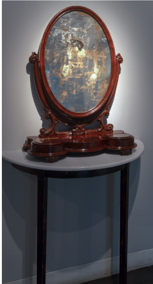
Figure 12. Corner with mirror from the Unknown Crying Man Museum , 15th Istanbul Biennale, 2017.

“Reflection works only from oppositions and rests on oppositions” (Schelling, trans. Vater, 2001).