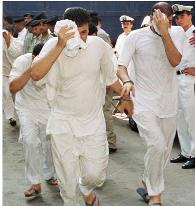
Figure 2. Queen Boat Arrests, Cairo, 2001, on-line found image.

Historical house museums have contributed to identity building – through their usage in different forms of pedagogy within the construct of the modern nation state. The most straightforward definition of a house museum is that it is a “dwelling, museumized and presented as a dwelling” (Young, 2007). House museology is thus a specific practice within the wider field of museology and curating since as Young (2007) has argued, houses have the capacity to become both the objects and subjects of a museum, which is to say that they are able to at once contain a museum and institute it. Pinna (2001) cites three main categories of the historic house museum. Aesthetic : in which private collections that are unrelated to the house or its history are displayed. Representative : in which an epoch or way of life are reconstructed. And, Documen-