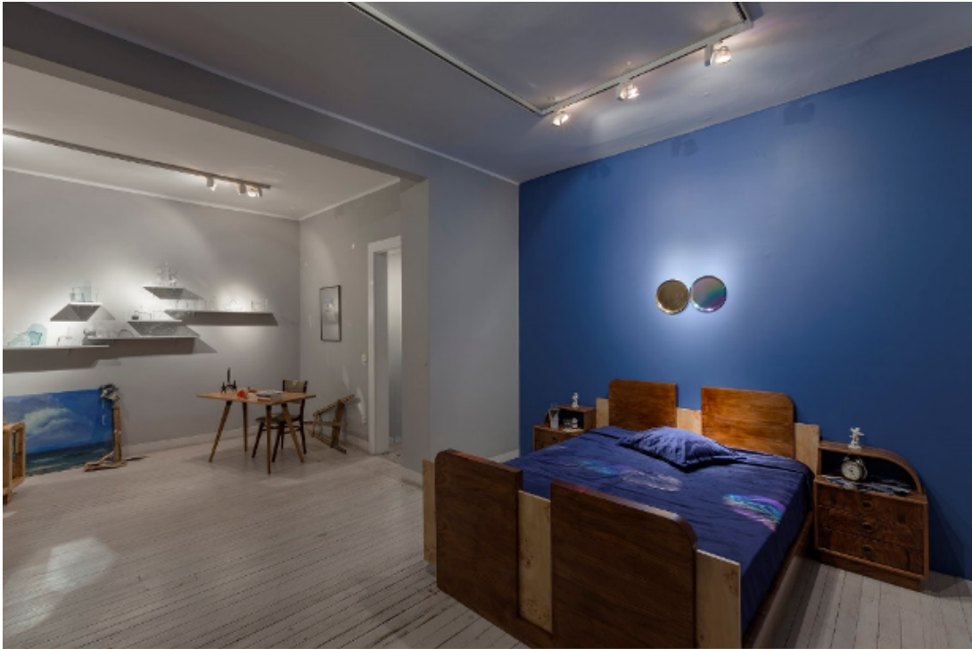
Figure 7. Mahmoud Khaled - bedroom, the Unknown Crying Man Museum , 15th Istanbul Biennale, 2017.

Thus, the question is, how can a museum center itself around this legally recognized yet politically contested concept? What would constitute a tangible representation of dignity? These difficult questions are at the core of The Unknown Crying Man Museum. Dignity is represented as a complex struggle that escapes precise definition but is communicated through a dynamic spatiotemporal encounter with meticulously constructed evocations of memories, a carefully curated selection of objects, books and paraphernalia, and a piercing solitude. The solitude is, in fact, generated by the absence of the unknown crying man himself as a fully constituted subject. He is an empty signifier who has a noteworthy backstory — he was one of fifty-two men arrested in 2001 on the Queen Boat, a floating gay nightclub in Cairo — yet remains unknown to us, despite the reproduction of his generic image to document the humiliation of those men and to send out cautionary signals to anyone identifying as gay.