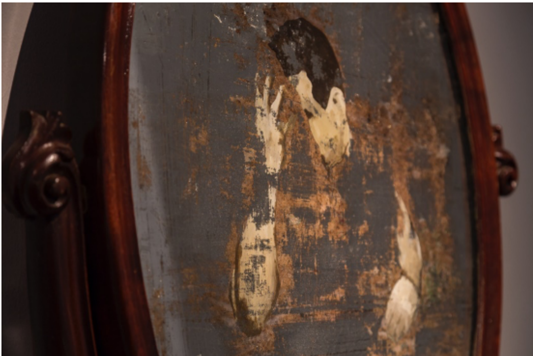
Figure 15. Mirror detail from the Unknown Crying Man Museum

works to commemorate the traumatic encounter the unknown crying man had with the state apparatus. This is no broken mirror; it still works in parts and patches, momentarily reflecting other objects in the museum. But when we look into it, our faces are not simply reflected in its surface. Rather, like some encounter with an ancient face-recognition system, we witness our features warp and convolute as they attempt to fit into the narrative of this unknown crying man. They never map onto his but, in this mirror-dance, traces of his trauma tattoo our faces and traces of our reflections intersect with his image.