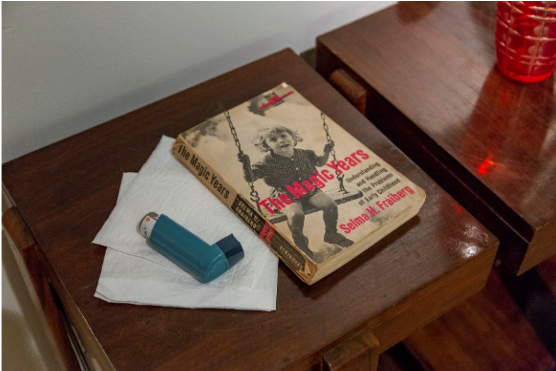
Figure 8. Detail, the Unknown Crying Man Museum , 15th Istanbul Biennale, 2017.