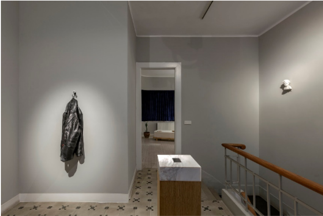
Figure 6. Mahmoud Khaled - the Unknown Crying Man Museum , 15th Istanbul Biennale, 2017.

“Bread, freedom, human dignity” was one of the more popular slogans during the mass protests that rocked Egypt in the early 2010s. However, while bread indicates a concrete demand for basic nourishment and the alleviation of poverty, and freedom can be somewhat simplified — albeit always insufficiently — beyond its vast philosophical and existential territory by breaking it into smaller packages of freedom (freedom of choice, freedom of movement, etc.), dignity resists being made concrete or being repackaged into more easily digestible units. It is a concept that perhaps requires immense creative input to think past its Kantian legacy and limitations but one that nonetheless operates as a guideline against humiliation and the obstruction of others’ pursuit of a life-plan (Schroeder & Bani-Sadr, 2017).