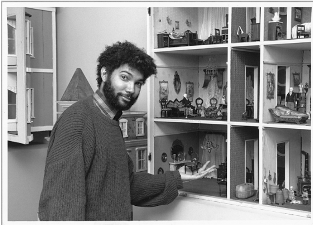
Figure 10. Artist Fred Wilson in front of a 1904 dollhouse, part of one of the installations featured in Mining the Museum, 1992-1993 at the Maryland Historical Society, ca 1992, unprocessed