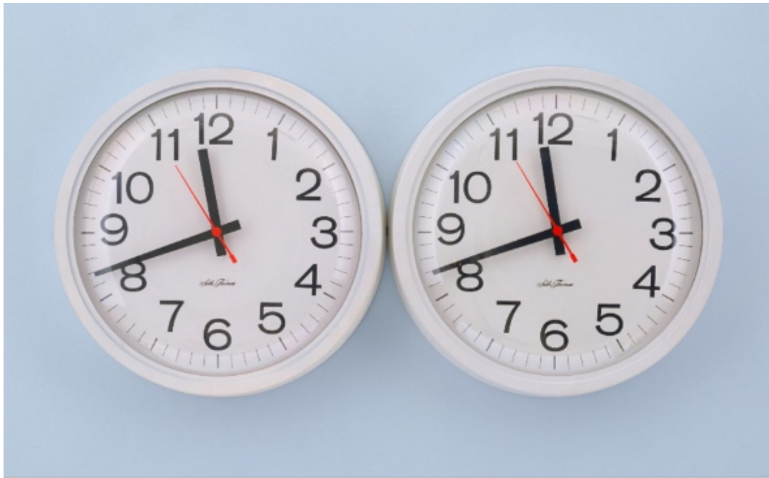
Figure 9. Felix Gonzalez-Torres – Untitled (Perfect Lovers) , 1991, clocks, paint on wall, overall, 35.6 x 71.2 x 7 cm

Undoubtedly, one of the most iconic, trendsetting moments in artist-as-curator history is Fred Wilson's seminal Mining the Museum (1992) at the Maryland Historical Society in Baltimore. Selected and installed by Wilson, Mining the Museum was a game changing exhibition that the artist developed on invitation by The Contemporary, Baltimore to use the archives, stored items and resources of the Maryland Historical Society. Installed inside the Society's museum, the exhibition aimed to excavate the site of institutional racism and recover neglected and excluded African-American artifacts and heroes (Wilson & Halle, 1993). The many curatorial constellations Wilson put together for Mining the Museum include: carved figurines of "Indians" - used to decorate old cigar shops in the 19th century - observing photographs of actual Native Americans, a Ku Klux Klan hooded garment nested inside a vintage baby carriage near an early 20th photo of African-Americans pushing strollers carrying their infants and, slave shackles infiltrating a display of period silverware. The selected objects and the ironic twists