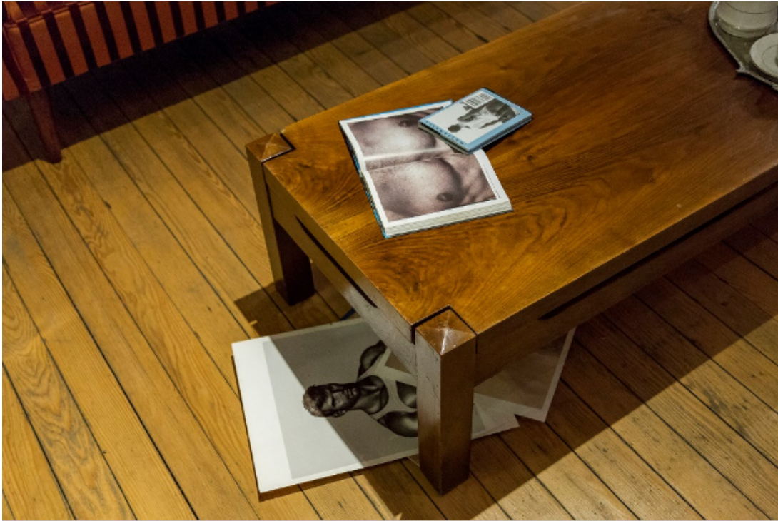
Figure 11. Detail, the Unknown Crying Man Museum , 15th Istanbul Biennale, 2017.

During González-Torres' time, we lacked proper concepts for describing the subjectivity of the audience he targeted (hence the insufficient "stretched subject" previously used in this essay). This is no longer the case. Viral museums are, simply put, museums curated with implicated subjects in mind. Implicated subjects are those who cannot be identified as the victims nor the perpetrators of an injustice and who also elude being characterized as passive bystanders. Implicated subjects overlap, occupy or intersect with sites of privilege or power but without ever directly inflicting harm on others. As described by theorist Michael Rothberg, they are the subjects that make us realize that direct forms of violence can turn out to depend on indirection because they "contribute to, inhabit, inherit, or benefit from regimes of domination but do not originate or control such regimes" (Rothberg, 2019). Implicated subjects cannot be refashioned into victims or perpetrators; they stand in the face of power's oversimplification.