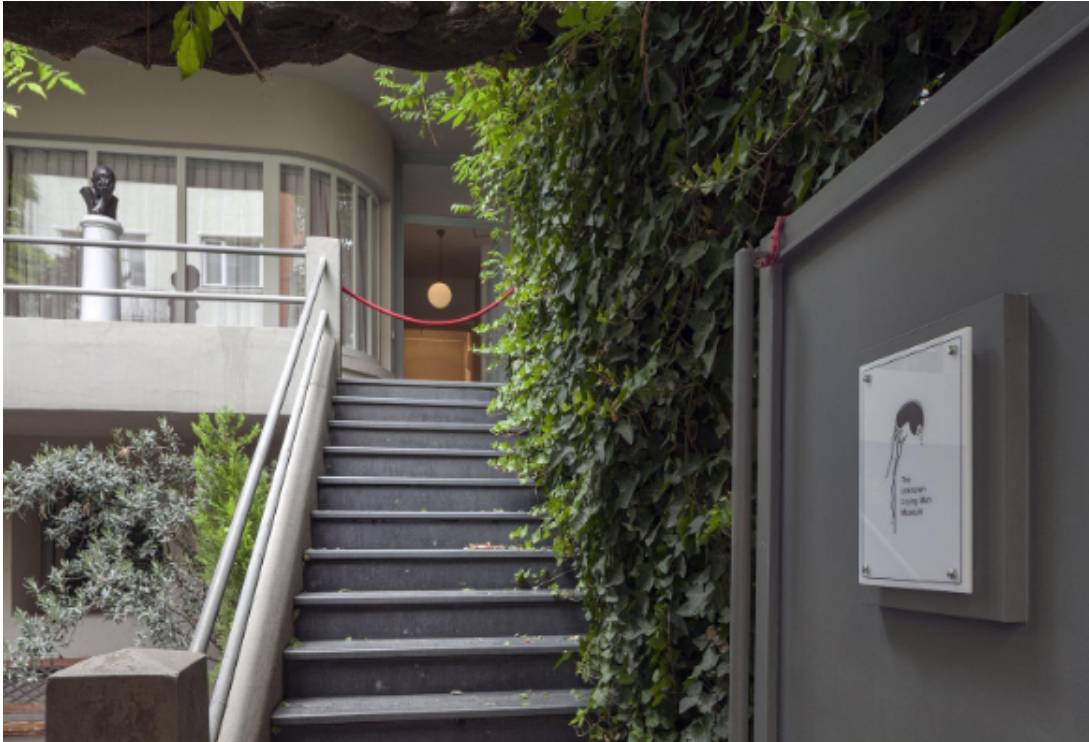
Figure 3. Mahmoud Khaled - Entrance to the Unknown Crying Man Museum , 15th Istanbul Biennale, 2017.

tary: in which the life of a person or place of importance is rehearsed and narrativized using original objects and when permitting, original layouts. Mahmoud Khaled's Unknown Crying Man Museum falls into the latter category, however, it documents a spectral life, or rather, it constructs an entire life based on one document, the photograph of the obscured defendant.