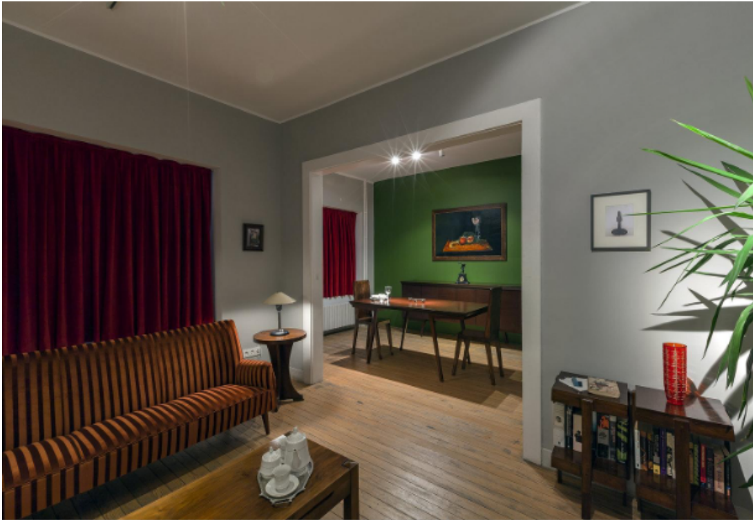
Figure 5. Mahmoud Khaled - living room, the Unknown Crying Man Museum , 15th Istanbul Biennale, 2017.