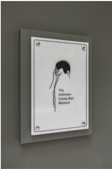
Figure 1. Museum identity for the 15th Istanbul Biennale, 2017

incident as a starting point for developing a museological narrative that engages the audience with the culturally and politically sensitive issue of LGBTQ rights in the current context of Egypt.