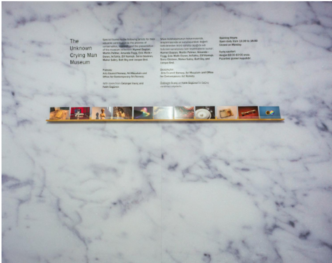
Figure 4. Mahmoud Khaled - the Unknown Crying Man Museum , 15th Istanbul Biennale, 2017.

In the following essay, I address how the artist approaches the thorny and largely discouraged topic of gay rights in Egypt through a tactical repurposing of this particular type or species of museum – the house museum. A tactic, as identified by de Certeau in The Practice of Everyday Life , does not hold a proper place while strategy is about starting from, holding onto and defending a place or position. Tactics always operate on a territory that is someone else’s (Wild, 2012). The Unknown Crying Man Museum inhabits other spaces tactically it also operates on the idea of the house museum — a territory and format that by and large can be seen as one of the building blocks of statecraft; we only need to consider how many house museums for national heroes there are to connect the concept of the house museum to national identity projects.