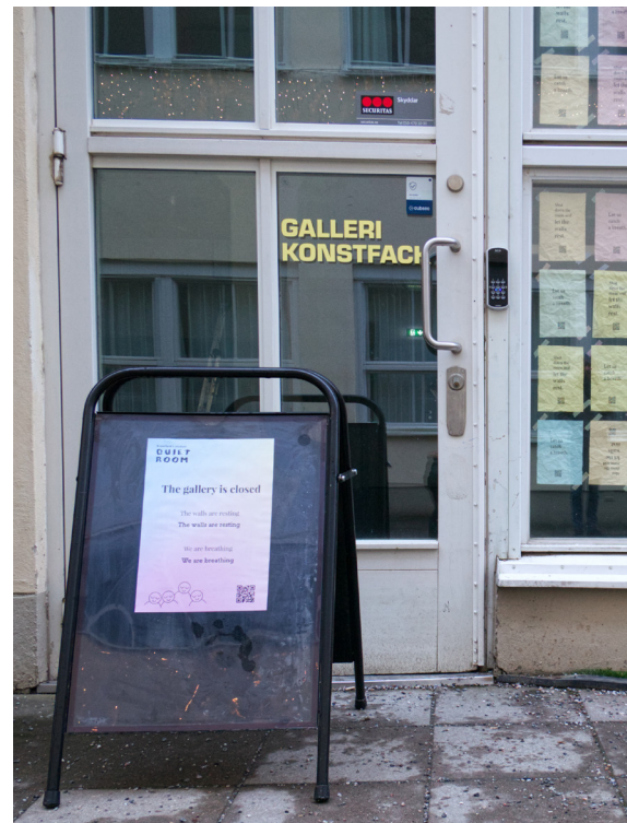
Figure 3. Close-up of pavement sign in front of the gallery.

To conclude, rest is the first step towards breaking away from self-exploitation. Tricia Hersey advances that rest is a form of resistance to what Byung-Chul Han identifies as self-exploitation, a form of hegemonic power evolved from previous systems of power. I suggest that this evolution is akin to how a living organism grows and traced some of Silvia Federici's research on how capitalism was able to evolve from feudalism. An organic body is a site with multiple systems operating simultaneously as one that grows and evolves, which in this case, includes both oppressor and oppressed. This collective body shows signs of imbalance between these two seemingly opposing forces. However, this is a false binary, one that hides the multiplicity implied in such an organism. Homeostasis is the process that living organisms have to self-regulate into a state of equilibrium in order to function well.