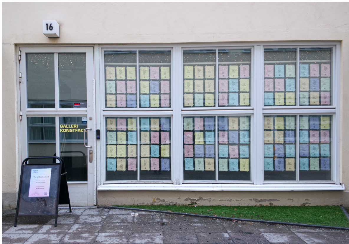
Figure 2. Overview of the facade, windows covered in signs.

The Quiet Room was primarily a valuable learning process.