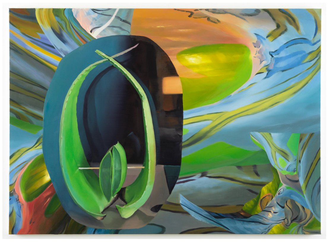
Figure 10. Our Spectral Gardens, The Rift Valley, 2022. Oil on linen, 120 x 165 cm.