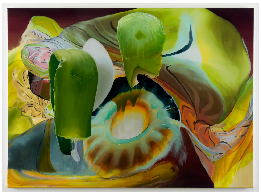
Figure 9. Our Spectral Gardens, Agony in the Garden, 2022, oil on linen, 120 x 165 cm.