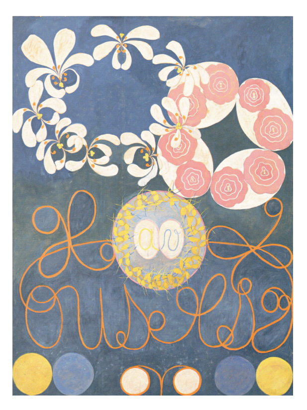
Figure 5. The Ten Largest, Childhood, no 1, Group IV, 1907, tempera on paper laid on canvas, 315 cm x 234 cm,