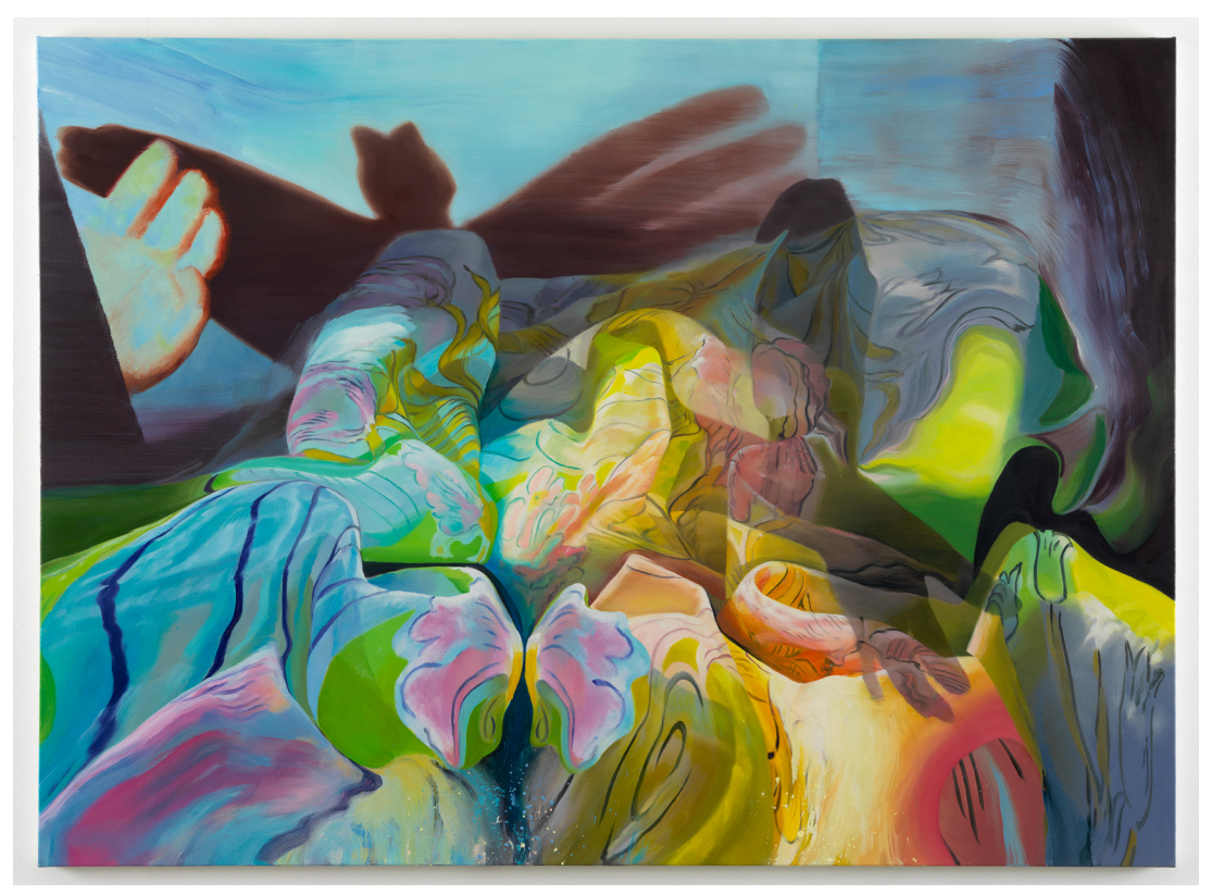
Figure 12. Our Spectral Gardens, The Shadow of Birds, 2023, oil on linen 120 x 120 cm.