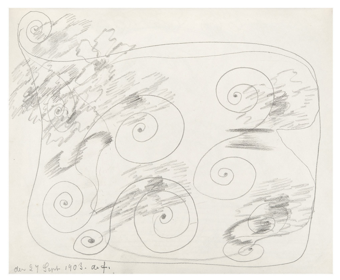
Figure 2. Séance drawing, The Five, 1903. Collection The Hilma af Klint Foundation.

Adelborg's textile archive still exists, and this embroidered tangerine bonnet fig.3 is one of many in the collection, all with the same colors, patterns, and structure. In line with the sumptuary history to which they belong, these rural clothes were designed to encode meaning. They could be read, and caps like this were worn only by Gagnef women and on high days and holy days. If we compare the cap to the circles and tendrils of The Ten Largest, No. 3, Youth we see the same orange ground, with petals and fronds that seem