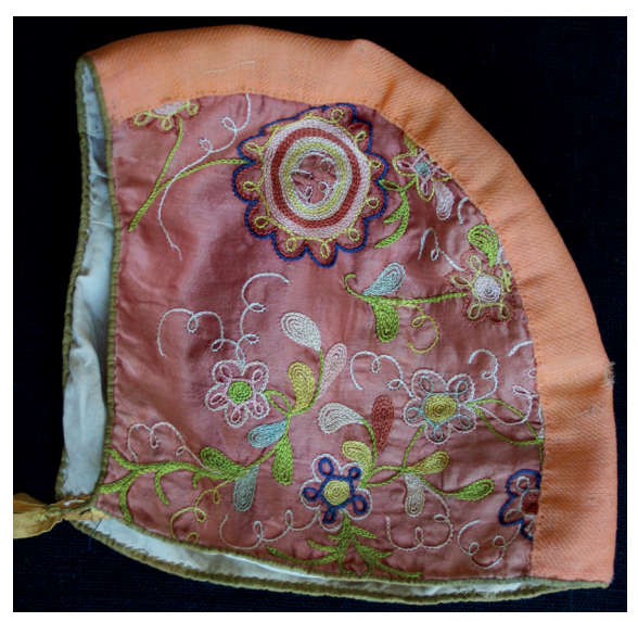
Figure 3: Left: The Ten Largest, Youth, No 3, Group IV, 1907. Tempera on paper laid on canvas, 315 cm x 234 cm, Collection the Hilma af Klint Foundation. Right: Silk bonnet, Collection Stiftelsen Gagnefs Minnestuga GM 1426.

Af Klint described The Ten Largest as "beautiful wall coverings" (Cramer, 2021, p. 5) an approach to painting that she would also have seen in Gagnef, where local people made simple, affordable paintings on large sheets of paper. They stored these in rolls and pinned them on their log cabin walls to mark festive days. They mostly represented local or religious scenes but with a kurbits , an imaginary flowering gourd that represented a complex, Vitalist