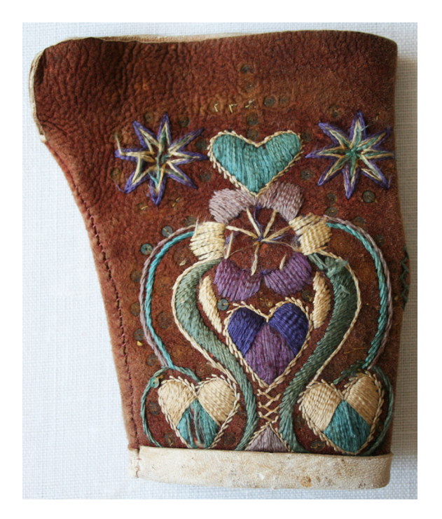
Figure 7. Left: A woman's wrist warmer, Collection Stiftelsen Gagnefs Minnestuga, Dalarna. Right: The Ten Largest, Adulthood, No. 6, Group IV, 1907, tempera on paper laid on canvas, 315 cm x 234 cm, Collection the Hilma af Klint Foundation.

Such ideas of interconnectedness were culturally familiar to af Klint, they were promoted by Ellen Key, and had been interpreted into an idea of all-permeating "ether" in Theosophical thinking.