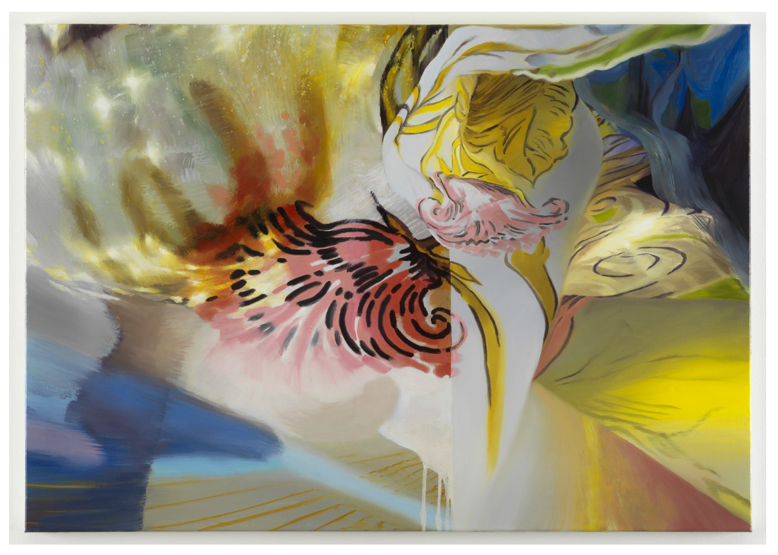
Figure 11. Our Spectral Gardens, The Shadow of an Animal, 2023. Oil on linen, 80 x 130 cm.