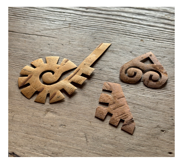
Figure 4. Birch bark stencils of sun, stag, tree frond. Collection Stiftelsen Gagnefs Minnestuga, Dalarna.