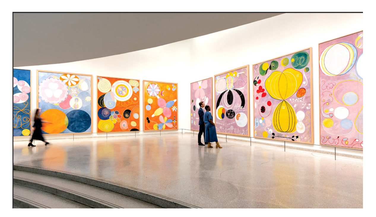
Figure. 1. The Ten Largest, 1907, tempera on paper, attached to canvas. Collection of The Hilma af Klint Foundation, Stockholm. Installed in The Guggenheim Museum, New York, 2018

Af Klint thought of The Ten Largest as defining a single, universal body, both male and female, in a journey through time. The title of each panel reflects a stage in this journey: childhood, youth, adulthood, and old age. The artist wrote that "the form is the waves," (the rolling compositional movements that define the work) and that "behind