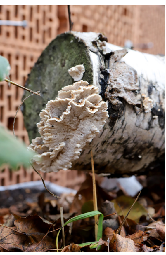
Figure 7: Turkeytail mushroom fruiting bodies appear on the fungi-inoculated wood blocks. Alusta Pavilion. November 2022.