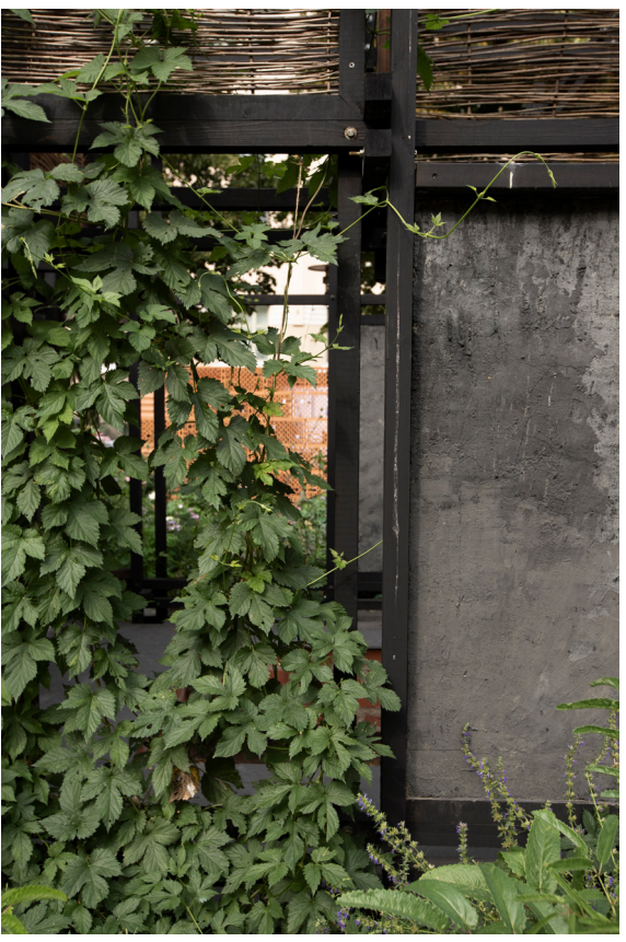
Figure 3: Wooden pergola with panels of woven wicker, partly rendered with mortar made of biochar and raw clay, subject to alteration through erosion. Common Hops (Humulus lupulus) rising to cover the openings of the pergola. Hyssop (Hyssopus officinalis) and Great Burnet (Sanguisorba officinalis) growing in front. Alusta Pavilion. August 2022.