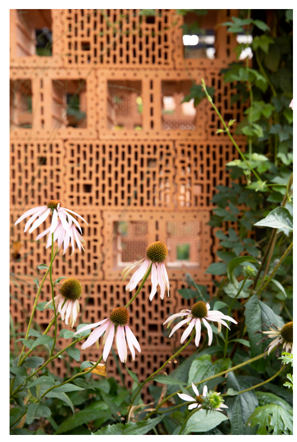
Figure 8 (left): Porous clay blocks. Common Hops (Humulus lupulus) and Purple Coneflower (Echinacea purpurea). Alusta Pavilion. August 2022.

mental categories shifting. In Western dualist pairs, such as human/animal, the lesser one becomes homogenized and seen without the richness of individual features (Plumwood, 1993, pp. 53-55). This attitude began to yield as the designers worked with selecting plants attractive to different kinds of insects with their own preferences for colour and anatomic features. The pollinators emerged as a heterogenous group, with individual needs to be taken into consideration when making the space, and thus the perspective of the designers was enriched.