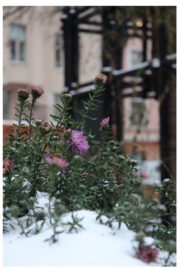
Figure 13 (left): Michaelmas Daisy (Symphyotrichum novi-belgii) flowering in the snow in late autumn. Alusta Pavilion. November 2022.

happen spatially on a scale too small or too broad for us to comprehend. Soil is formed through the geological processes of breaking down rock and the shorter ecological processes of decomposing organic matter. In Alusta, gradual changes are amplified and opened up for human experience, for example through the inclusion of raw clay prone to the effects of erosion. Raw clay used on wall panels made of woven wicker erodes with time as rain washes over it. The panels change their appearance but do not break, rather taking on a new form. The passage of time is embedded in the aesthetic experience of the space. Materials around and in us are in constant flux. Often the pace is outside the scope of our experience, and we mistakenly take it as stability.