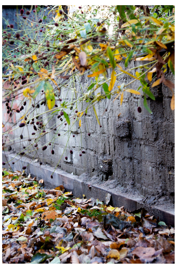
Figure 12: Raw clay bricks erode as rainwater washes over them. Great Burnet (Sanguisorba officinalis). Alusta Pavilion. October 2022.

When considering more than human temporalities, all architecture becomes temporary. In the case of Alusta , this transient quality was heightened. As the pavilion was initially planned only for two growing seasons, the material flows were carefully considered, and the aesthetics of the space were opened for natural changeability.