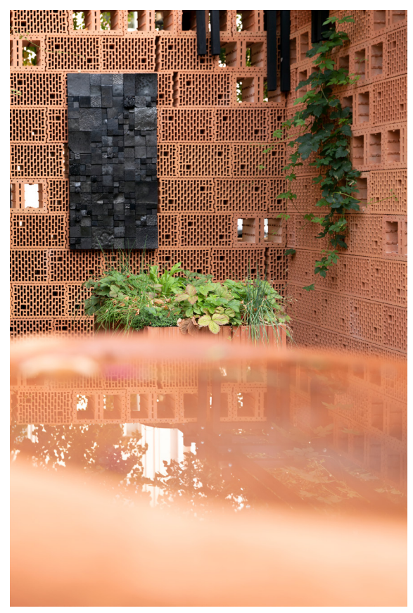
Figure 11: Biochar relief on fired clay wall reflected in water. Plantings of Wild Strawberry (Fragaria Vesca), Lemon Thyme (Thymus citriodorus), Chives (Allium schoenoprasum), and Field Scabious (Knautia arvensis) growing in a mixture of biochar, sand and soil. Alusta pavilion. August 2022.

in its embrace and communicating through the more intimate senses of touch and smell. Bellacasa (2017, pp. 95-97) further argues that thinking with touch can bring about an interconnectedness that questions the Western dichotomies between, for example, emotion and reason. In Alusta , the embodied experience of the space opens through affects in time. Sustainability is approached on the level of emotions as well as through technoscientific understanding.