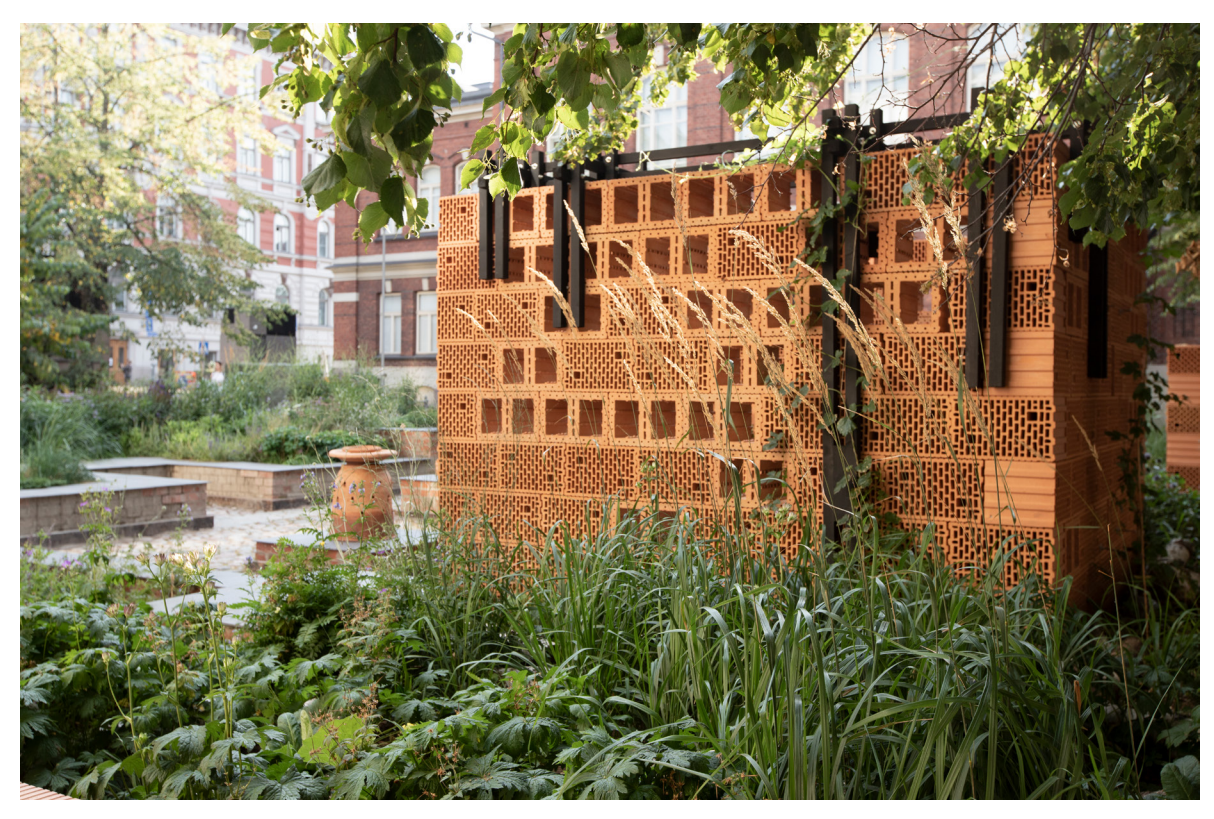
Figure 1: The Alusta Research Pavilion in Helsinki in the courtyard of the Museum of Finnish Architecture and the Design Museum, August 2022.