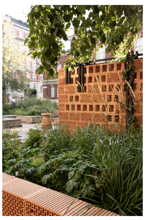
Figure 9 (right): People visiting the Alusta pavilion. Feather Reed Grass (Calamagrostis x acutiflora), Masterwort (Astrantia major), and Woodland Geranium (Geranium sylvaticum). August 2022.

Puig de la Bellacasa (2017, p. 202) draws from permaculture practices calling for more active and in-depth relations between humans and soil. We are part of the food web and thus bound to the cycle of growth, death, and decay, together with all other living organisms. On Alusta , fungi, compost and biochar nourish the soil, supporting the plants who, in turn, offer nutrition for the pollinating insects and birds. Pollinators sustain food crops for human beings. Following a recommendation of the ecologists, fungi-inoculated decaying wood