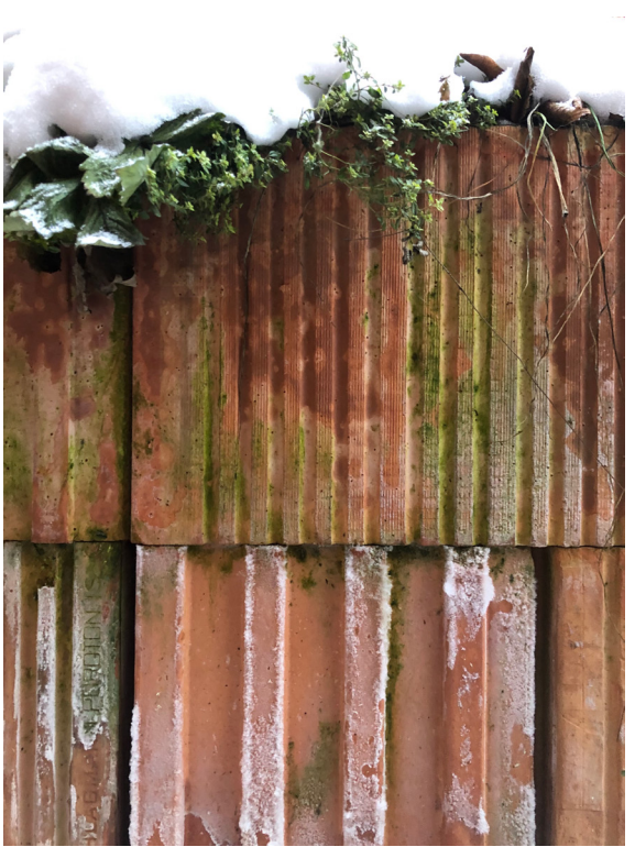
Figure 14 (right): Fired clay blocks with algae and frost on them. Alusta pavilion. November 2022.

The gradual transformations brought on by climate change and loss of biodiversity do not register to us as they happen on a temporal scale exceeding our everyday experience. Could living in an environment that accepts and embraces change help us in understanding the shifting conception of the Earth as a stable environment, and open our eyes to its fragility and sensitivity towards our actions (see