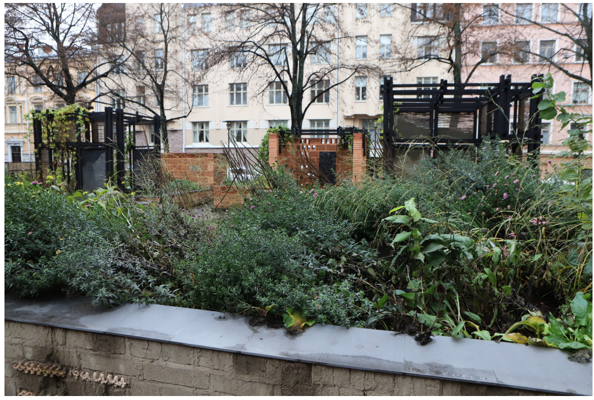
Figure 15: Alusta pavilion. November 2022.

of final forms – changing and shifting instead of stability. This calls for a certain sensitivity towards the continuous transformations of the environment, and a responsiveness to a world in constant flux.