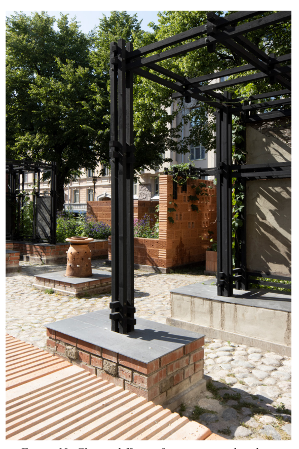
Figure 10: Clay in different forms was used in the construction of the space. The terracotta-colored elements are fired clay, and the grey ones are raw unfired clay. The raw clay bricks contain reed that comes to surface as the structure erodes. The clay plastered elements on the pergola change their appearance as erosion progresses. Alusta Pavilion. June 2023.

The research context enabled the use of experimental materials with potential environmental benefits.