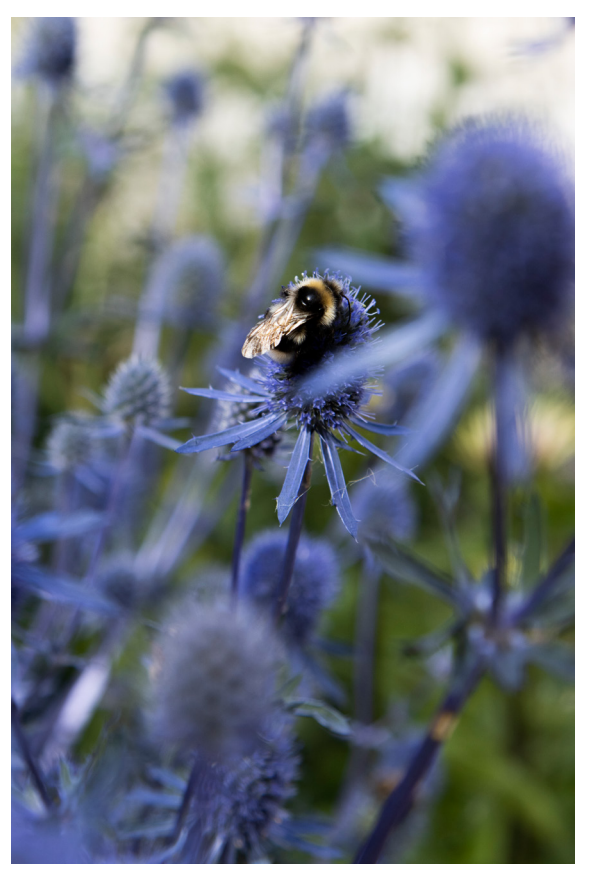
Figure 5: Bumble bee visiting the flowers of Flat Sea Holly (Eryngium planum) to feed on their nectar. Alusta Pavilion. July 2023.

To communicate a tangible example of the interdependence of human existence with the morethan-human world, the designers chose to work with pollinators (Figure 5). The role of pollinating insects in the human food chain and ecosystem sustainability is critical and there is a pressing need to acknowledge their intrinsic and extrinsic value, and to restore their living conditions globally (Van der Sluijs & Vaage, 2016). Alusta is not alone in the attempt to raise awareness towards pollinators through architecture. However, whereas the Pollinators Pavilion by Harrison Atelier, an analogous habitat and AI aided monitoring station for native bees (Harrison, 2020) adopts a high-tech approach, Alusta's low-tech solutions allowed the participation of students and community in the construction. This rendered the process of making, as well as the pavilion itself, an educational tool. The high-tech approach may also make adopting environmental construction less accessible due to costs and availability of technology. In contrast to experimental architectural projects to be experienced through digital means such as the Pollinator Park designed by Vincent Callebaut<sup>[3]</sup>, Alusta offers a tangible experience of multispecies co-existence. It also opens the space up for alteration through the passage of time and the effects of natural processes. There are various examples of projects revealing hidden potentials for biological as well as cultural