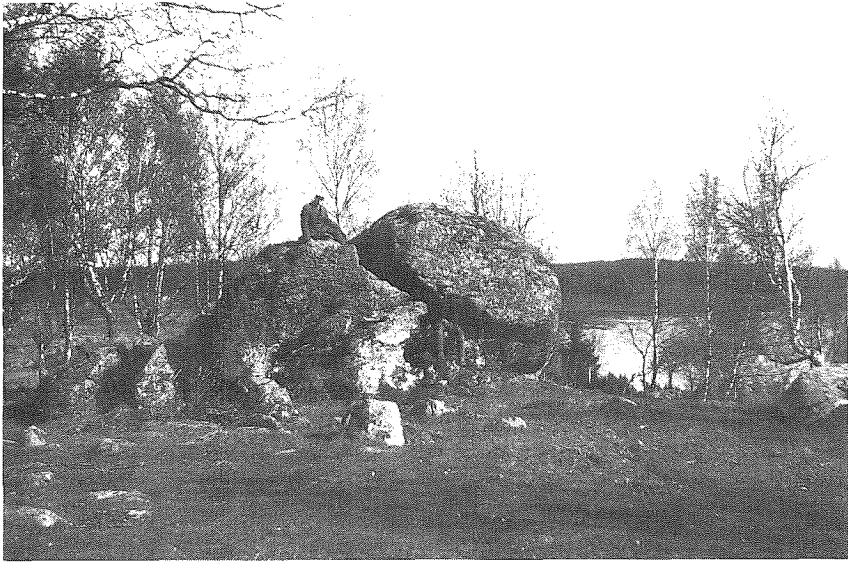
Fig. 1. The plateau of cape Hiidennokka in Vesilahti, Narva, in Häme (Finland) is a bonfire site. There is a cemetery (four barrows) from the end of the sixth century and a sacrificial fount on the same site. A plateau and stoniness are the most common features of “Hiisi” sites.