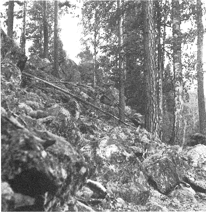
Fig. 6. A slope of bulder soil in Hiidenkallio in Hauho-Tuulos (Häme).

Stoniness is a feature of several “hiisi” sites in Estonia and Finland which are characterised by a stone construction of some kind, sometimes a lowish stone mound (Figs 7 and 8), or otherwise a circular formation often with the addition of one stone larger than the rest; another common feature is a large stone (a glacial boulder) or several relatively large stones (Figs 1, 9 and 10). Both grove and mount types are often characterised by a clearing, a plateau which was apparently the sacral focus of the cult place, as well as the setting for the stone arrangements.