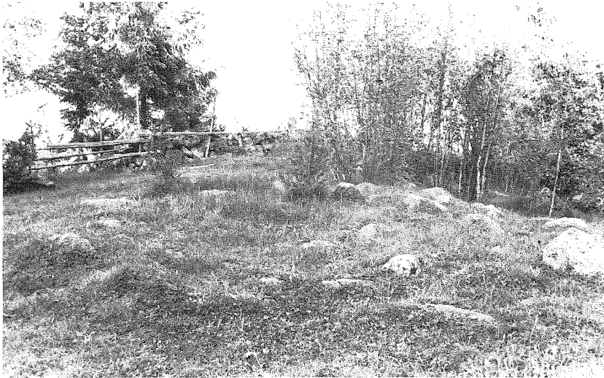
Fig. 2. Hiidenmäki in Karkku, Kojola, in Satakunta (Finland). The stones are arranged to form an enclosed area and set in a grassy plot which has been tramped flat. This was a site for ritual bonfires and, according to folk tradition, it was also used for sacrifices.