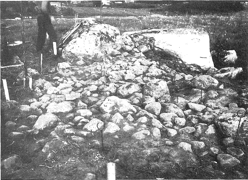
Fig. 8. The stony mounds of the burial ground (from the Migratory and Merovingian periods) exposed in Hüdentöykkä in Huittinen, Loima (Satakunta).