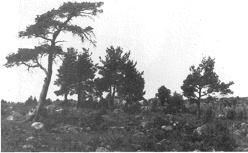
Fig. 7. Hiie pank in Varbla, Allika (Estonia). Many of the “hiis” sites on the western and northern parts of the Estonian mainland are gentle mounds within level fields, and they are characterised by their stone quality.