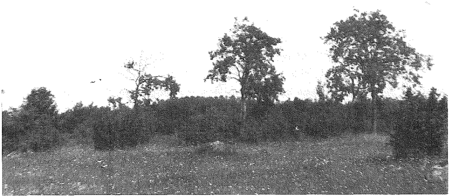
Fig. 4. Hüie mets in Lihula, Sipa (Estonia), is a small copse on marshy ground.