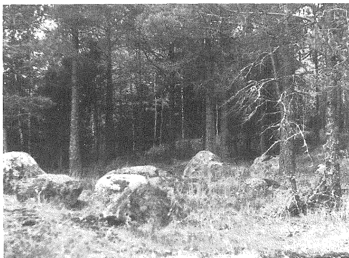
Fig. 3. The plateau with circular stone formation on the hill Hiidenpellonmäki in Masku, Villilä (Finland) may have been the nucleus of the “Lunda” mentioned by the Pope in 1232.

never completely successful. In this sense, place names in Orthodox areas might easily have preserved manifest evidence of a word meaning ‘cult place’, but the cult’s dependence on specific “holy places” in eastern Orthodox areas seems to have differed from the situation in, for example, Estonia. The cult of the dead was held at graveyards which were still in use, and other cults, especially fixed seasonal rites which involved the whole village or a large group, were just as readily practised in any large yard or in front of the village chapel ( tsasouna ), as at a given natural site (Harva 1948, 503–509; Haavio 1959, 142; see also Haavio 1961). Since, in the Ladoga region and in Ingria, the topographic characteristics of places whose names contain the component hiisi are largely the same as those in the Western Finnic regions (land elevation), there is good reason to suppose that they were also named according to the same principle, at least in the beginning. In the lexica of the languages in question, however, the word hiisi does not seem to have meant ‘non-Christian cult place’ during the Christian era. We may at least presume that in Orthodox Karelia and in Ingria there existed no pragmatic necessity for such a definition, insofar as any word might have applied in this function.