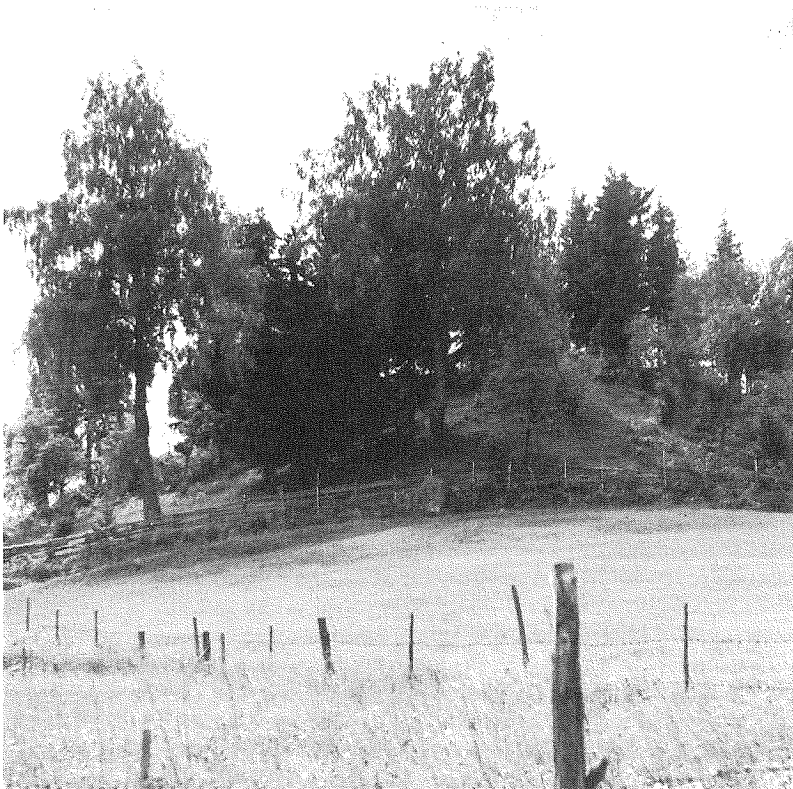
Fig. 5. The gravel mound Hüidenmäki in Asikkala, Kurhila, is a typical “ hiisi ” site in South-east Häme.