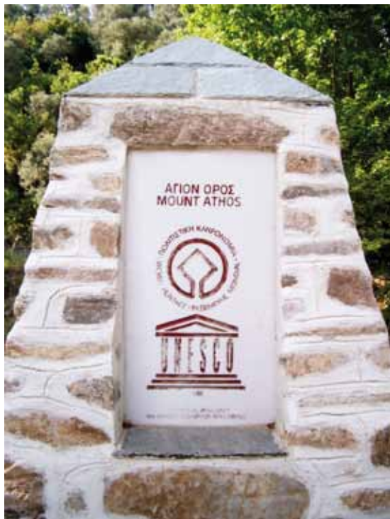
Mount Athos is inscribed on the World Heritage List of UNESCO.

‘pilgrimage’. Therefore, I shifted my focus from the concept to the word ‘pilgrimage’, denoting the human phenomena of visiting holy and sacred places, persons, mountains, wells and so forth.