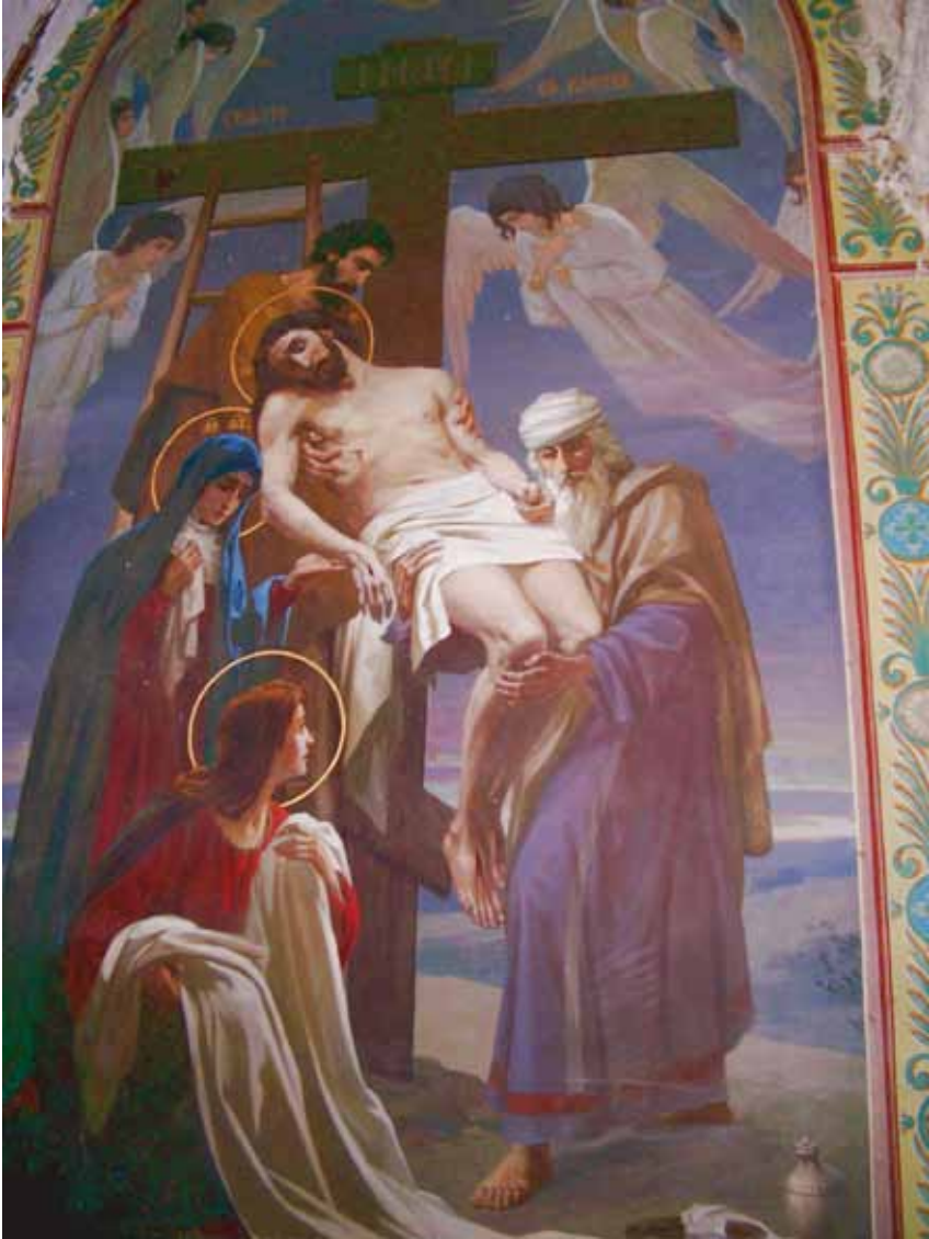
The taking down of the body of Christ from the Cross.