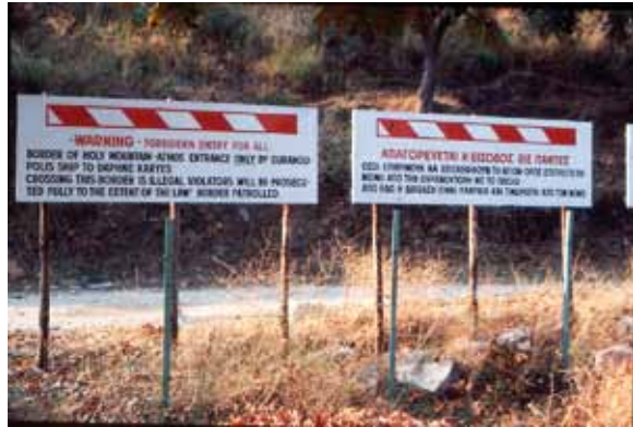
The fence at the border of the Holy Mountain of Athos.

Altogether there are today about 2,000 Orthodox monks living on Mount Athos and each monastery also has a number of lay workers helping the monks with the maintenance and the refurbishing work on the monastic buildings and churches. More than 100,000 men visit the monasteries on this Holy Mountain every year.