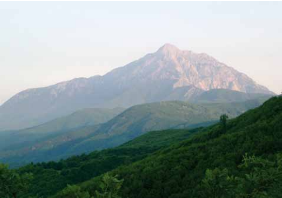
The peak of Mount Athos.