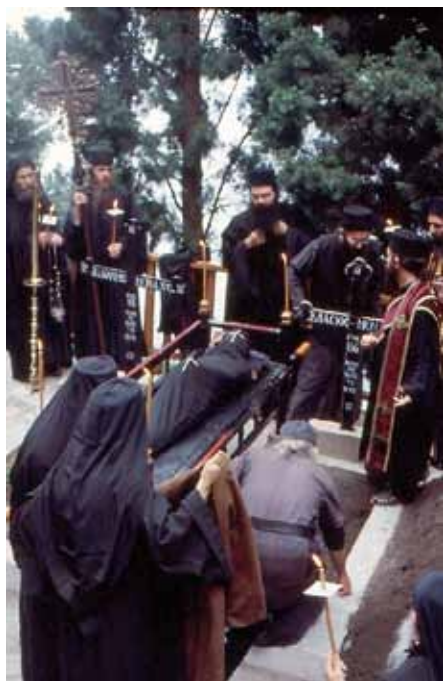
A burial in the monastery of Dionysiou.