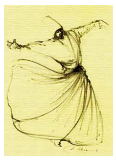
Whirling Dervish. Design Ingrid Schaar, http://www.sufism.20m.com/mesnevi.htm.

a Sema)* has been offered to viewers only in December, but today in certain restaurants after eating Mevlana, which is a name of meal (a kind of pita), the show is offered to customers, as a kind of talent show or movie. It has become a tradition to, before the show, to buy souvenirs popular among both domestic and foreign tourists: Mevlana sugar and Mevlevi bric-a-brac.