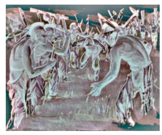
An artistic view of running the gauntlet, a test almost every male captive was forced to pass in the Eastern Woodlands. Original painting is computer enhanced by the author from Löfgren 1959.

were also highly valued. The Eastern Woodlands tribal world is very characteristic in this matter. Women and children were the prime targets as captives, not to be killed or tortured, but to be adopted into the tribe. Actually this adoption became institutionalized in the course of bloody tribal warfare, where numbers of casualties were sought to be compensated in this way. At least during colonial times when the tribal