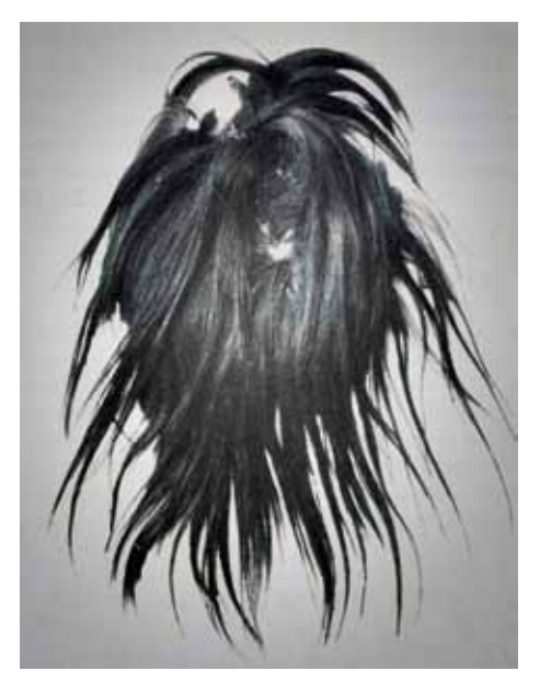
A genuine scalp (National Museum of Denmark). The photograph is computer enhanced by the author from Birket-Smith 1972.

best however. And now, this historical panorama is changing once again. Starting this time in the 1980s, and in the field of archaeology especially, a completely new set of insights have arisen. Anthropologists are also reading their documents anew by using Ockham's razor instead. And what is the consequence of this?