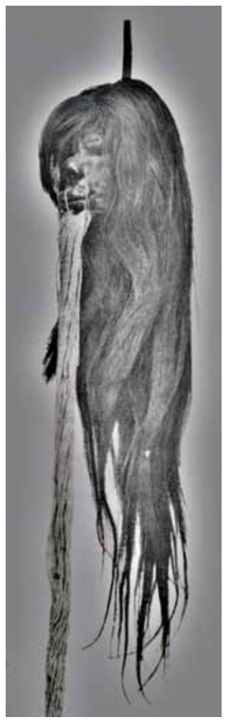
South American Jivaro-Indians are famous of their shrunken heads. Headhunting was common in South America, while scalping was practically unknown. The photograph is computer enhanced by the author from Birket-Smith 1972.