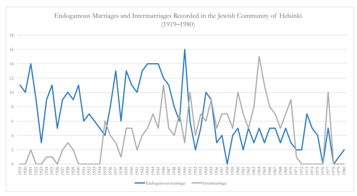
Graph 3. Endogamous marriages and intermarriages recorded in the Jewish Community in Helsinki (1919–80)

were officiated by members of Evangelical Lutheran – often traditionally Swedish-speaking – congregations. According to the currently assessed data, there were approximately seventy female members of the Jewish community marrying a non-Jewish man, and approximately more than hundred and seventy men, who married non-Jewish women. According to the currently available material, none of these men converted to Judaism, and only a very small percentage of the women 'took on the yoke of the Torah'.<sup>9</sup>