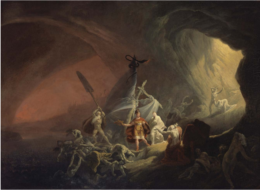
Aeneas and the Sibyl . Unknown artist, 19th century. Yale Center for British Art, Paul Mellon Collection.