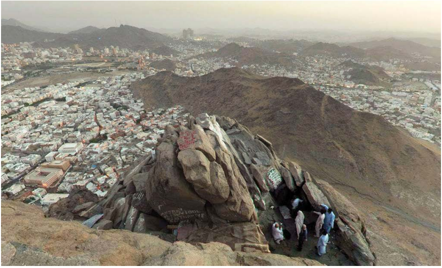
Cave of Hira.

tablet upon which the words of the Qur'an were being inscribed. Up to this point, we can see that Muhammad encompasses the traits of prophet-hood: he retires to reflect on the historical conditions of his people, perceives the sufferings and aspirations of a community, and points out the need for change. On the other hand, not all mystics return to society. There are hermits who remain in caves and cloisters, and that for them is perfect peace.