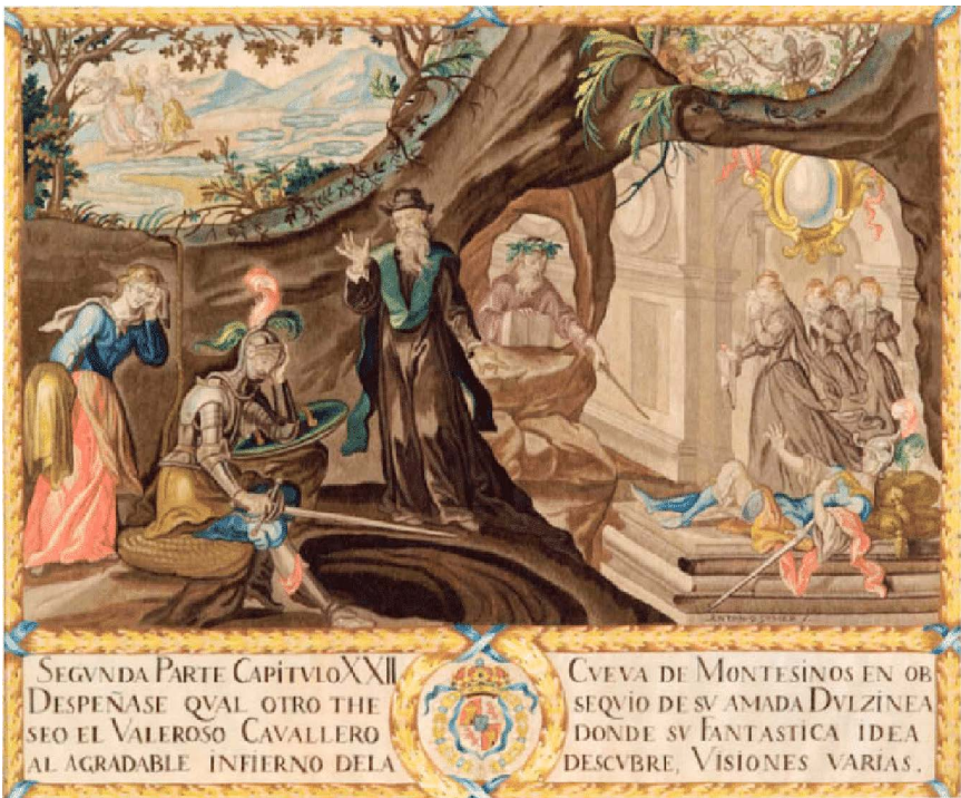
Don Quixote in the cave. Antonio Gómez de los Ríos, Don Quijote en la cueva de Montesinos , tapestry from the eighteenth century (in Lenaghan 2005: 69).

The visions are now suddenly majestic: a crystal palace full of transparency and purity. Similarly, the glass palace appears also in Tristan and Isolde , in the Folie d'Oxford (c. 1200) and in the alchemical text The Green Dream (n.d.) attributed to Bernard Trevisan (1406–90) in which the protagonist also falls into a deep sleep and meets a 'venerable' old man with silver hair. For Teresa of Avila, the inner castle is a simile of the soul addressing God and is made of glass. Then comes the meeting with the master Montesinos, also described as full of light, who guides him inside the cave. Don Quixote experiences a period of confusion, and he is given the experience of confrontation with death through the vision of an ancient knight (Durandarte, who, together with Montesinos are figures from a group of Spanish ballads of Carolingian chivalric derivation) lying in a sepulchre with his heart sprinkled with salt – note here the reference to the heart in the cave setting, yet with a different meaning than that of Saint John of the Cross.