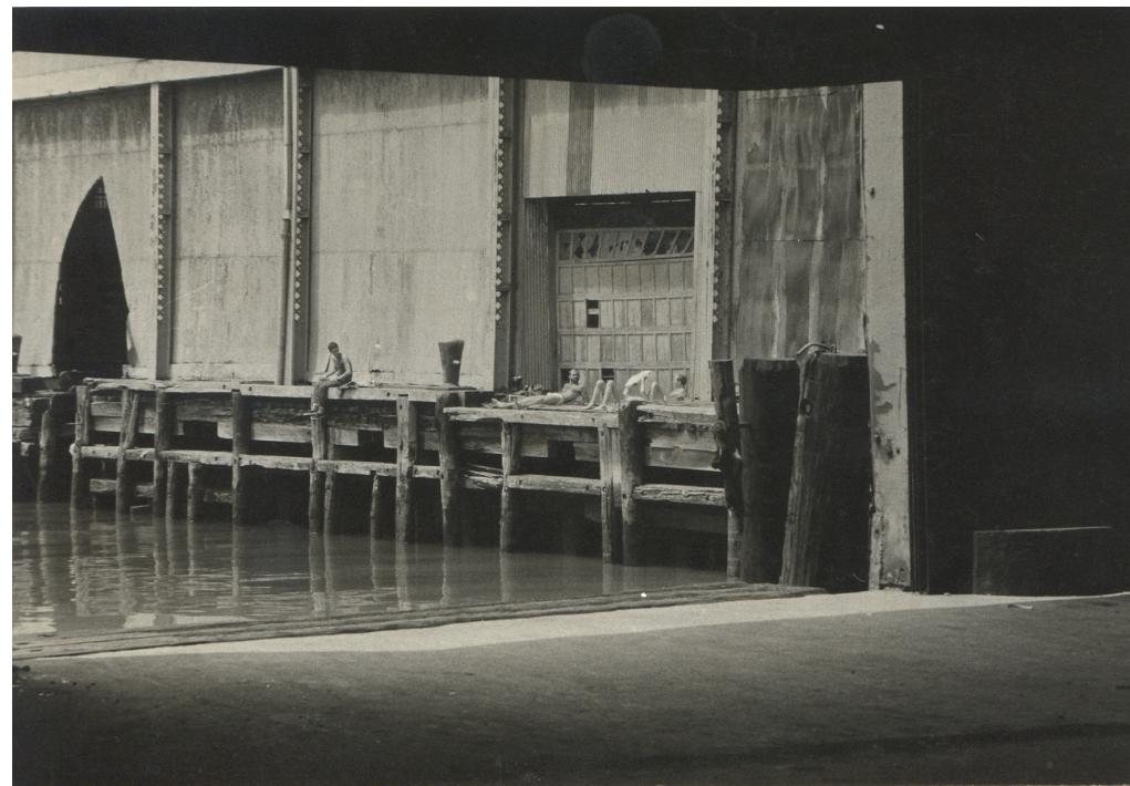
Fig. 1. Alvin Baltrop: Pier 52 (four people sunbathing near Gordon Matta-Clark's Days End) , 1975–1986.

Architectural destruction is the subject and backdrop in many photographs taken by Baltrop and American photographer Peter Hujar. In Pier 52 (four people sunbathing near Gordon Matta-Clark's Days End) (1975–1986) Baltrop captures four African-American and White or Latinx men partially nude and sunbathing on a wooden shipping dock with the Hudson River below. [Fig. 1.] Because the intimate scene is photographed from a