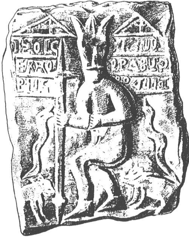
Fig. 4. The bas-relief from Shumen.

What concerns Nagyszentmiklós we must keep in mind the following statement by Németh: «As to the phonetic stock of the material I wish to remark and even to emphasize that the Old-Turkish z is represented by z ( s ) ( čeriz , egiz ~ Chuvash sêvar ). Thus here also, there is no trace of anything Bulgarian. The word egiz represents a typically Kypchak form [...] I emphasize here again: the forms of the Turkish words in our inscriptions are always old Kypchak forms.» 26