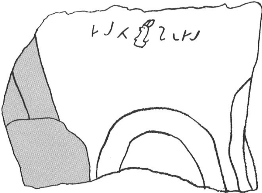
Fig. 3. The shamanistic inscription from Monastira. After M. Moskov.

certain whether we are dealing with outlines of real signs or with crackings of the stone. The list of the signs that can be identified is worth to be noticed. Alongside with banal signs like | ↓ λ X < Λ √ Υ ∨ there appear some more characteristic ones like ⊥ ∩ ∩ ∩ * † ‡, some of which are known from Murfatlar, or a ligature like ∩∩. It should be observed, however, that in the Čukurovo inscriptions we do not find those signs from Murfatlar that are supposed to be related with Slavic letters like † ‡ ∩ ∩. On the other hand, signs like † ⊥ or ∩, do not seem to have existed in Murfatlar. Only a few signs from Čukurovo ( √ √ ) can be found in a short shamanistic inscription from Monastira by Ravna 19 (Fig. 3).