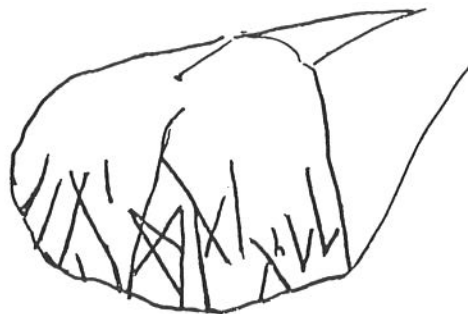
Fig. 2. Sample of the Čukurovo inscriptions. After R. Sefterski.

The topic of Sefterski's second paper, titled «Runičeski nadpisi ot selo Čukurovo, Sofijsko» (Runic inscriptions from Čukurovo village, Sofia district), are copies of another runiform inscription, also found among Ivanov's papers. 16 This time we are given fourteen reproductions of Ivanov's copies (Fig. 2).